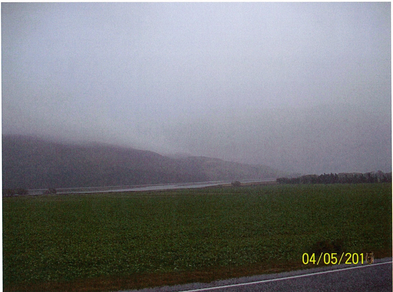
(After 30mm rain over 20hrs) – river up already over river flats!