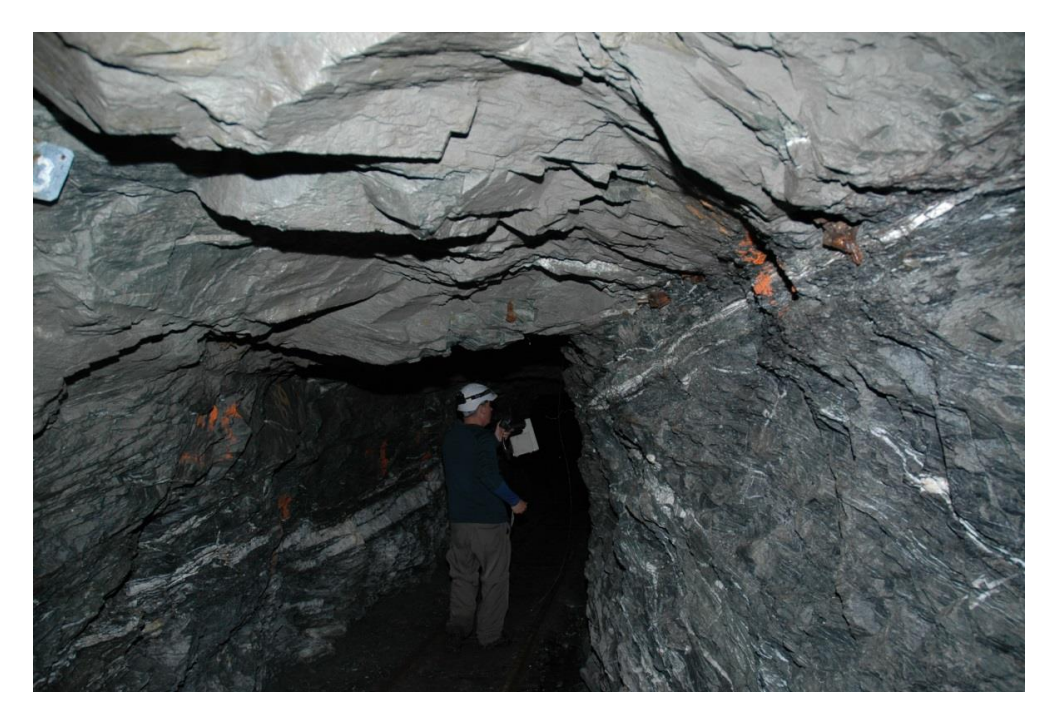
Figure 1 - Scheelite bearing reef in the State Mine within the GHL

8.3 Modern mining methods and technologies allow focussed and highly planned mining operations ensuring that physical effects of mining on the environment will be minimal, limited and temporary.