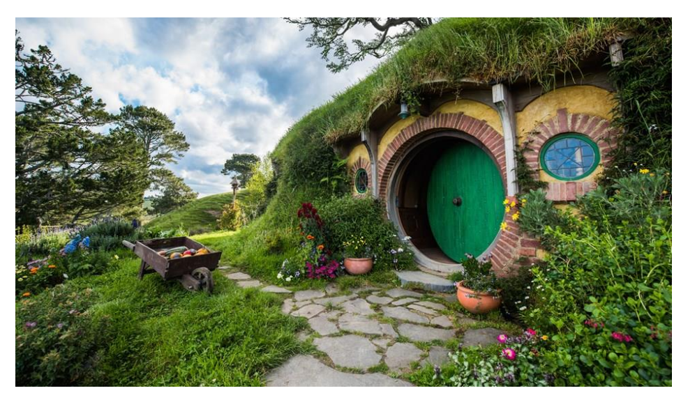
Figure 2 -Potential "Hobbit" style mine entrance

8.8 The processing of rock to recover scheelite initially requires crushing of the rock, after which the high density of scheelite allows it to be concentrated and recovered in a manner very similar used to recover alluvial gold.