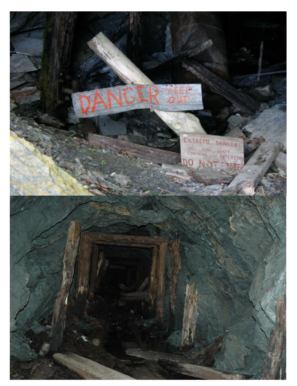
Figure 3 - Existing mine entrance that can be made safe,