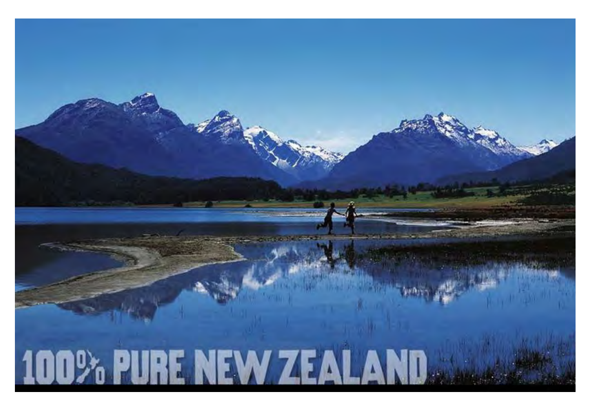
Figure 2: View north across Diamond Lake, used as part of the 2015 Tourism NZ 100% Pure campaign. Arcadia RV Zone is visible on the far shore of the lake.

The landscape is important to the shared cultural identity of the Districts' residents, and to some visitors from within NZ. Memories of views and experiences within the landscape can form part of people's attachment to New Zealand as a 'place'.