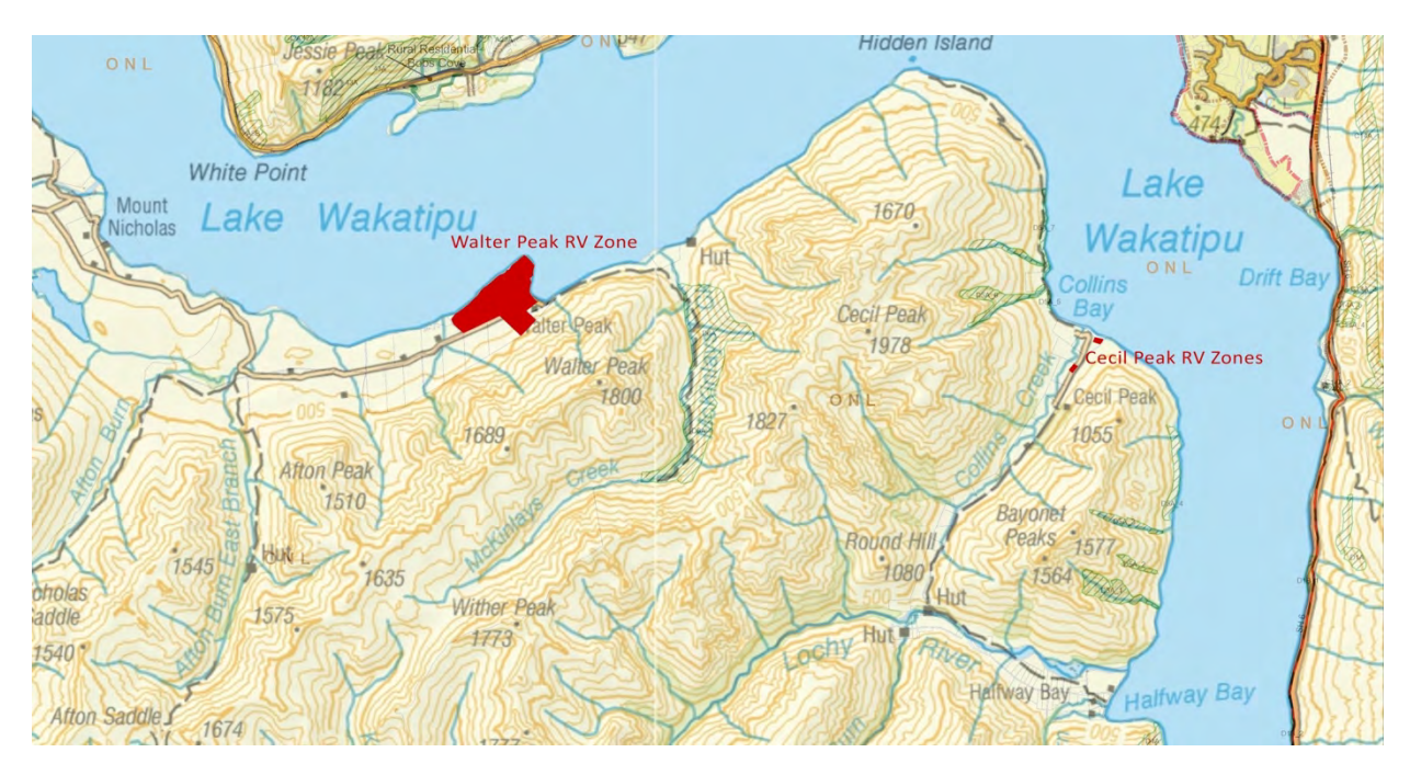
Figure 6: Location of Cecil Peak and Walter Peak RV Zones.

The Cecil RV Zones are two relatively small areas of land at Cecil Peak Station on the western side of the southern arm of Lake Wakatipu (refer Figure 6 below). The zones were established for visitor activity in 1983 and carried over into the ODP in 1995, but have never been developed. The zones are only accessible from Queenstown by boat or aircraft.