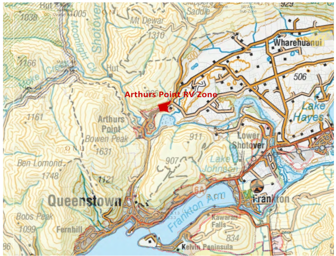
Figure 3: Location of Arthurs Point RV Zone.

The Arthurs Point RV Zone was created as a result of submissions to the 1995 Proposed District Plan. It is located within the Arthurs Point Basin between the toe of Mt Dewar and the Shotover River (refer Figure 3 below), about 6 kilometres north of downtown Queenstown. The zone is close to the suburban development of Arthurs Point township to the west and also adjoins a Special Housing Area that has been zoned Medium Density Residential in the PDP.