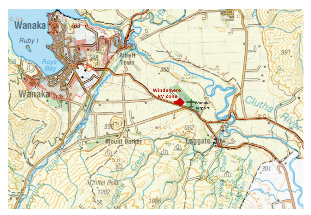
Figure 7: Location of Windemere RV Zone.

The land was zoned RV as a result of an appeal to the 1995 ODP decisions, and special planning provisions were applied in order to recognise the proximity of the zone to Wanaka airport. Residential uses other than a single unit for on-site custodial purposes are non-complying in the zone and visitor accommodation is discretionary within the Outer Control Boundary of the airport.