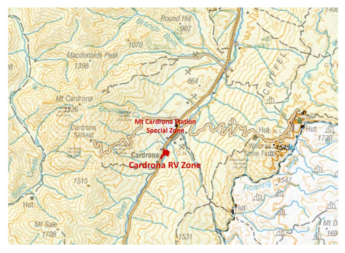
Figure 5: Location of Cardrona RV Zone..

The Cardrona RV Zone is located in the Cardrona Valley, about 23 kilometres from Wanaka (refer Figure 5 below). The zone was carried over from a Rural Tourist Zone in the Transitional Plan but was extended considerably to the east as a result of a submission to the 1995 Proposed District Plan. The ODP also included a larger RV Zone to the north on Cardrona Valley Road – the Mount Cardrona Station RV Zone. A later plan change modified the extent of and provisions for this zone, which became the Mt Cardrona Station Special Zone.