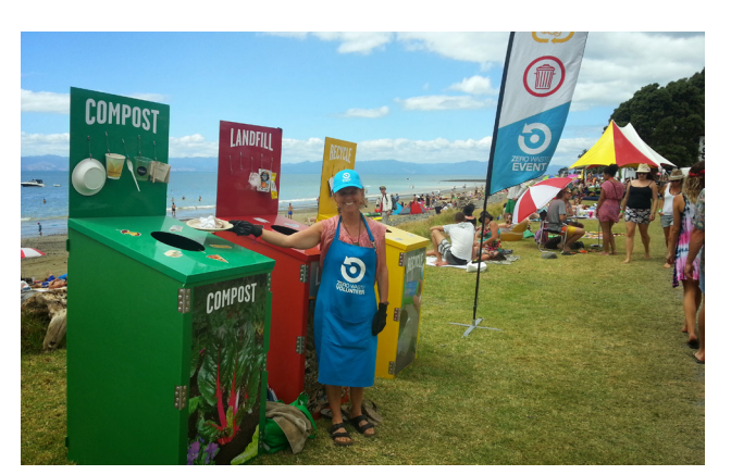
Splore Music Festival - flag marks the recycling station