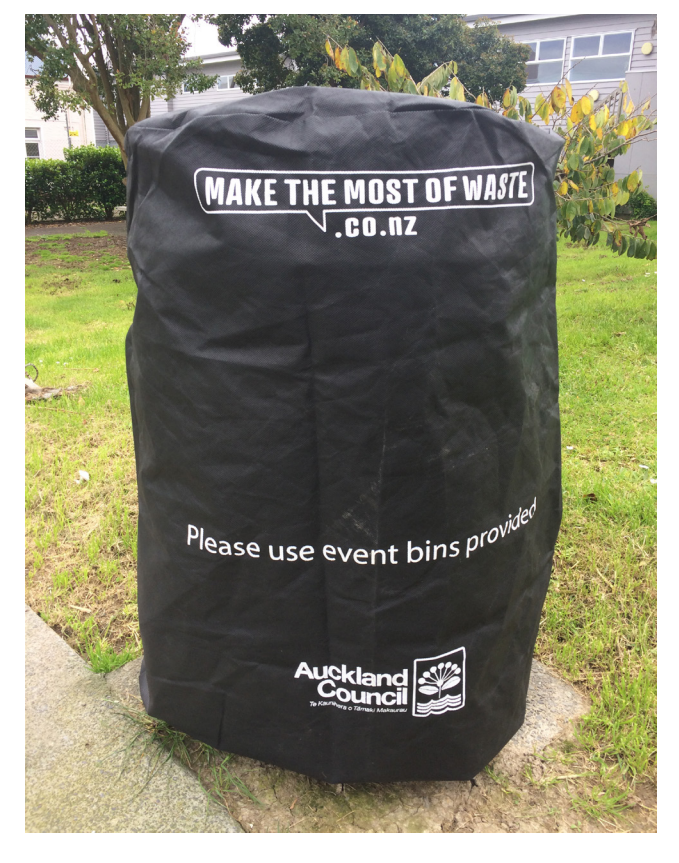
Auckland Council bin covers