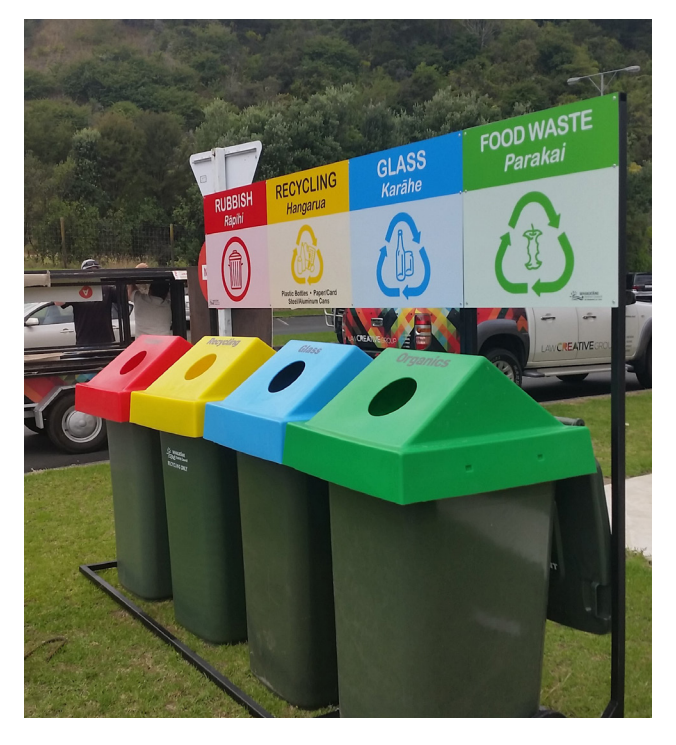
Loanable event kit from Whakatane District Council freestanding backing boards