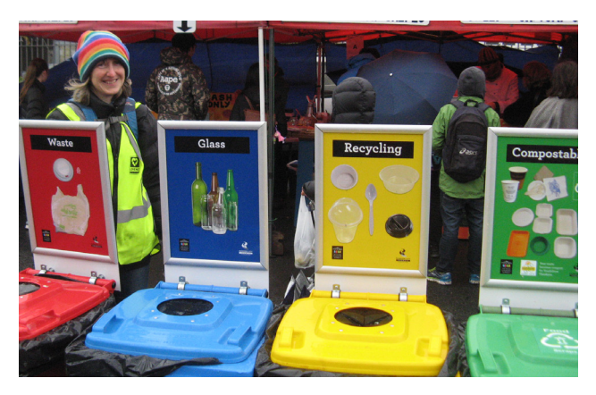
Dunedin Farmers Market - signs clipped with brackets