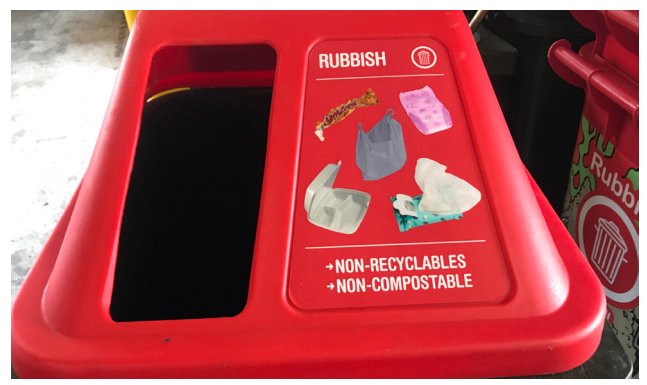
Bin lids from Clean Events Ltd

3. Fabric bin covers – these need to be purchased separately or can sometimes be hired from your local council or waste company.