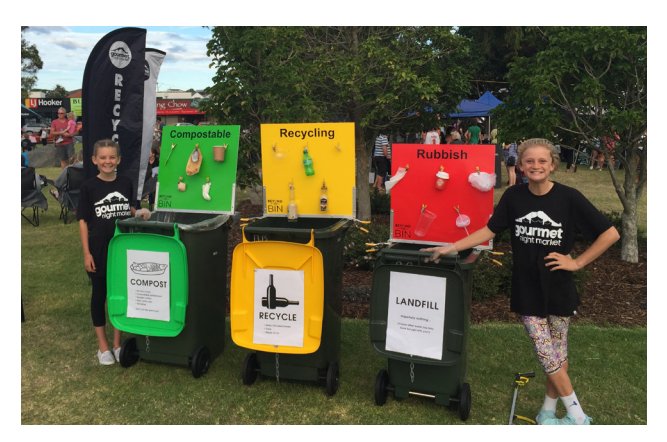
Gourmet Night Market Tauranga - signs on flipped lids, clipboards and flags

Use your bin lid by placing a sign on the inside and outside of the lid. In fine weather the open bin lid acts as additional signage and in wet weather the closed lid does the same.