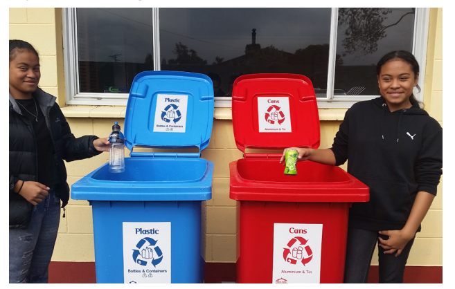
Para Kore Recycling on Marae Program - New Zealand recycling symbols - stickers on side and lid of bins