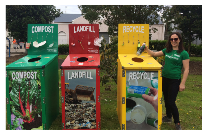
Loanable events kits from Auckland Council - bin surrounds

5. Bin surrounds – these are free standing boards that wrap around any existing bins. They are useful if the existing bins don't follow the standardised colours.