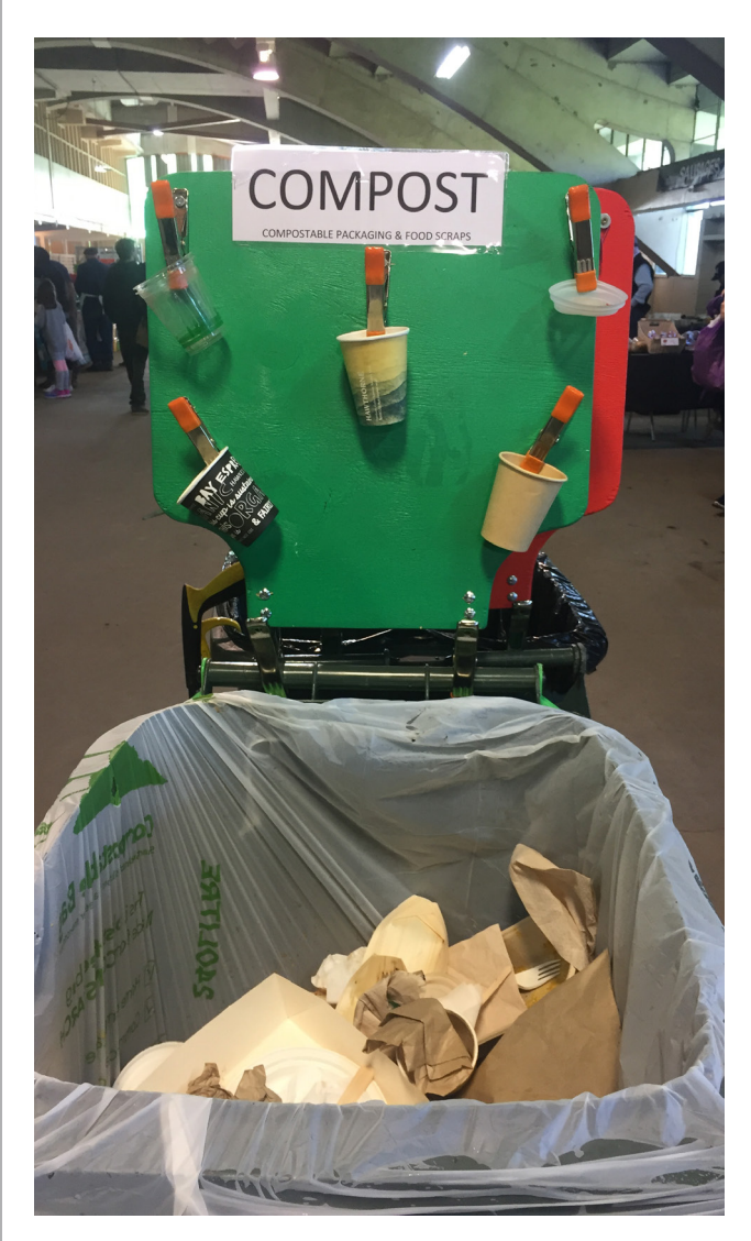
Hastings Farmers Market – actual items from vendors attached with clips

Have a plan in place if the objects go missing or fall off. Will people still know what to put in each bin? If you are using actual objects you should also include words and/or symbols somewhere on the signage in case the objects are knocked off mid event.