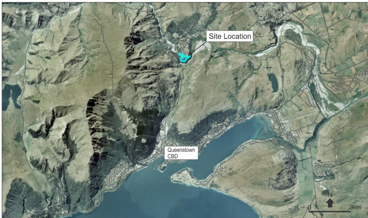
Figure 1. Aerial view of proposed development site location.

The site is located on the northern side of the Shotover River at the southern end of Atley Road, Arthurs Point, Queenstown, see Figure 1 below.