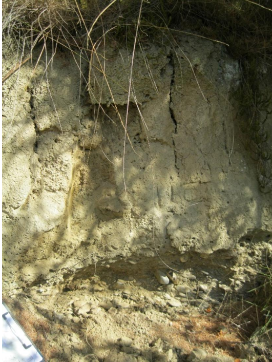
Photo 3: View SW, northeast corner of site. Loess (silt) over terrace alluvium. Loess is ca 0.5m thick.