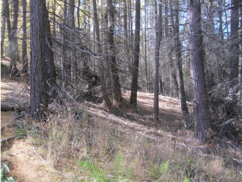
Photo 1: View east, northeast corner of site, buildable terrace, gently sloping.