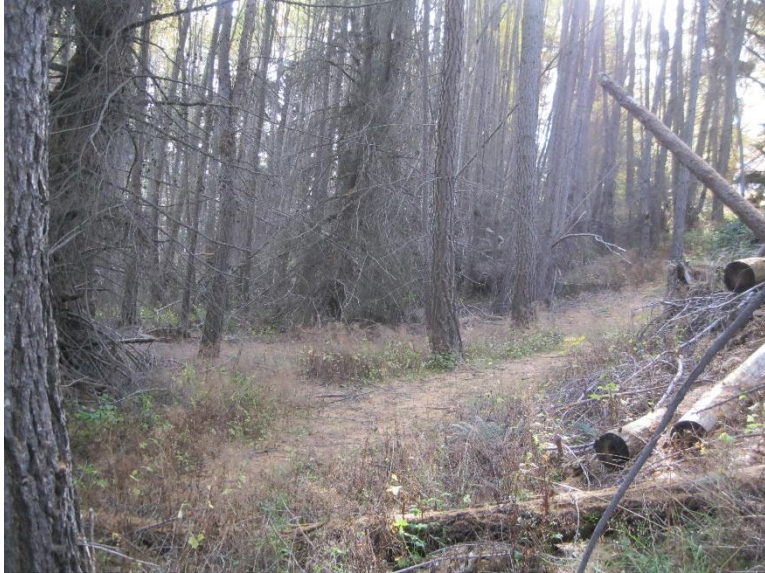
Photo 7: View NW, terrace, partially cleared. Atley Road in centre right (obscured).