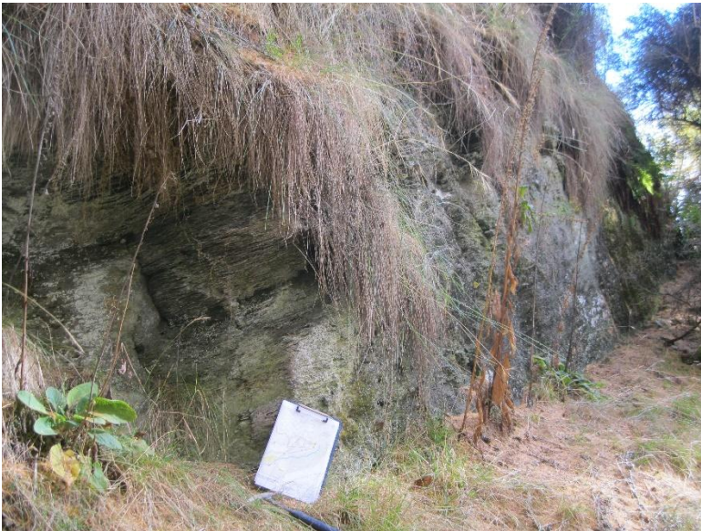
Photo 2: View SW, schist outcrop in northeast corner of site. South dipping foliation, main NW-trending joint set controls face profile.