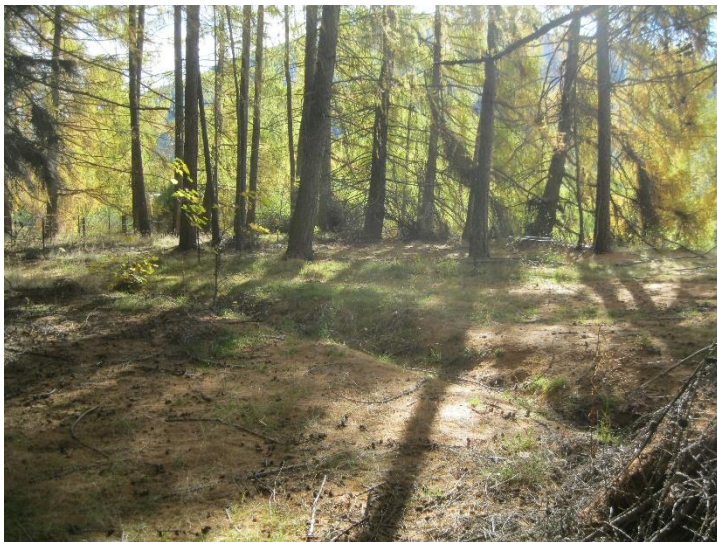
Photo 4: View north, northeast corner of site. Terrace, showing old trench draining to the right.