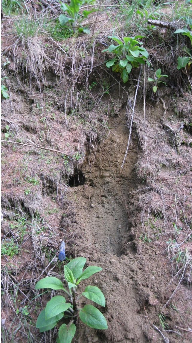
Photo 11: View north, weathered terrace alluvium in bank above road cut. Overlies schist.