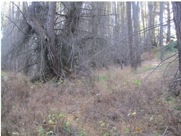
Photo 8: View north, terrace area bordered by gentle slopes. Atley Road in centre right (obscured).