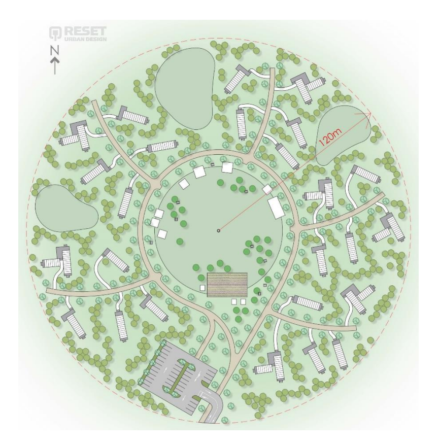
Figure 2: Proposed Nautilus Modular Community layout