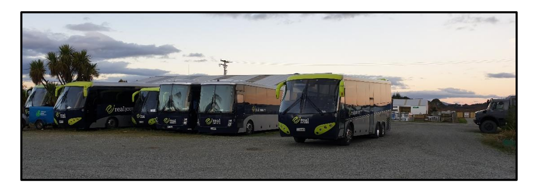
Figure 3 - Unused coaches in Real Journeys Te Anau Workshop Yard

33. To right size our business to the current market, we have curtailed product offerings not only in the Queenstown Lakes District, but across our entire Fiordland operation. This has led to a reduction in our workforce right through our business. Impacting on the employment opportunities and economic wellbeing of the District as many of the staff we employed had a role tied into our Fiordland operations. For instance we employed in excess of 20 Queenstown based coach drivers pre-COVID-19 and now with only one coach on the road we only have two Queenstown based drivers.