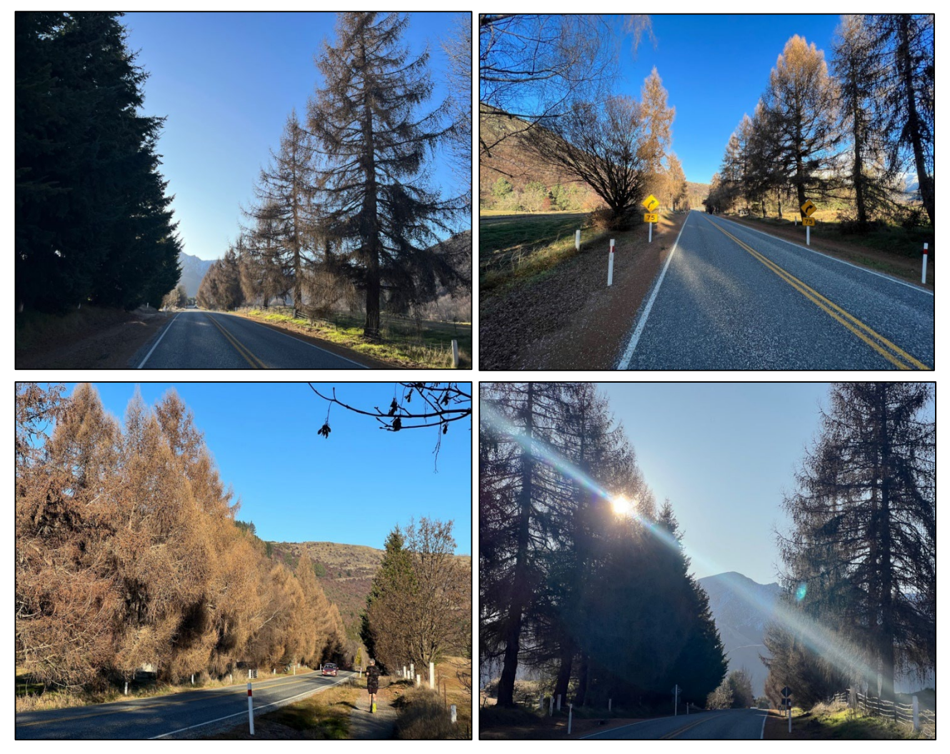
Figure 2: Overview images of avenue of trees