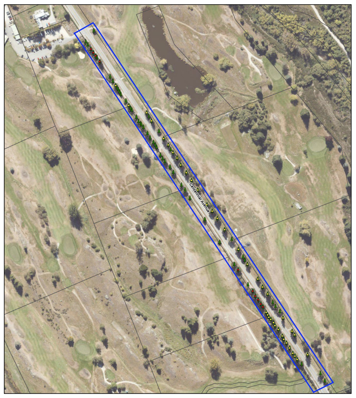
Figure 1: Avenue of trees on Centennial Avenue Yellow dot = Larch Red dot = Douglas Fir

7. The area of proposed tree removals is identified below in Figure 1, while overview photos of the avenue are identified in Figure 2.