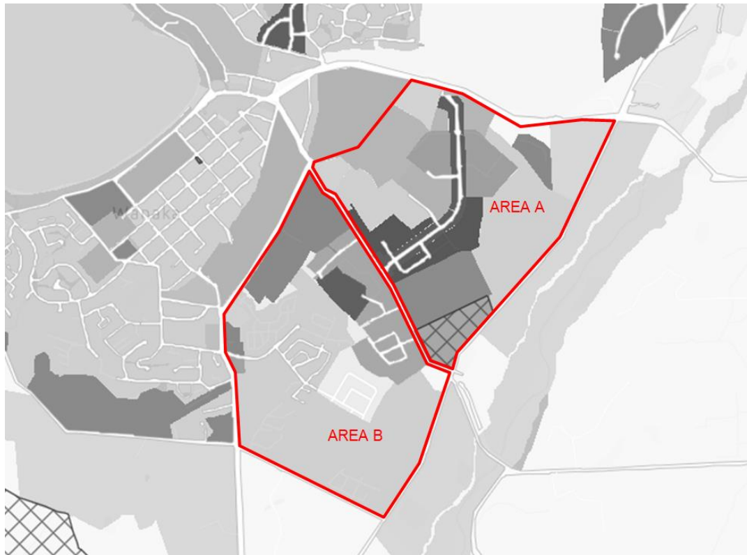
Figure 4 – recommended MDRAZ and HDRAZ zones in Wānaka, no scale.

effects on the community or the environment. The Panel also recognises that presently its accessibility is not the same as around the WTC. But, as expressed for Area A, the Area is adjacent to the Three Parks development and will see significant change over the short-medium term. We consider that this change should be enabled at a greater density to be commensurate in Policy 5 terms (and taking our Wānaka wide approach).