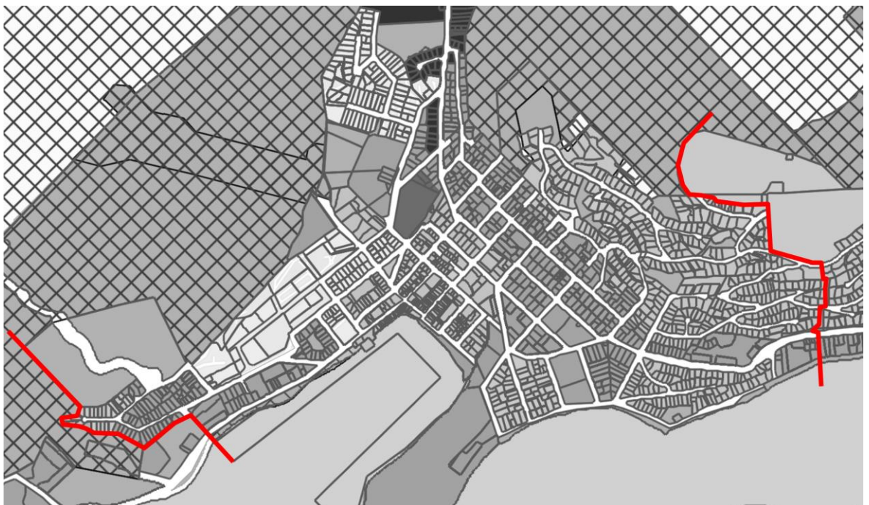
Figure 2 – identification of central Queenstown area within which 3+ storey apartment-style dwellings would be commensurate and appropriate (no scale)