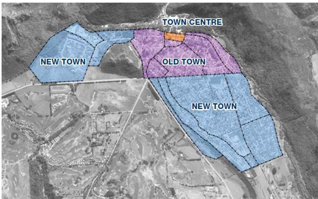
Figure 3 – 'Old' and 'new' town areas from the Arrowtown Design Guidelines 2016 (page 4), no scale

8.32 In conclusion, other than the Town Centre Zone and ARHMZ, we do not accept the argument that Arrowtown as a whole contains historic heritage and/or amenity values constraints of such spatially continuous coherence or significance that no enablement of height of density at all beyond the status quo could be acceptable. Although we would agree the many houses we visited were of a high-quality and offering high amenity it was just not the case that there was a specialness that distinguished them from equally beautiful homes in beautiful settings we visited in parts of Wānaka, Arthurs Point, Hāwea and Queenstown.