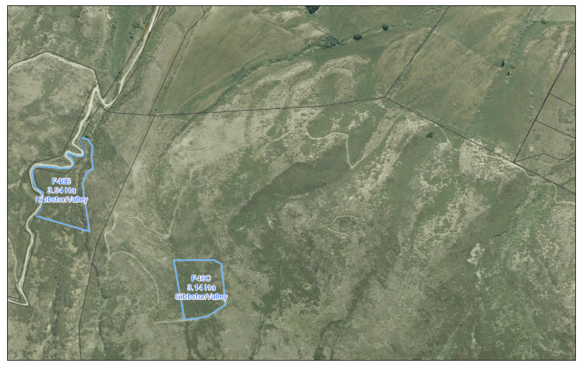
Figure 1: The area of potential significance - Gibbston Valley SNA B - F40B.