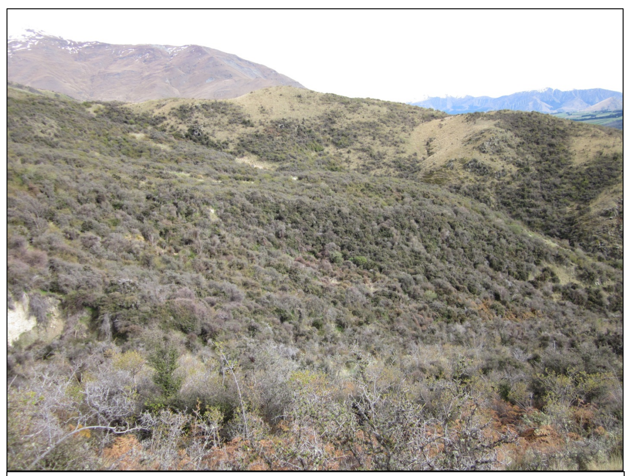
Figure 2: A photographic representation of the potential area of significance, i.e. ' Gibbston Valley SNA B ', on the Gibbston Valley Station property.