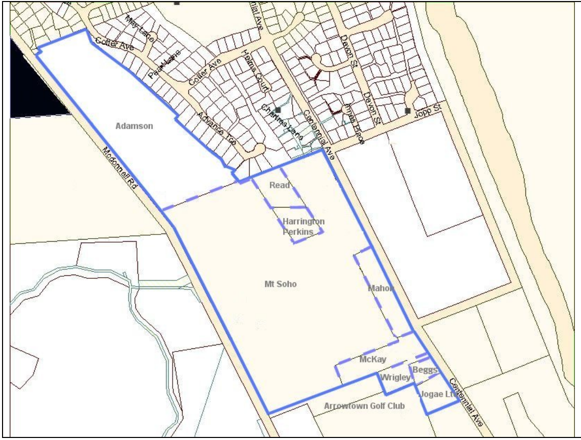
Figure 2.1 Landowners within the Arrowtown South Special Zone

There are nine landowners within the special zone as identified on the following plan.