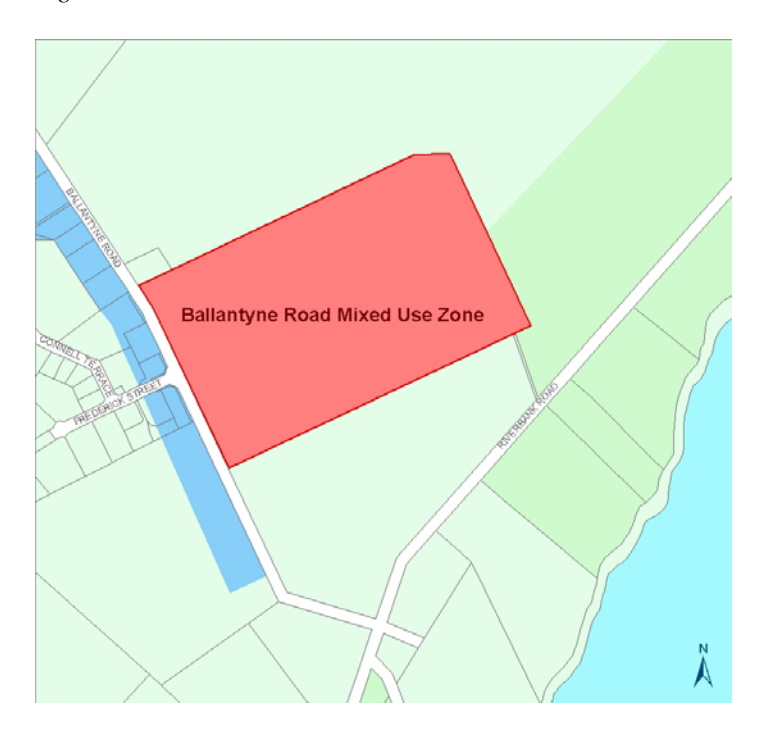
Figure 1: Location Plan

The site is currently zoned Rural General and contains the oxidation ponds for the present Wanaka effluent treatment and disposal system. The existing site is overlain by a Queenstown Lakes District Council Designation. The Designation enables any activity that is associated with the operation and maintenance of the oxidation ponds to be undertaken without the need for resource consent. The presence of the Designation also means that any uses not falling within the purpose of the Designation will be subject to the resource consent process and require the approval of the requiring authority.