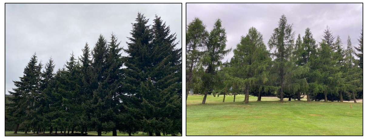
Figure 3: Douglas fir

12. Douglas fir and European larch are classified as noxious wilding conifers. They have shallow roots that can damage turf quality, consume excessive water as mature trees, and can be hazardous in high winds due to their tendency to throw branches. The removal application includes a total of 49 wilding conifers.