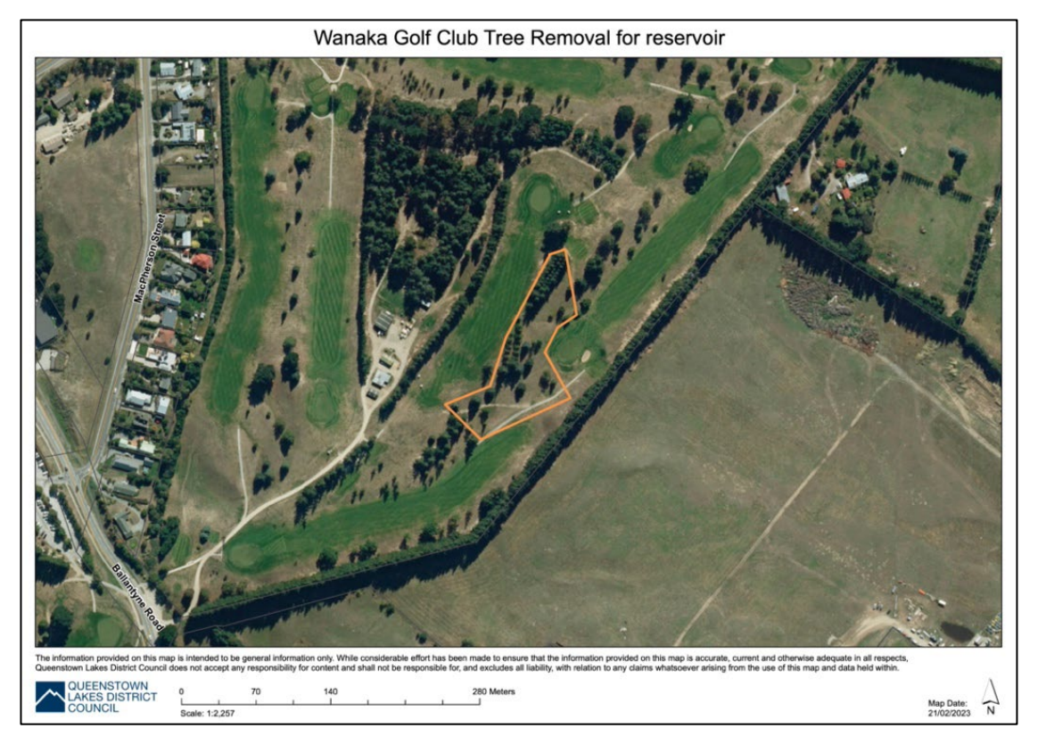
Figure 1: Area of tree removals