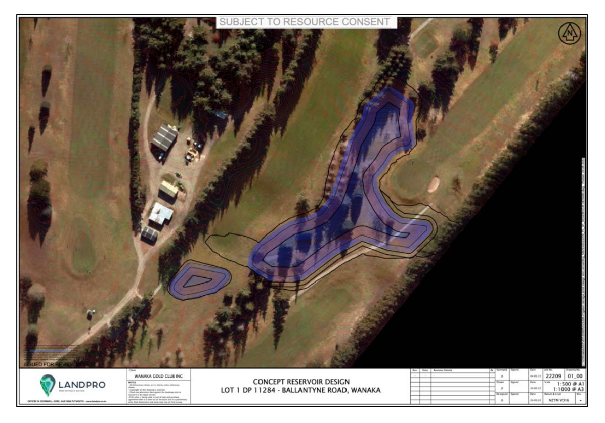
Figure 2: Area of the proposed reservoir