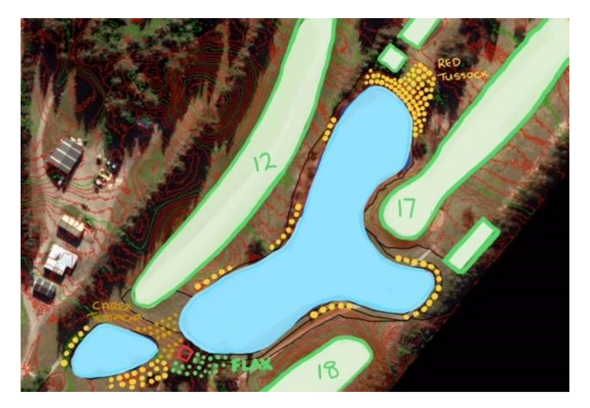
Figure 2: Pond planting