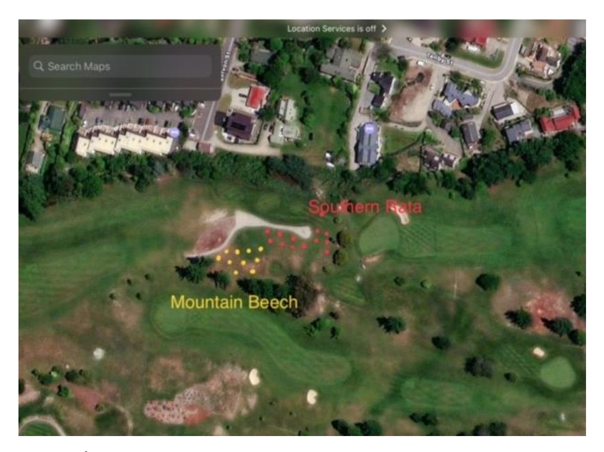
Figure 4: 4<sup>th</sup> Hole Planting