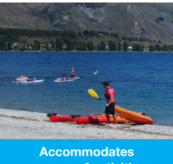
a range of activities