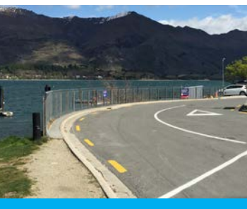
Lack of continuous access for pedestrians