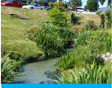
Poor ecology highly modified