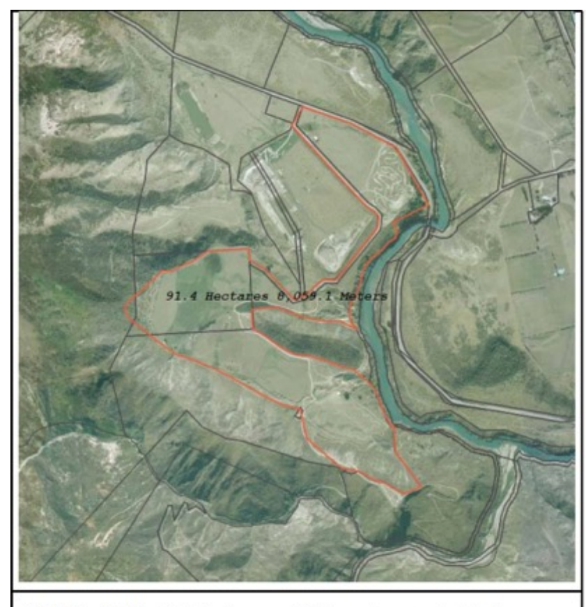
Aerial photo of subject site showing area of CCC re-zoning request outlined in red.

architect. Mr Milne addressed this in this evidence; mainly in his evidence-in-chief under the hearing " The GIZ Proposal "<sup>152</sup>. As set out by Mr Milne the proposal is supported by a Structure Plan setting out the developable areas, green corridors and planted Amenity Setbacks and Mitigation Planting Zones. The developable areas include<sup>153</sup>: