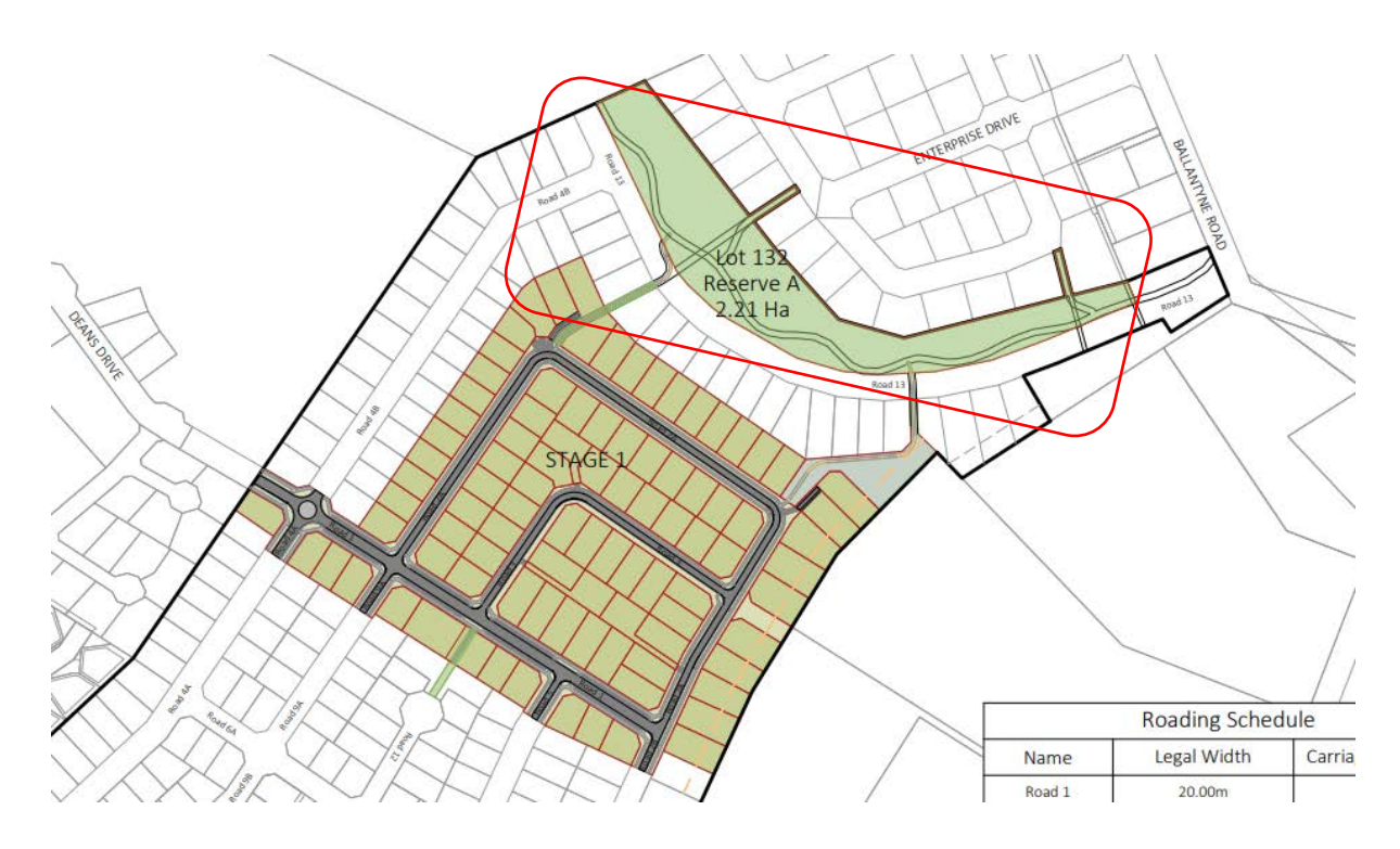
Figure 1: Excerpt of approved subdivision plan RM200259 as varied by RM230716 with proposed reserve circled in red

8. Landscaped mounds have been formed and some tree planting is in place (see Figure 2 below). It is noted from the condition of the surface that it does not appear that the mounding has been finished with topsoil and therefore top-soiling and re-sowing of grass will be required at a minimum.