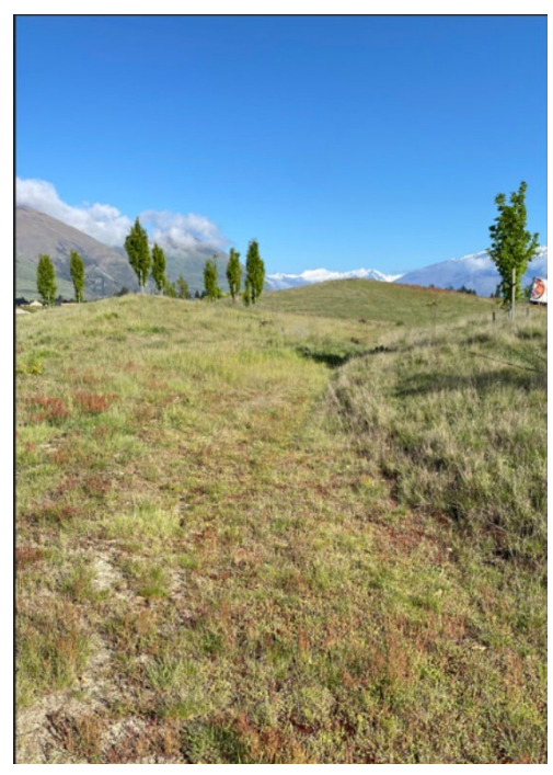
Figure 2: Existing condition of proposed Reserve Lot 132

8. Landscaped mounds have been formed and some tree planting is in place (see Figure 2 below). It is noted from the condition of the surface that it does not appear that the mounding has been finished with topsoil and therefore top-soiling and re-sowing of grass will be required at a minimum.