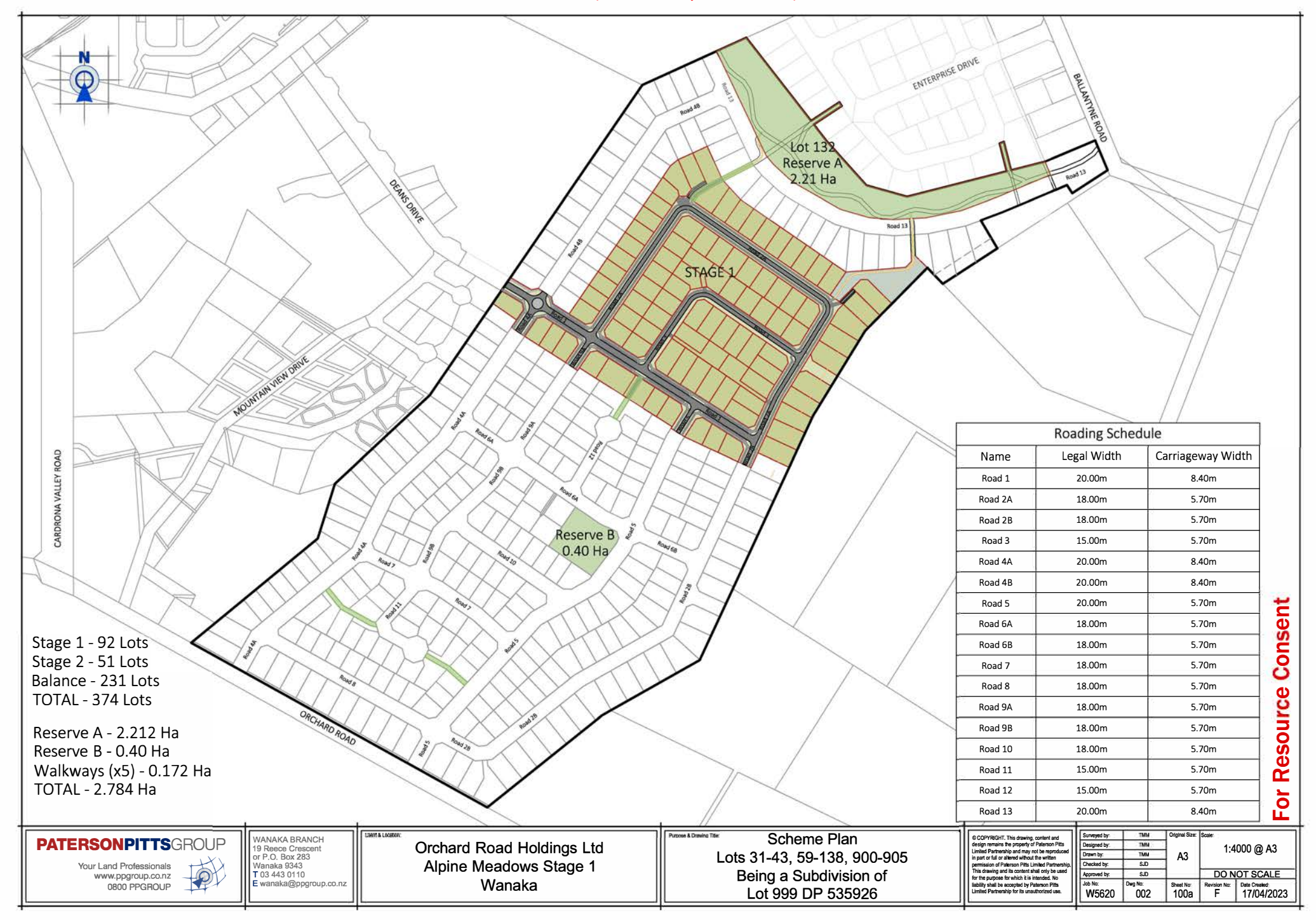
Attachment A: Orchard Road Subdivision Plan RM 200259 (as varied by RM230716)