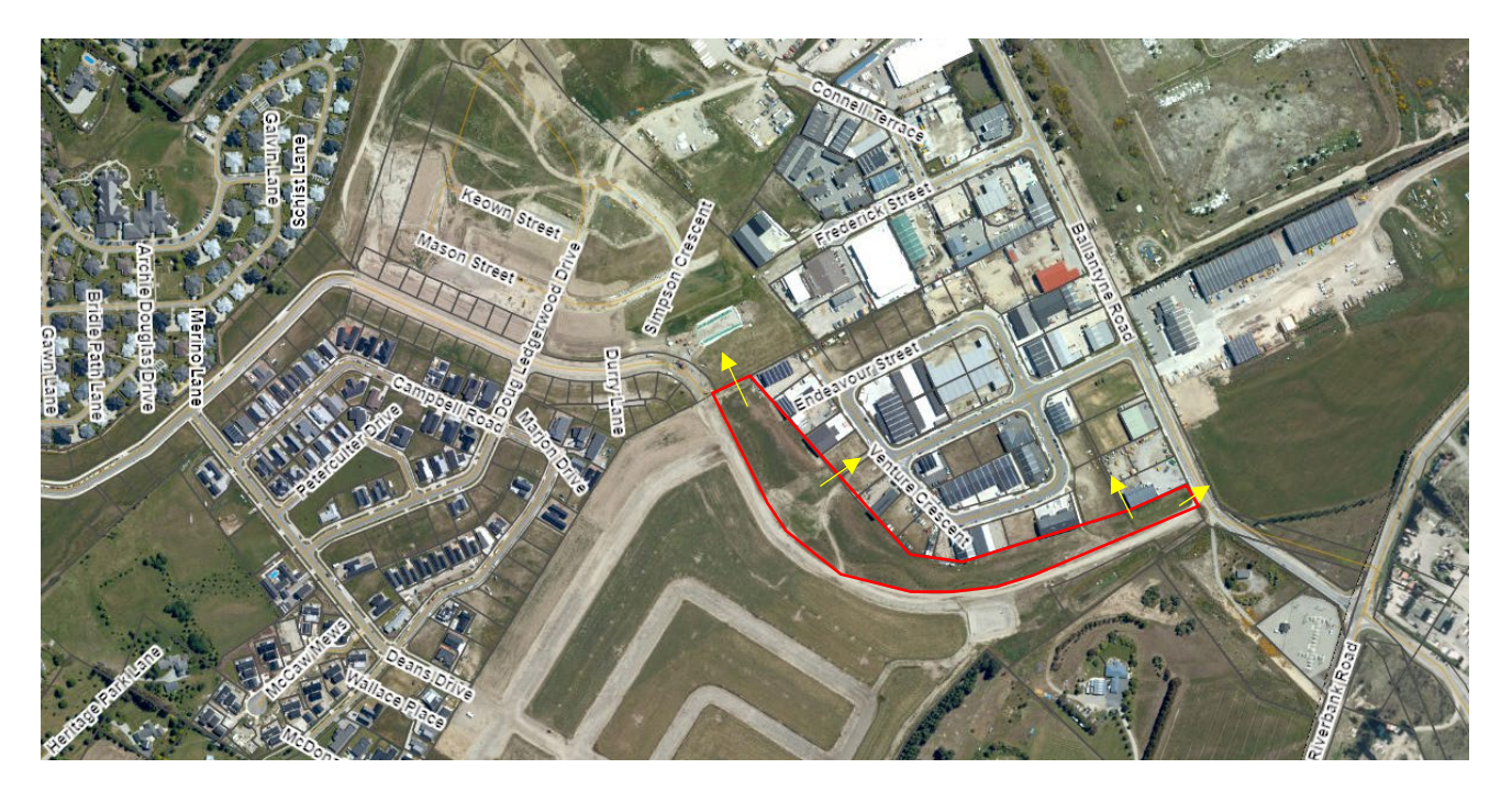
Figure 3: Aerial view of the proposed lot (outlined in red) and showing the pedestrian / cycle connections that will be enabled

9. A pedestrian/cycle trail is also proposed within Lot 132 as shown in Figure 1 above. This will provide an active travel connection between the Pembroke Terrace subdivision to the northwest, two connections to the industrial area to the north, as well as Ballantyne Road to the northeast as indicated below in Figure 3.