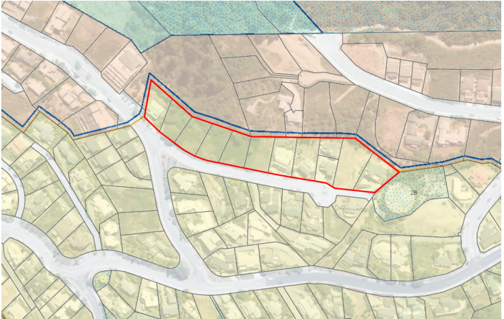
Figure 2: ODP zoning (red outline indicates the subject sites)

9. Under the Operative District Plan (ODP), the subject sites are zoned Low Density Residential (Medium Density Sub-zone). See Figure 2 below.