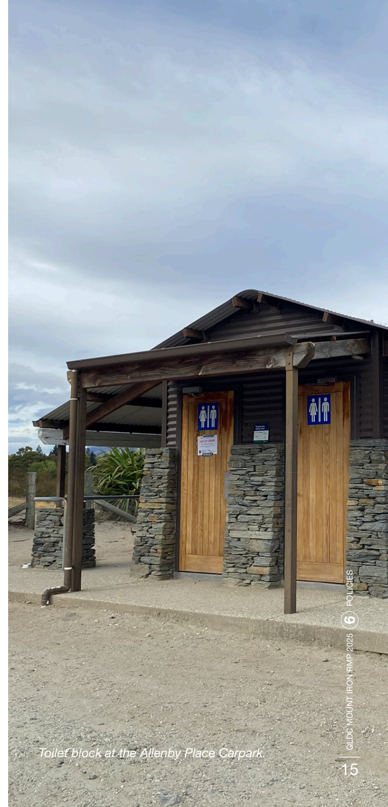
Toilet block at the Allenby Place Carpark.

Note: QLDC Plaques and Memorials Policy applies to all QLDC land including Mount Iron Reserve. Due to the significance and visibility of Mount Iron to many people the application process will be subject to elevated requirements. (These elevated requirements are under review through the QLDC Plaques and Memorials Policy review).