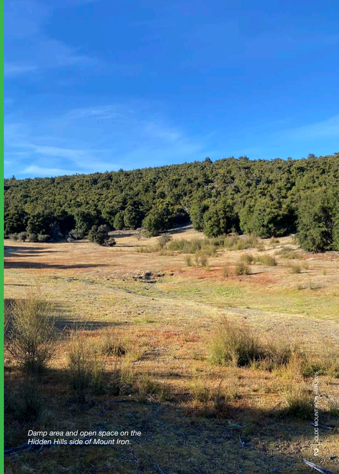
Damp area and open space on the Hidden Hills side of Mount Iron.