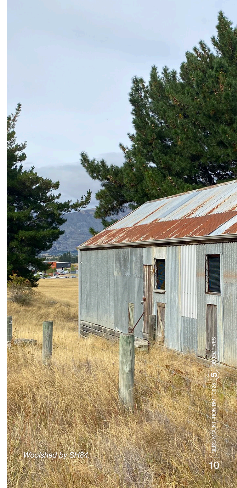
Woolshed by SH84.