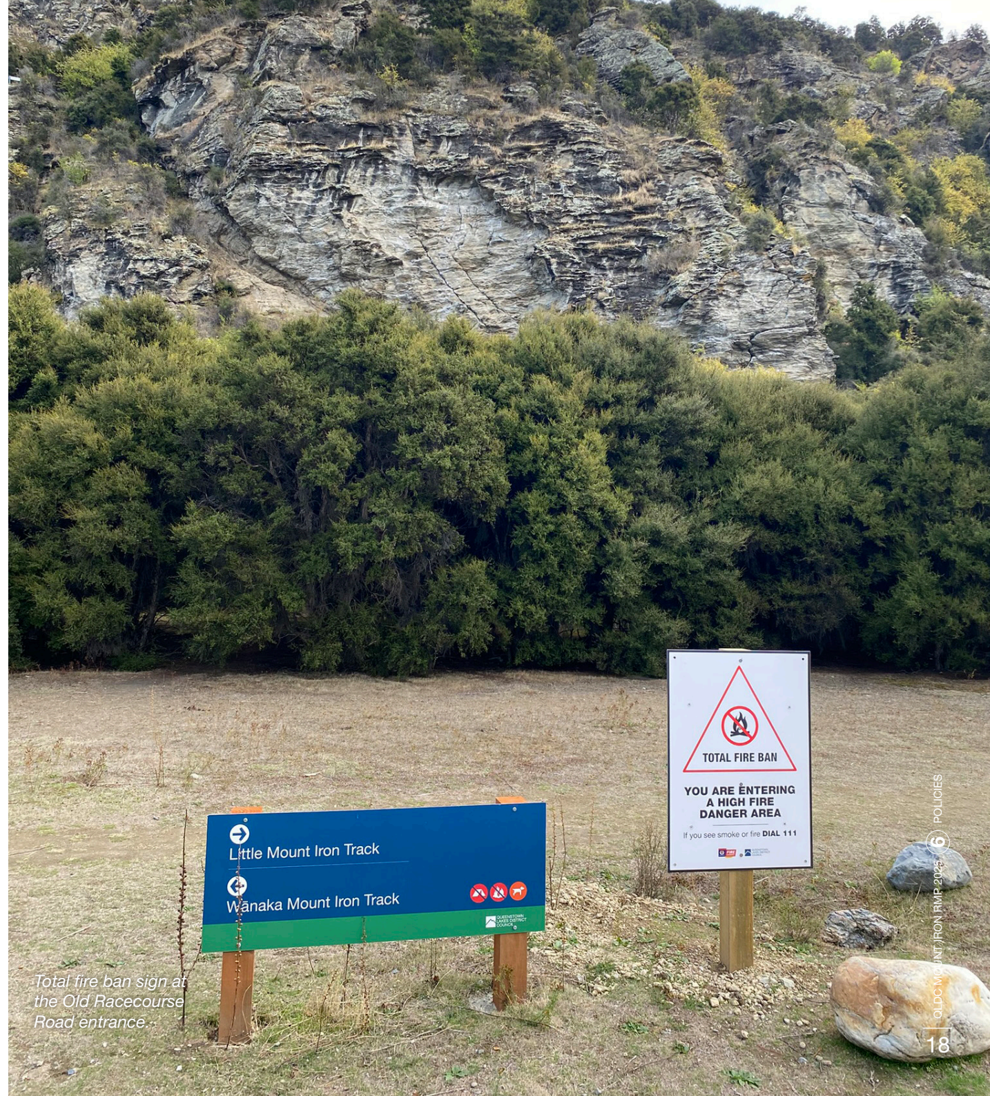
Total fire ban sign at the Old Racecourse Road entrance.