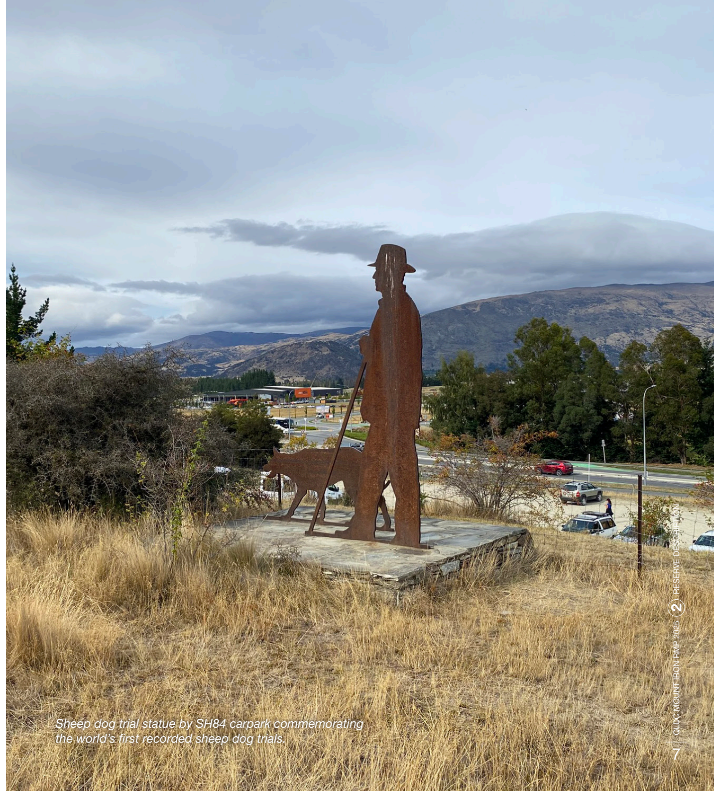
Sheep dog trial statue by SH84 carpark commemorating the world's first recorded sheep dog trials.

There are several easements at the base of Mount Iron in favour of QLDC and other service providers to manage underground infrastructure.