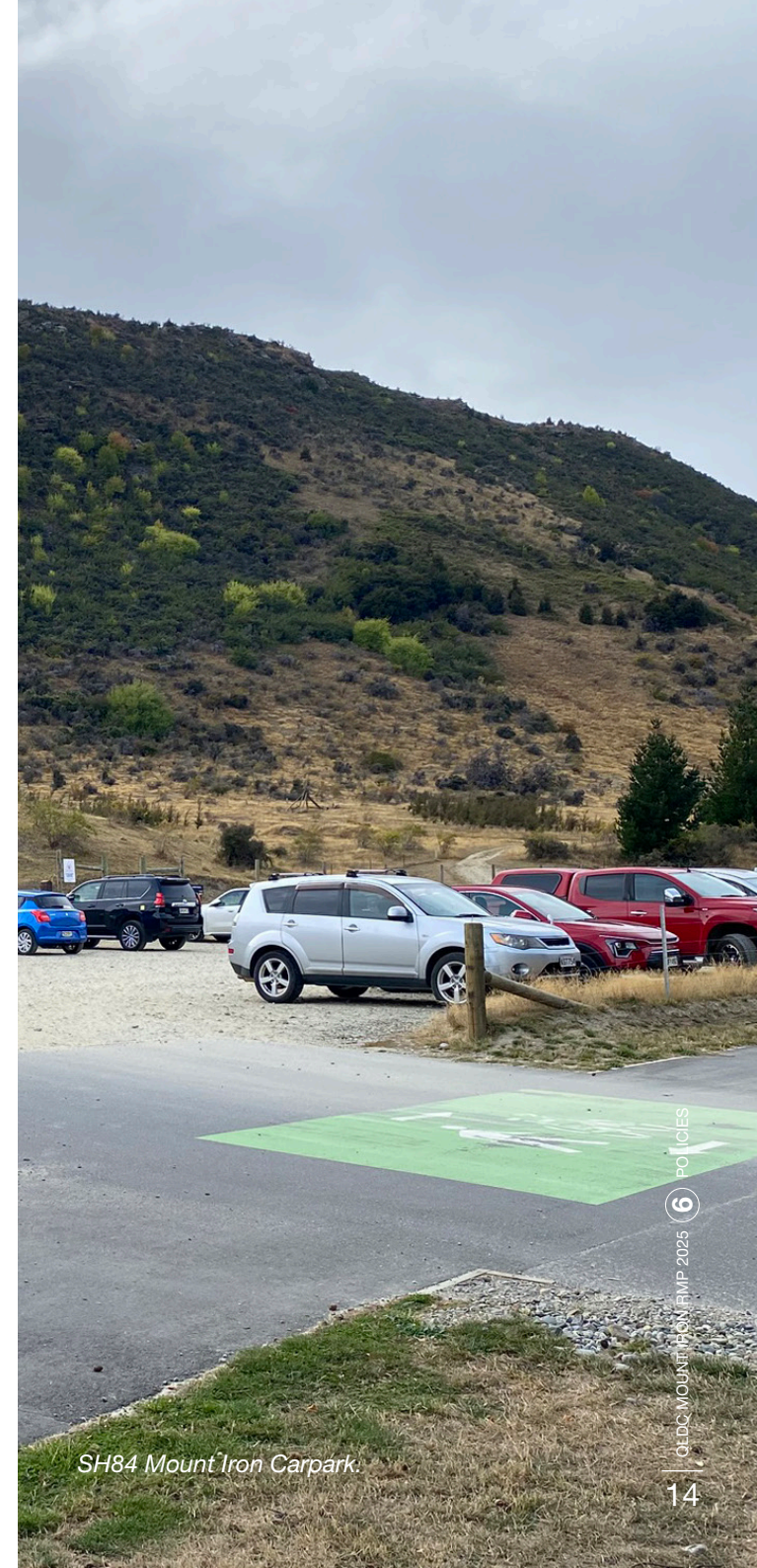
SH84 Mount Iron Carpark