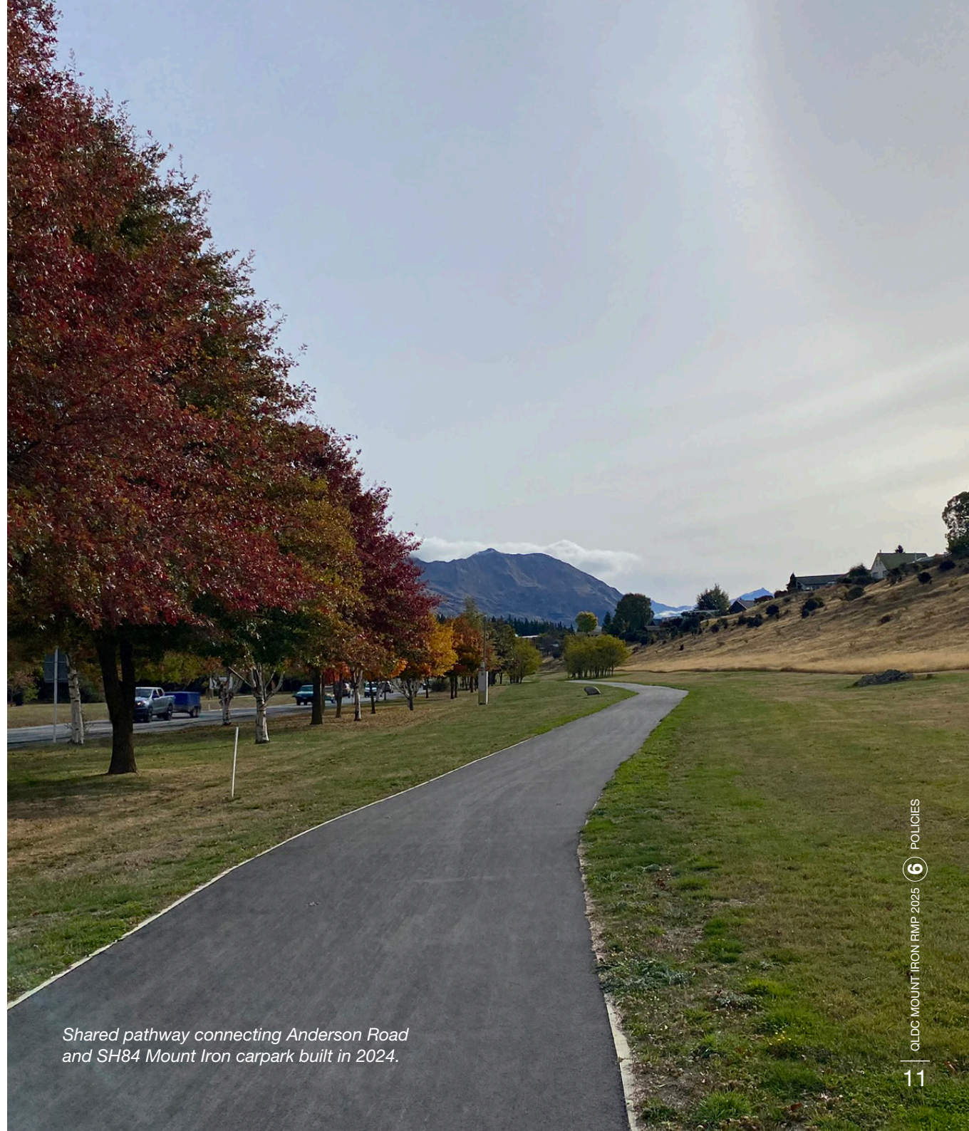
Shared pathway connecting Anderson Road and SH84 Mount Iron carpark built in 2024.