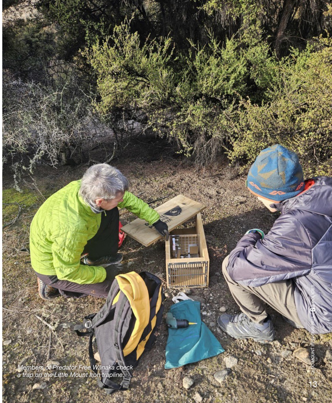
Members of Predator Free Wānaka check a trap on the Little Mount Iron trapline.