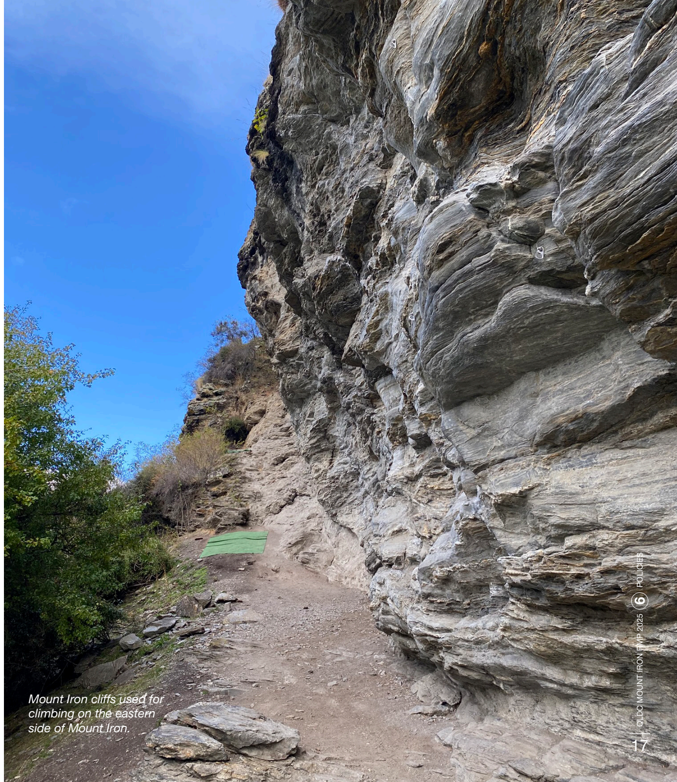
Mount Iron cliffs used for climbing on the eastern side of Mount Iron.