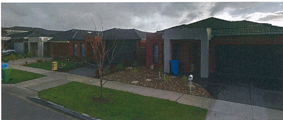
12 x 26m sites (312m 2 sites) - Cranbourne, Melbourne, Victoria