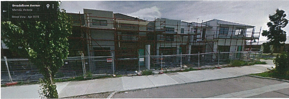
Breadlebane Avenue – Mendra, Victoria - 5.6 x 27m deep, 155m 2 sections (served from a rear lane)

Our Liberty Series has a choice of stunning facades. Please speak to one of our New Homes Consultants for pricing details.