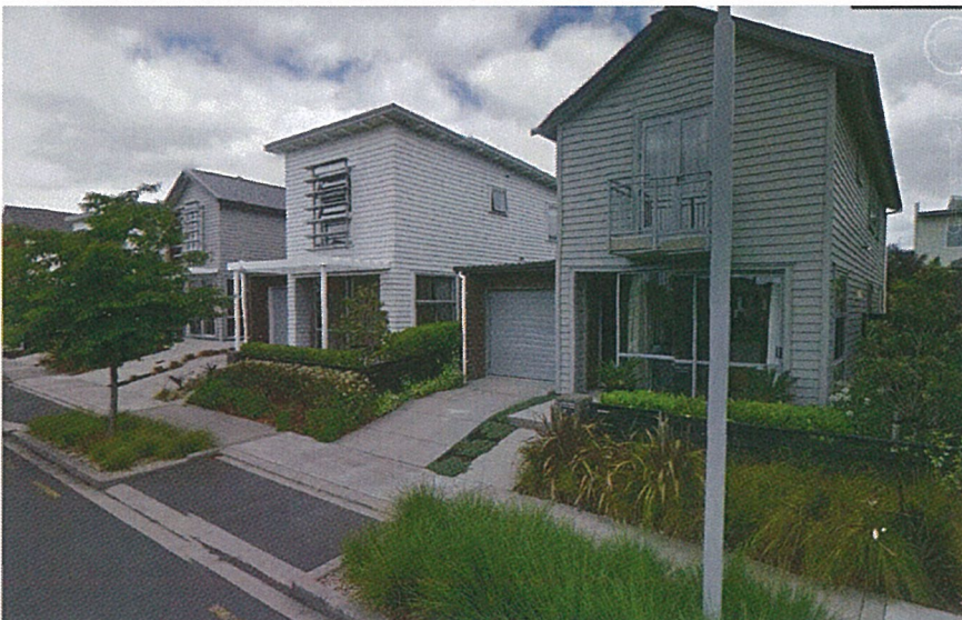
28x10m sites (280m 2 ) – Hobsonville, Auckland