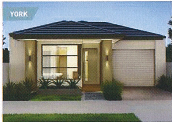
Also from Mendra, Victoria - 8.5 x 22m (187m 2 ) sections –examples from a building company brochure of houses that fit on these