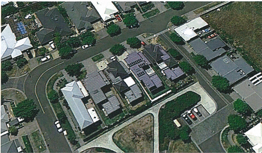
Waterview boulevard, Craigieburn, Melbourne – 10 x 28m – 280m 2 sites