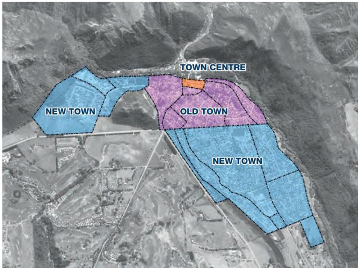
Figure 2: Location of Arrowtown's Old Town, New Town and Town Centre shown in the ADG, page 4.