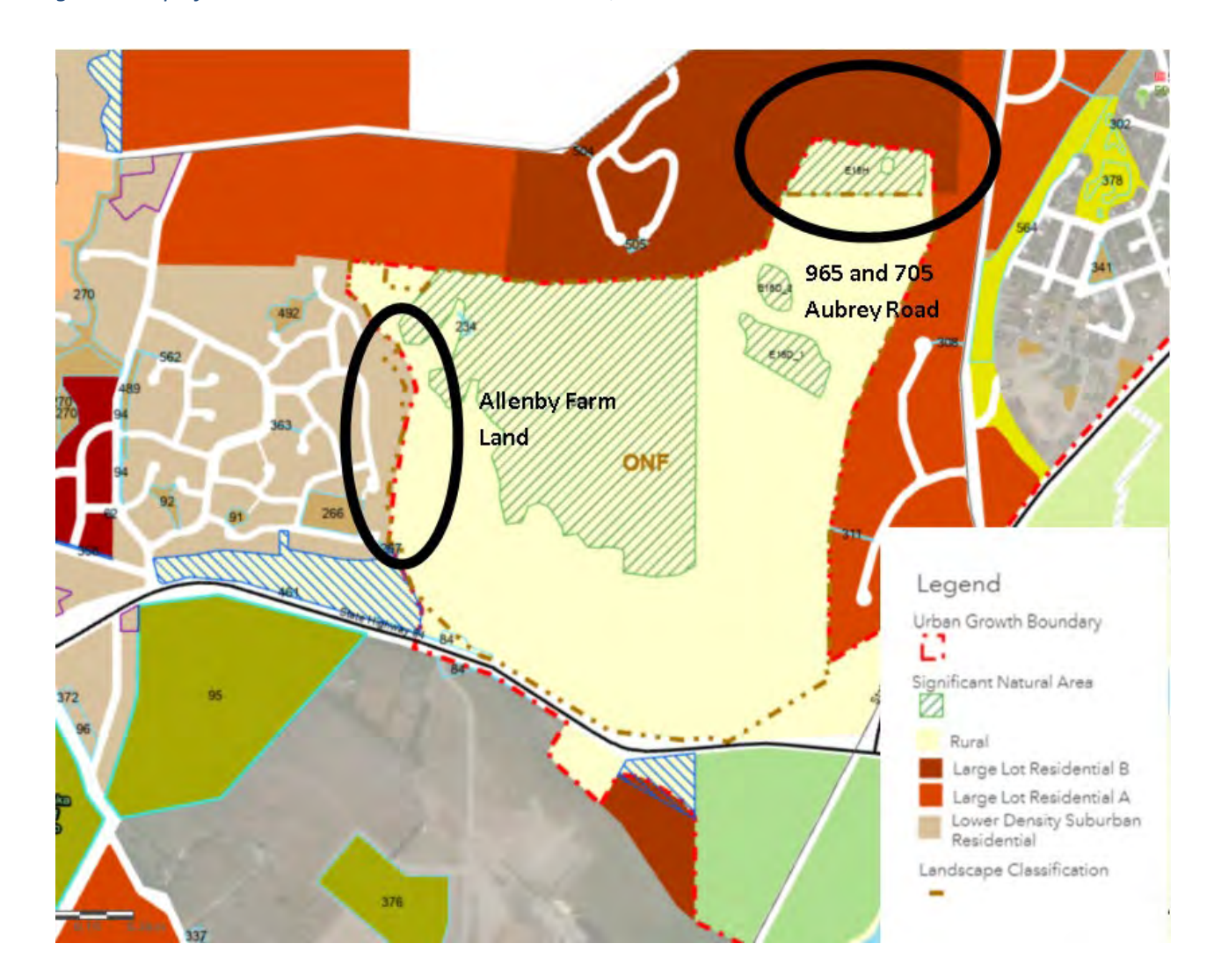
Figure 1 Map of Mt Iron and amended ONF boundaries, QLDC PDP GIS