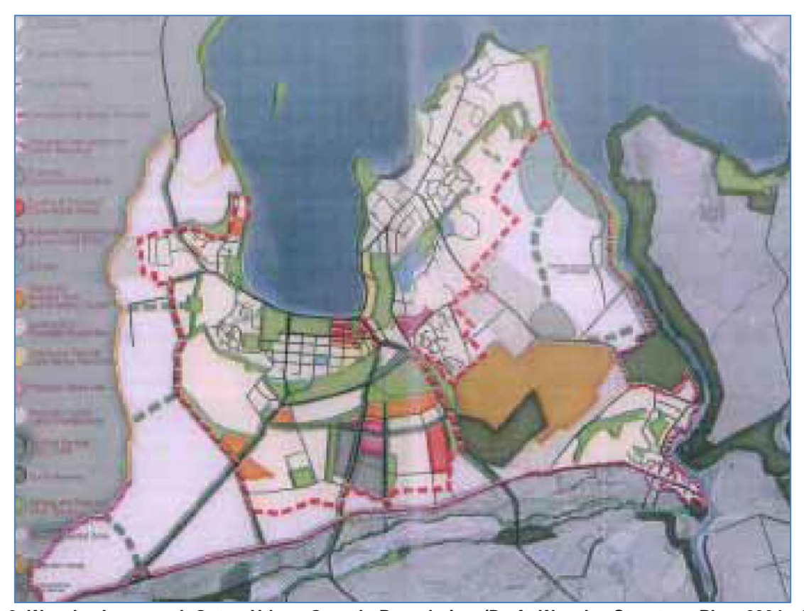
Figure 2 Wanaka Inner and Outer Urban Growth Boundaries (Draft Wanaka Structure Plan 2004; Growth Management Strategy for the Queenstown Lakes District 2007)

For Wanaka, the Draft Wanaka Structure Plan identified both an inner and an outer growth boundary (Refer Figure 2). These boundaries were subsequently reviewed and refined within the Wanaka Structure Plan Review 2007 (Refer Figure 3).