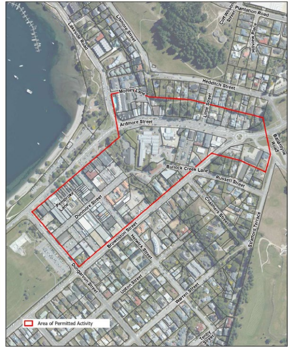
Schedule 2 - Area of permitted activity - Wānaka

Scale: 1:4,000 Map Date: 19/03/2024 The information provided on this map is intended to be general information only. While considerable effort has been made to ensure that the information provided on this map is accurate, current and otherwise adequate in all respects, Queenstown Lakes District Council does not accept any responsibility for content and shall not be responsible for, and excludes all liability, with relation to any claims whatsoever arising from the use of this map and data held within.