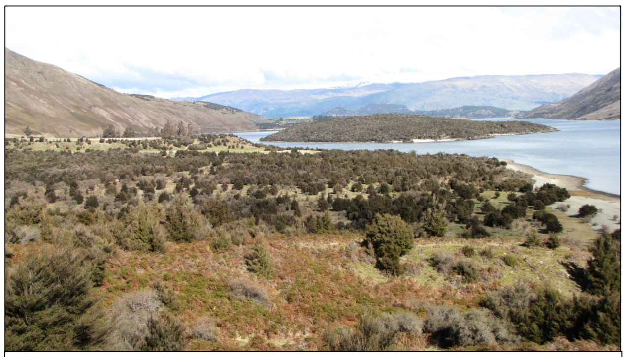
Figure 4: A representative photograph of the proposed 'Mt Burke SNA A'.