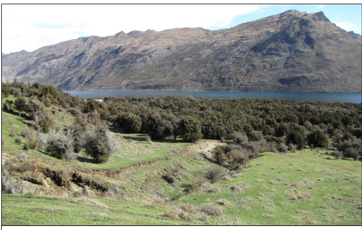
Figure 3: A representative photograph of the proposed 'Mt Burke SNA A'.