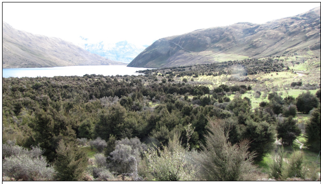
Figure 2: A representative photograph of the proposed 'Mt Burke SNA A'.