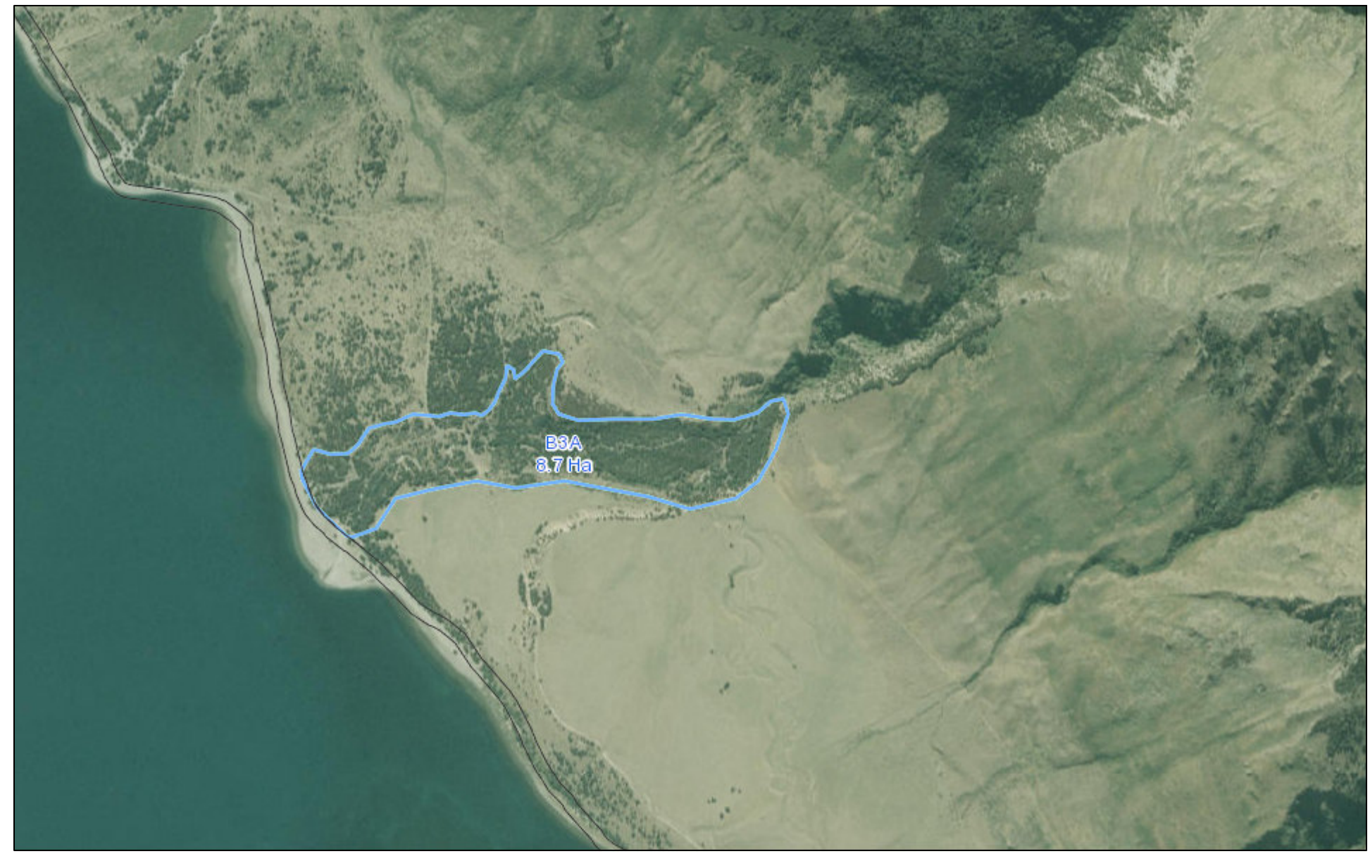
Figure 1: The area of potential significance - Mt Burke SNA A - B3A.