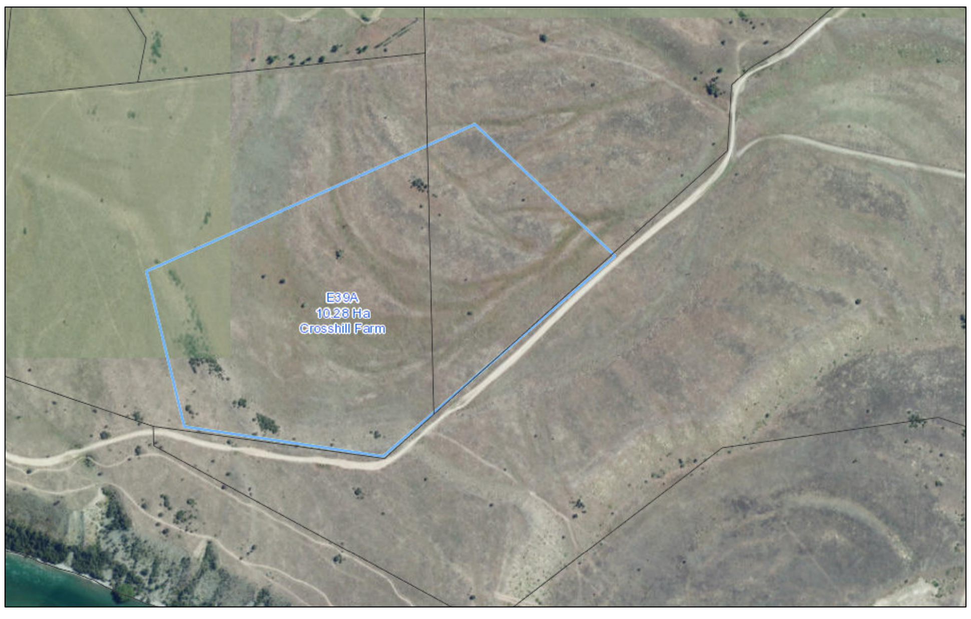
Figure 1: The area of potential significance - Crosshill SNA A - E39A