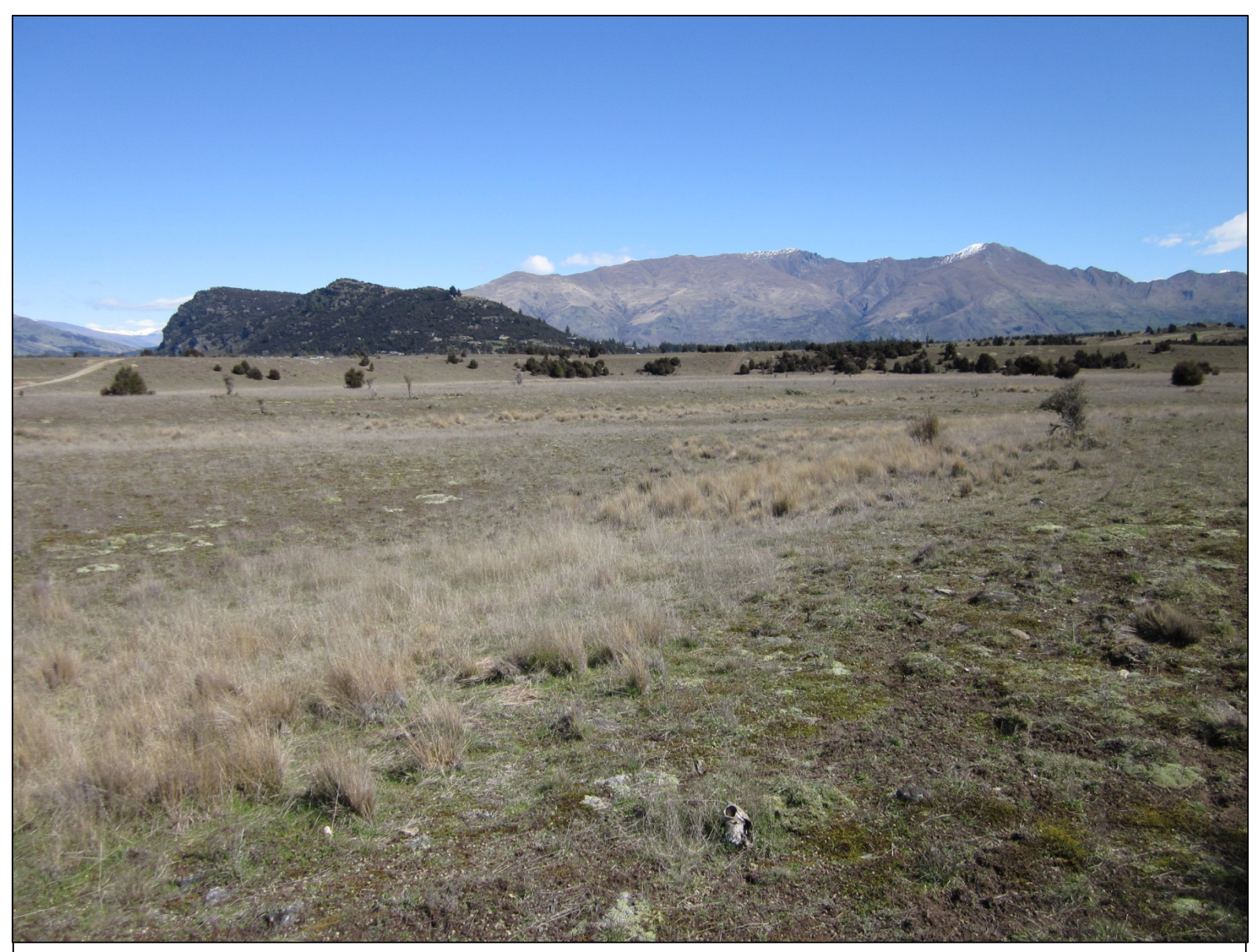
Figure 2: The potential area of significance on the Crosshill Farm property.