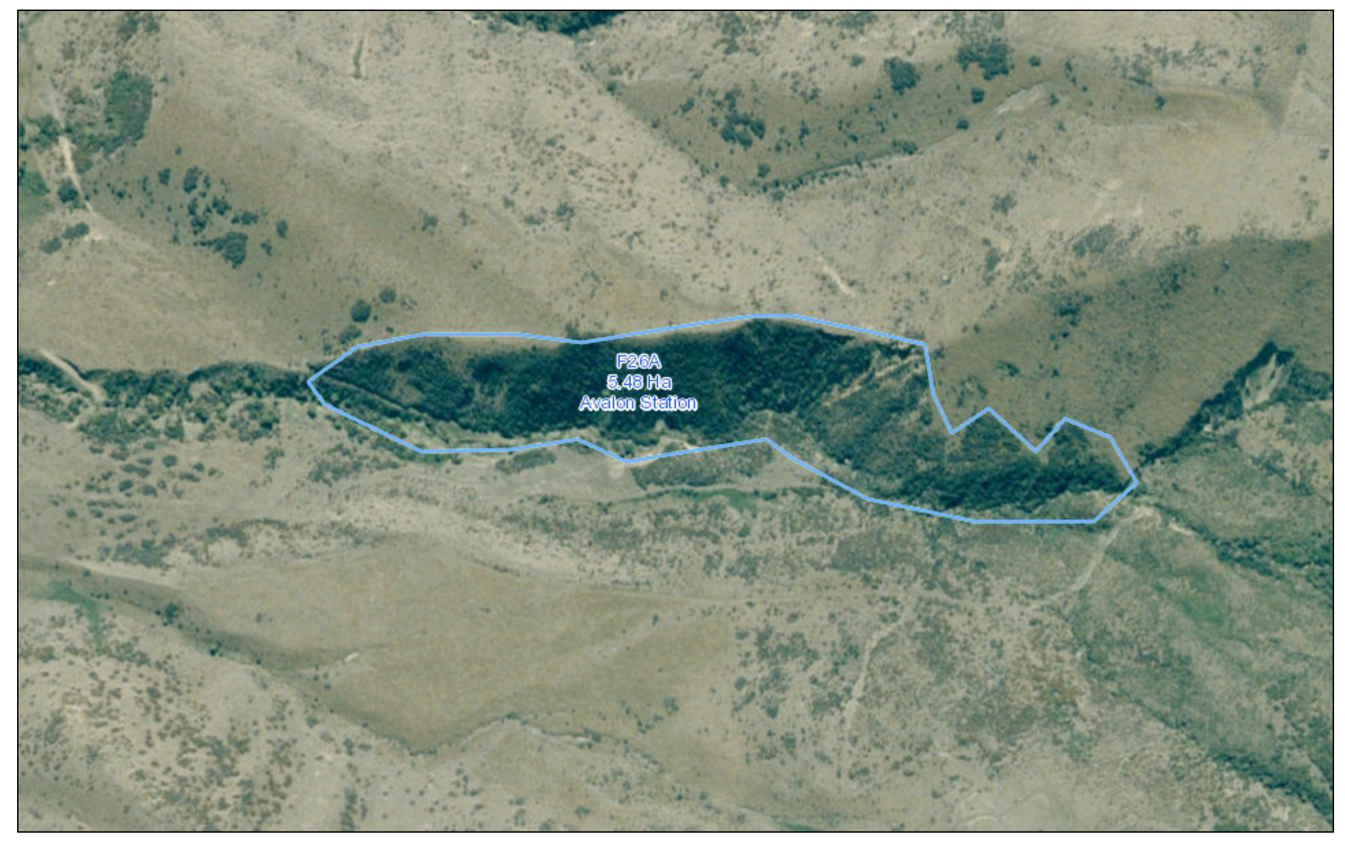
Figure 1: The area of potential significance - Avalon Station SNAA - F26A.