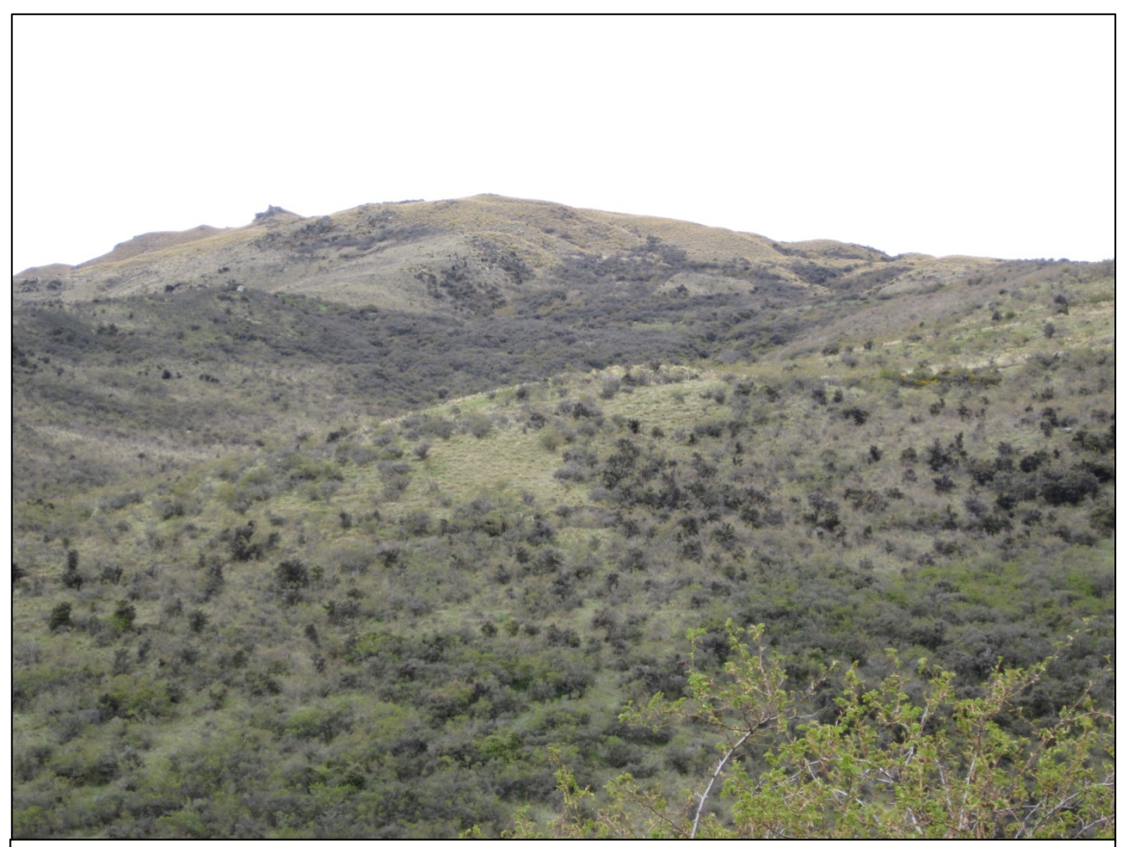
Figure 2: A photographic representation of the potential area of significance, i.e. ' Gibbston Valley SNA C ', on the Gibbston Valley Station property.