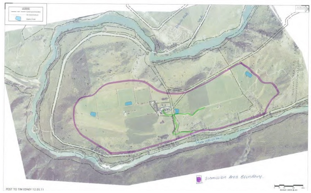
Figure 12-1 - The southern promontory of the submitter's land. Purple outlines the area that the submitter has refined the submission to, which is essentially the land that is zoned Gibbston Character zone<sup>1</sup>.

3. The site, as refined by additional information provided, can be described as the plateau of a peninsula on a meander of the Kawarau River downstream of the bulk of the Gisborne Character Zone. It is at an elevation of approximately 340m, and approximately 100m above the Kawarau River. The area of the site requested for rezoning is approximately 1.25km² or 125 ha. It is shown on Figure 12-1 below.