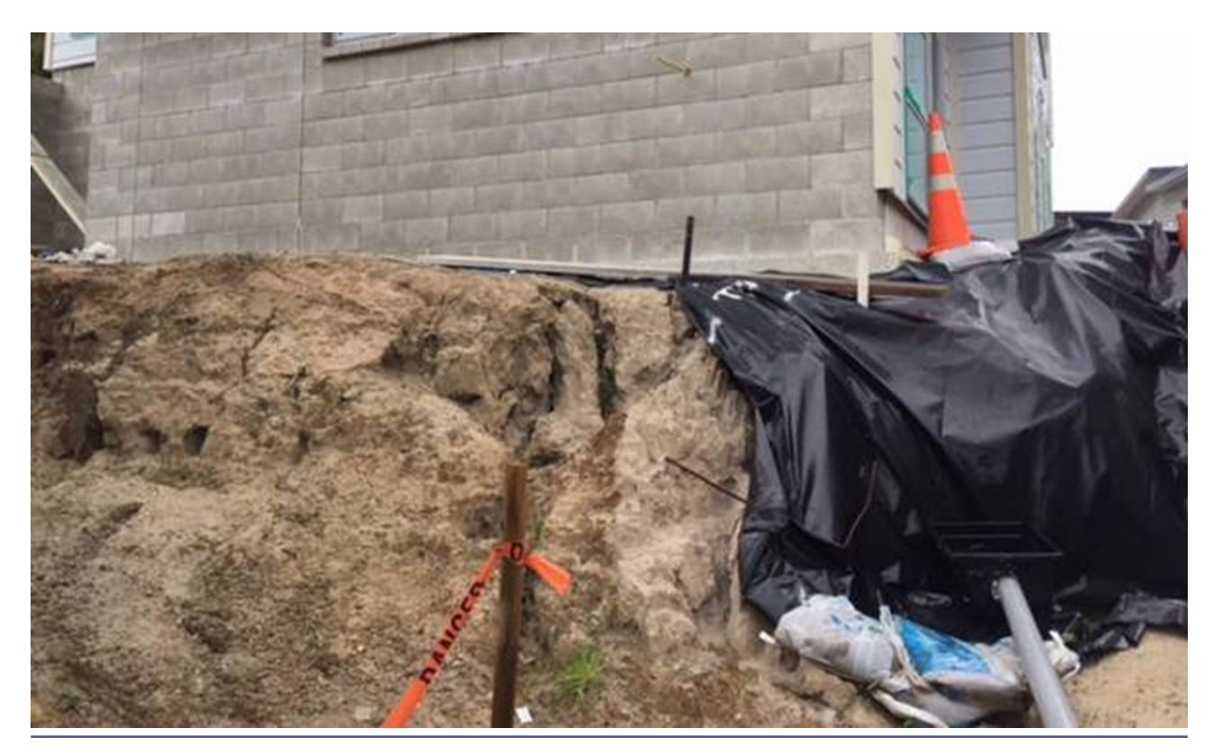
Figure 4: Unretained section of soil which provides support to a dwellings external masonry wall