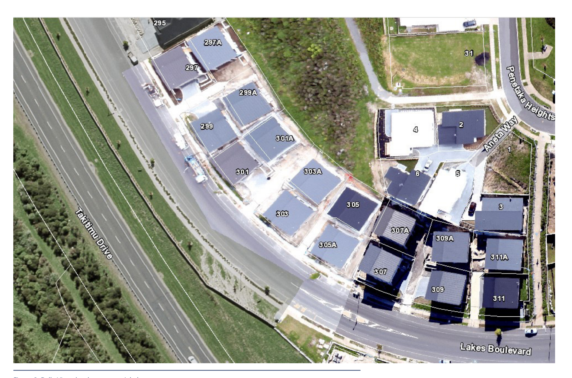
Figure 2: Bella Vista development aerial photo