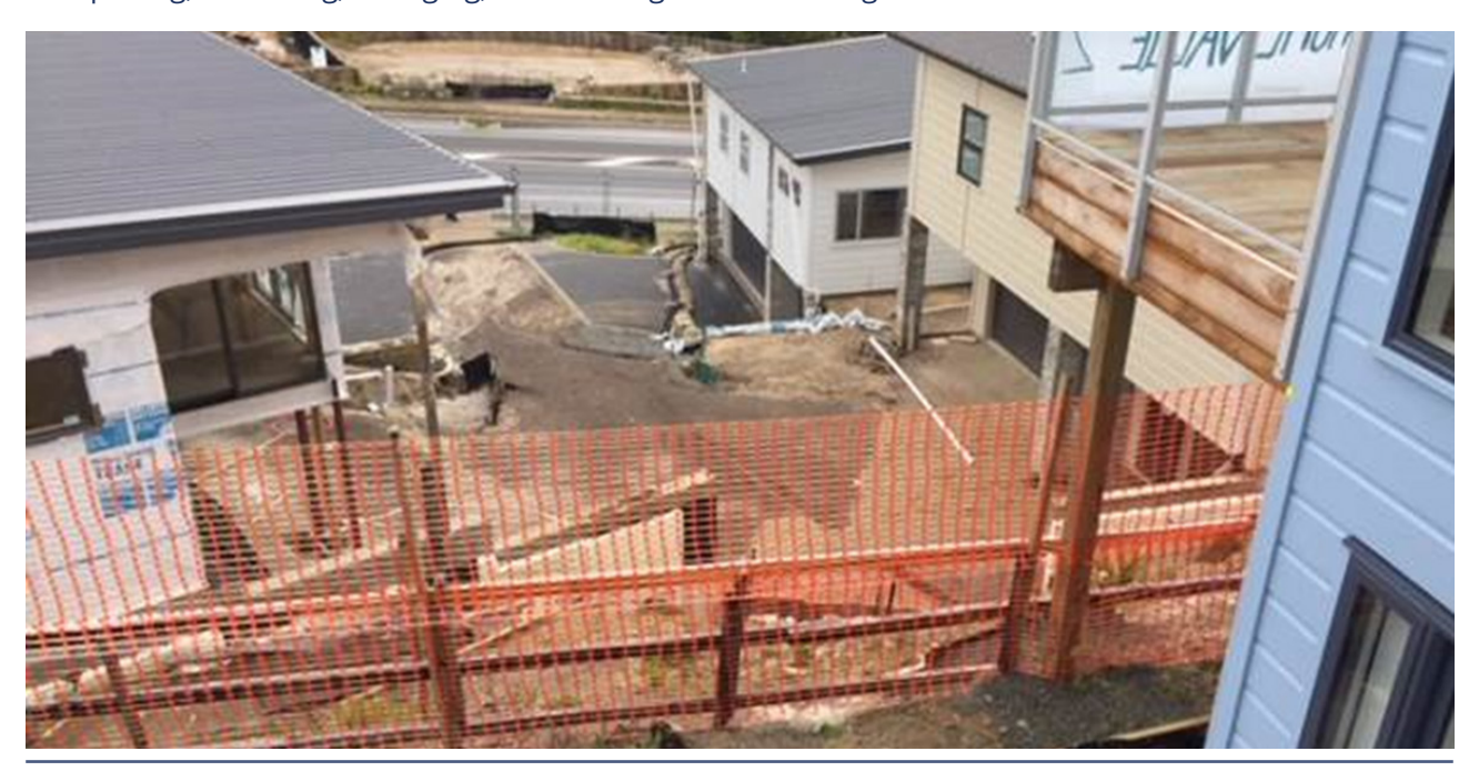
Figure 3: View from 5 Aneta Way over houses at 307, 307A, 309, 309A Lakes Boulevard

In November 2018, the Council agreed a settlement to purchase all land and buildings in the Bella Vista development from the homeowners, and at the time of writing this report, the Council is in the process of repairing, relocating, salvaging, demolishing or remediating the houses.