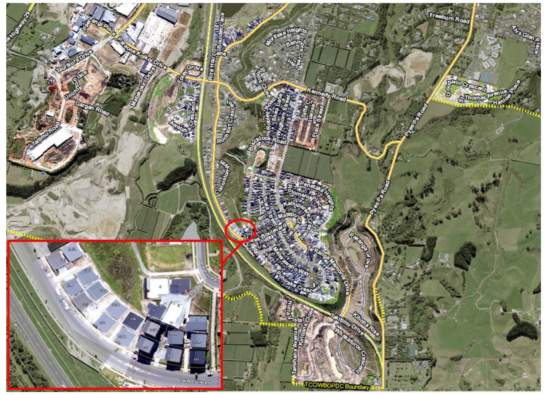
Figure 1: Locality of the Bella Vista development