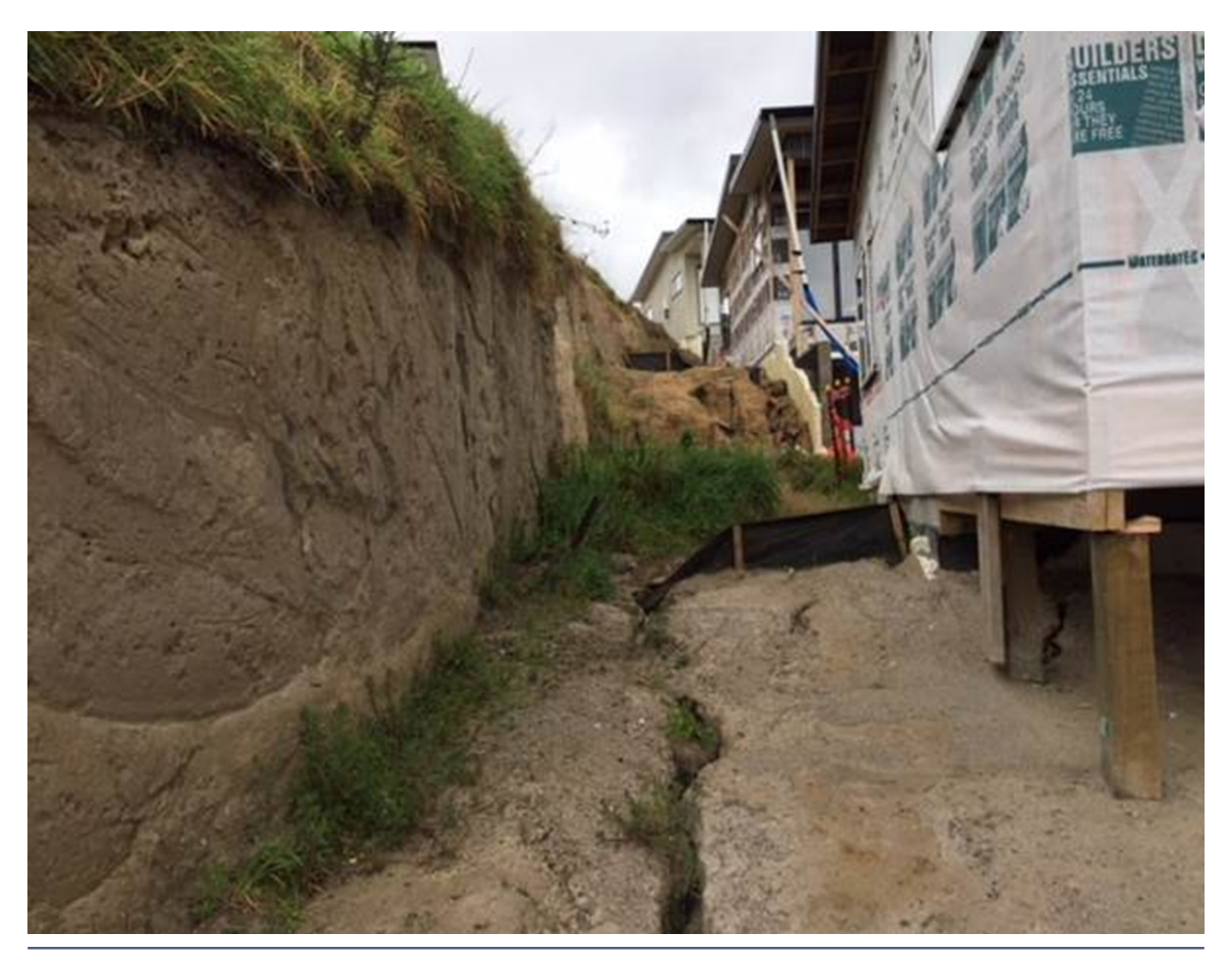
Figure 6: Example of an unretained cut along a property boundary of the Bella Vista Development.

experienced practitioners. In MBIE's assessment that shifts responsibility for the proper sequence of construction to the builder, although the Council's obligation to be alert to compliance issues, including the stability and safety of the buildings and sitework in terms of clauses B1- Structure and F5- Demolition and Construction Hazards of the Building Code also arose at the moment building work began on the site.