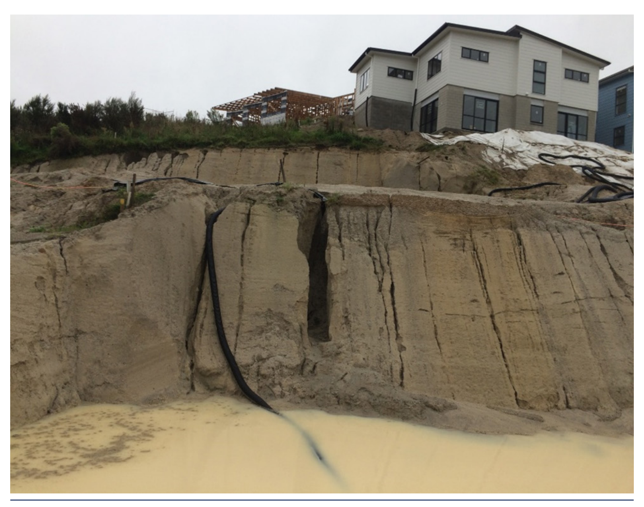
Figure 8: Large unretained cut slope below the Aneta Way properties.