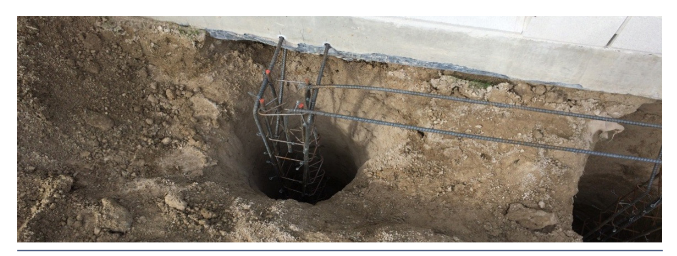
Figure 9: Foundation underpinning at an Aneta Way property. This was treated as a minor variation, but should have been processed as a formal amendment to the building consent.

From interviews with Council staff it appears that there were a number of reasons for the failures to follow proper practice when processing departures from building consents at the Bella Vista development. Comments included acknowledgements that the paperwork was sometimes lacking; that it was not a strong suit for some staff. Also, that matters were dealt with on-site as minor variations because the reality was that building work was not going to stop and needed to be dealt with pragmatically, especially as staff had been told to "make it happen".