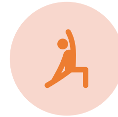
SPORT AND RECREATION (ALLAN)