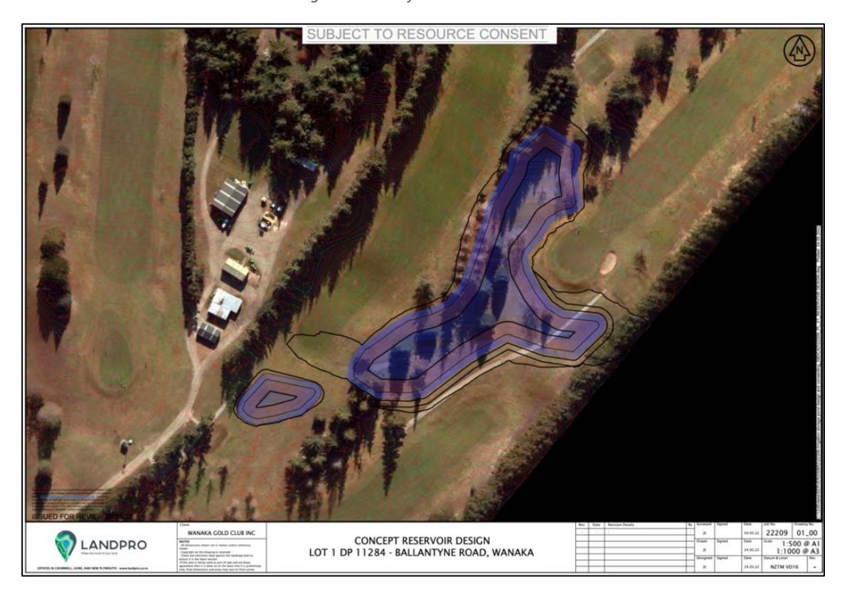
Figure 2: Area of the proposed reservoir