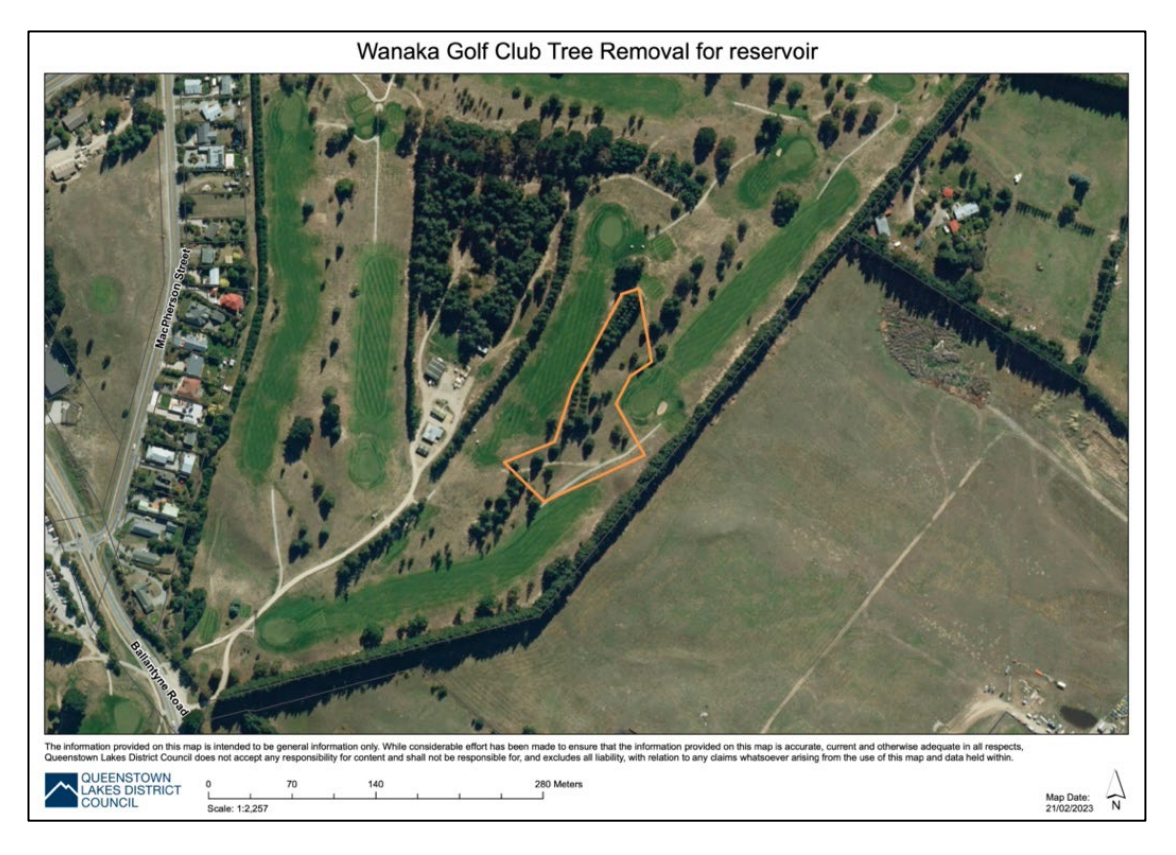
Figure 1: Area of tree removals