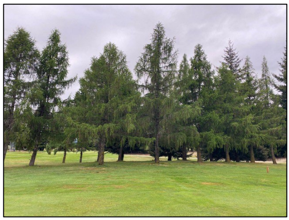
Figure 3: Douglas fir