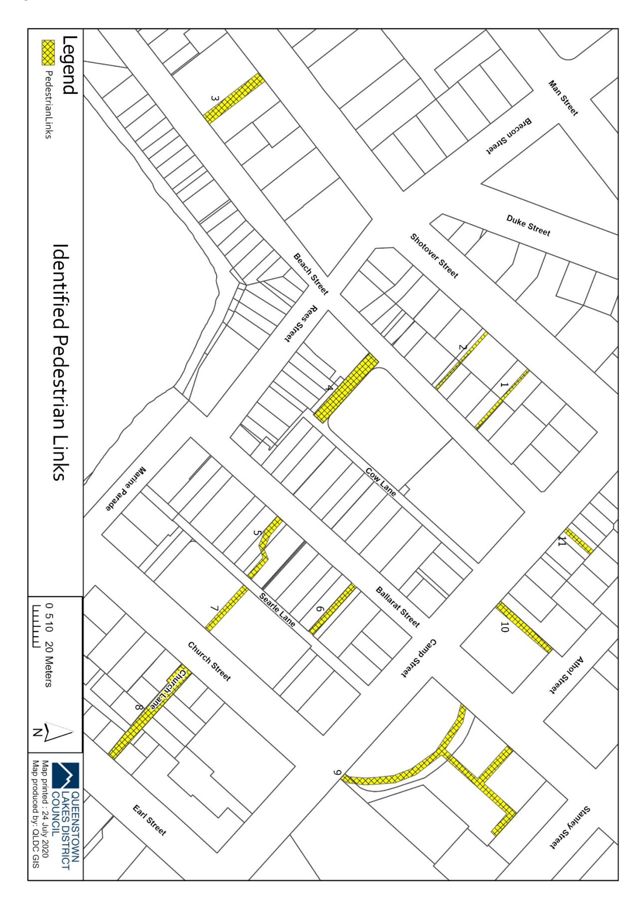
Figure 1: Identified Pedestrian Links