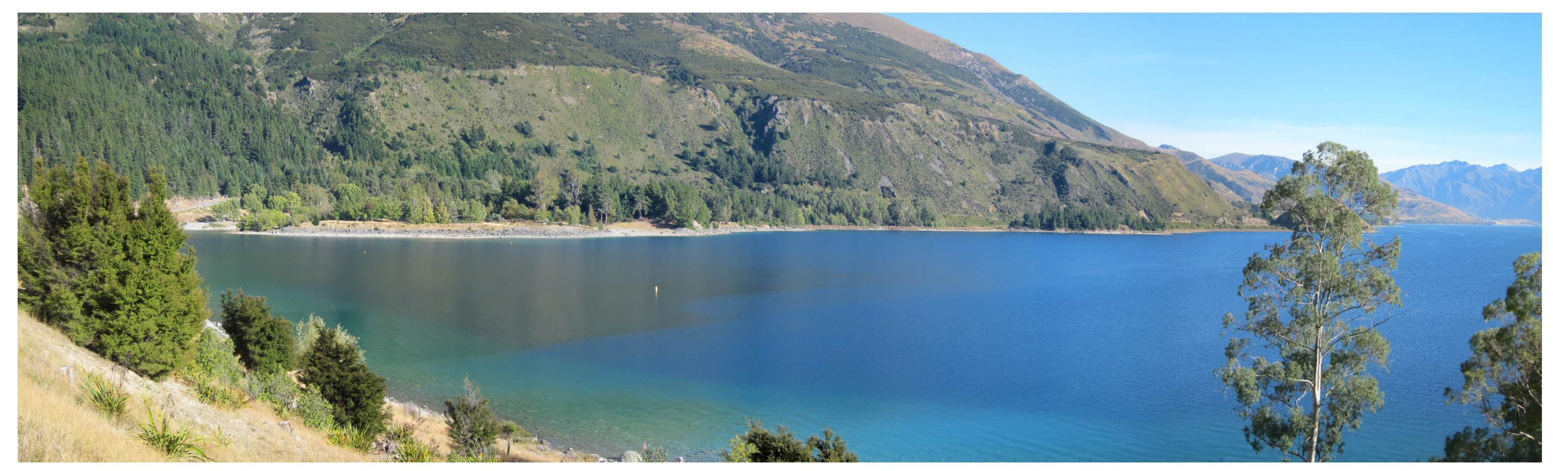
PANORAMA PHOTOGRAPH 1 - Looking towards the proposed Rural Visitor Zone from the reserve land adjacent to Flora Dora Parade.