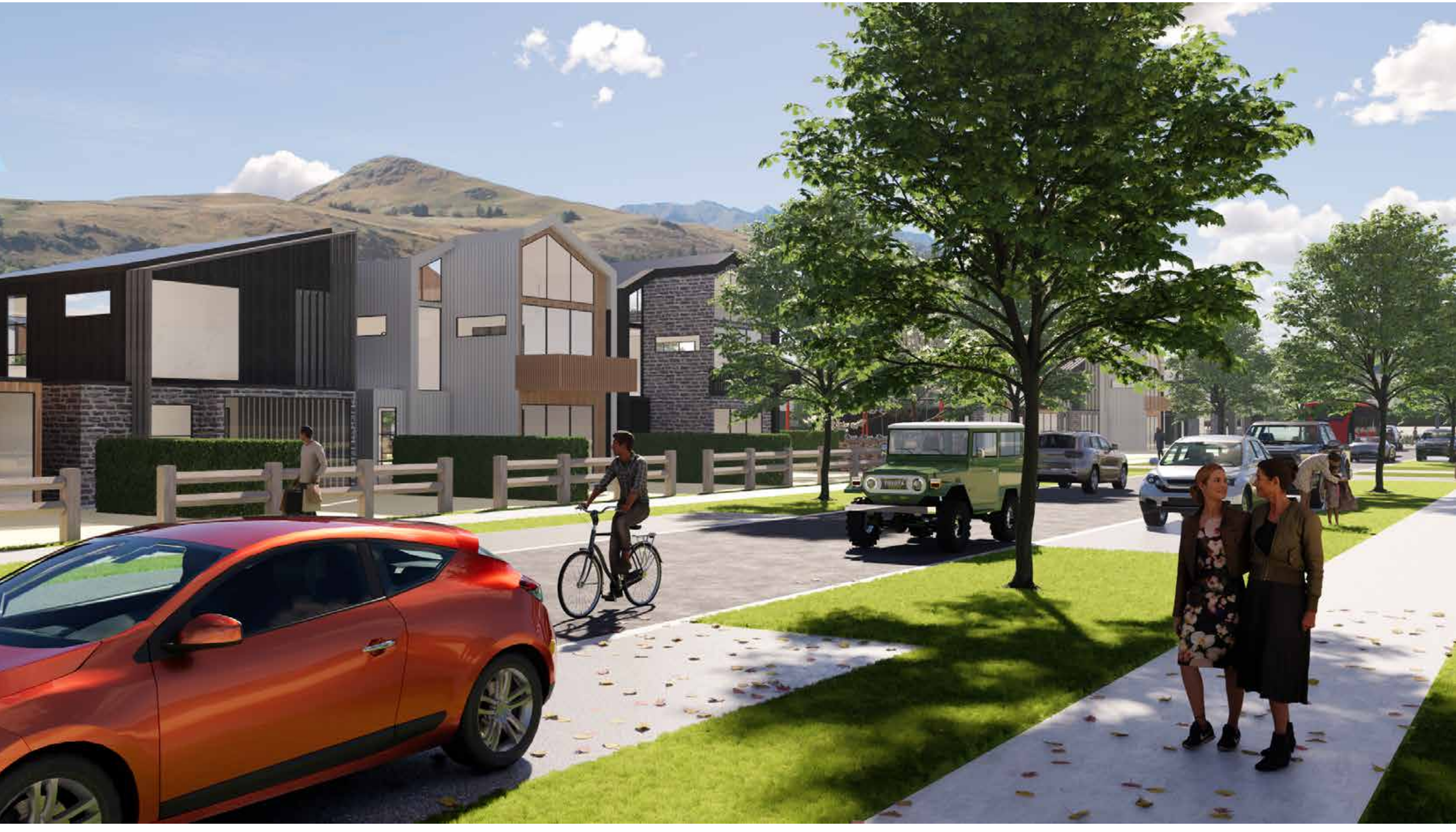
A. VIEW LOOKING NORTH WITHIN FLINTS PARK

client / project name: GLENPANEL / INDICATIVE DEVELOPMENT ILLUSTRATIONS drawing name: VIEW LOOKING NORTH WITHIN FLINTS PARK designed by: DAVID COMPTON-MOEN drawn by: ANCA BELU / ZOE HUGHES / JEREMY ROSS original issue date: 7 DECEMBER 2023