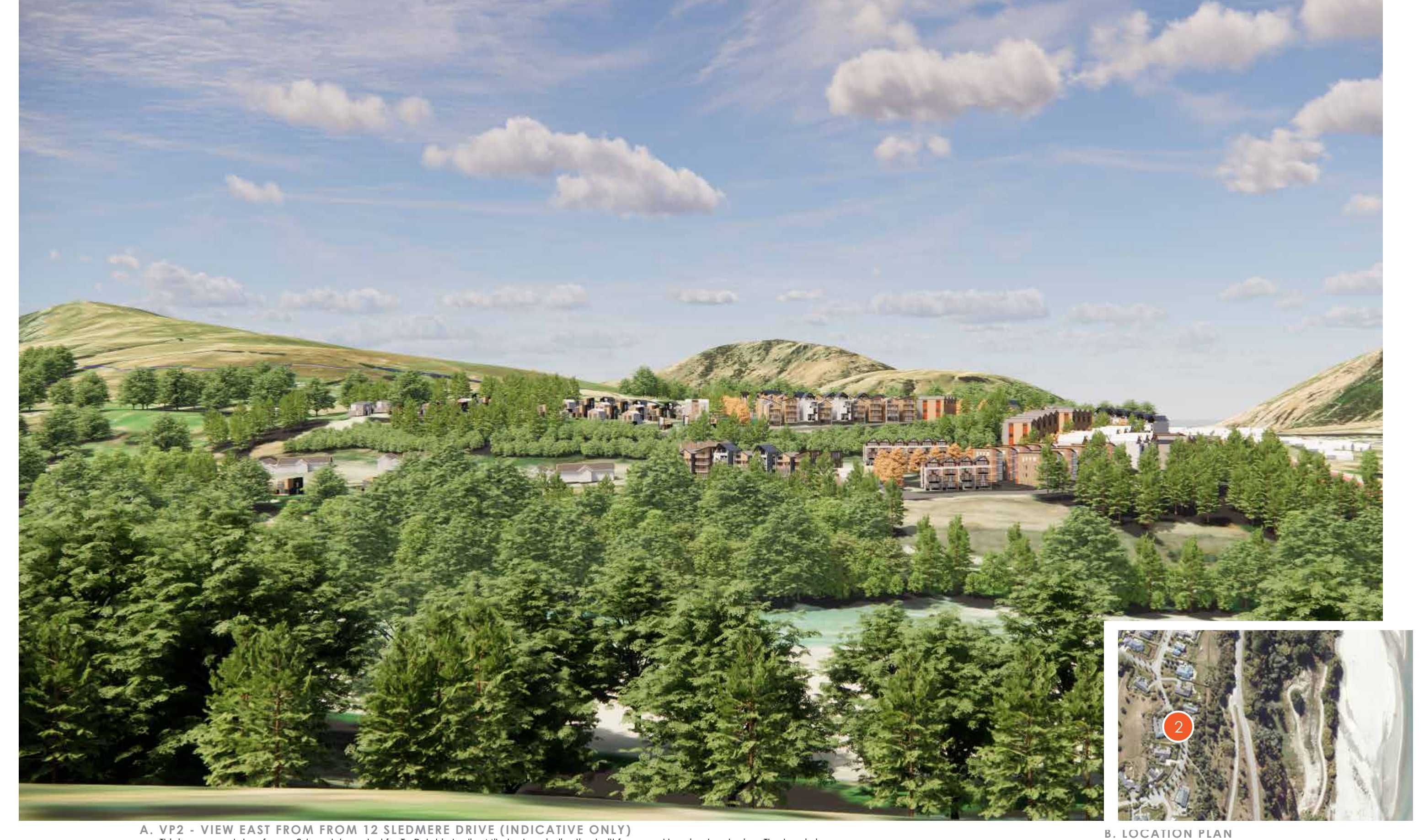
This image was taken from a 3d model created for Te Putahi - Ladies Mile to show indicative built forms and housing typologies. The terrain is sourced from Google Earth and has been imported into the model.

client / project name: GLENPANEL / INDICATIVE DEVELOPMENT ILLUSTRATIONS drawing name: VP2 - EAST FROM FROM 12 SLEDMERE DRIVE