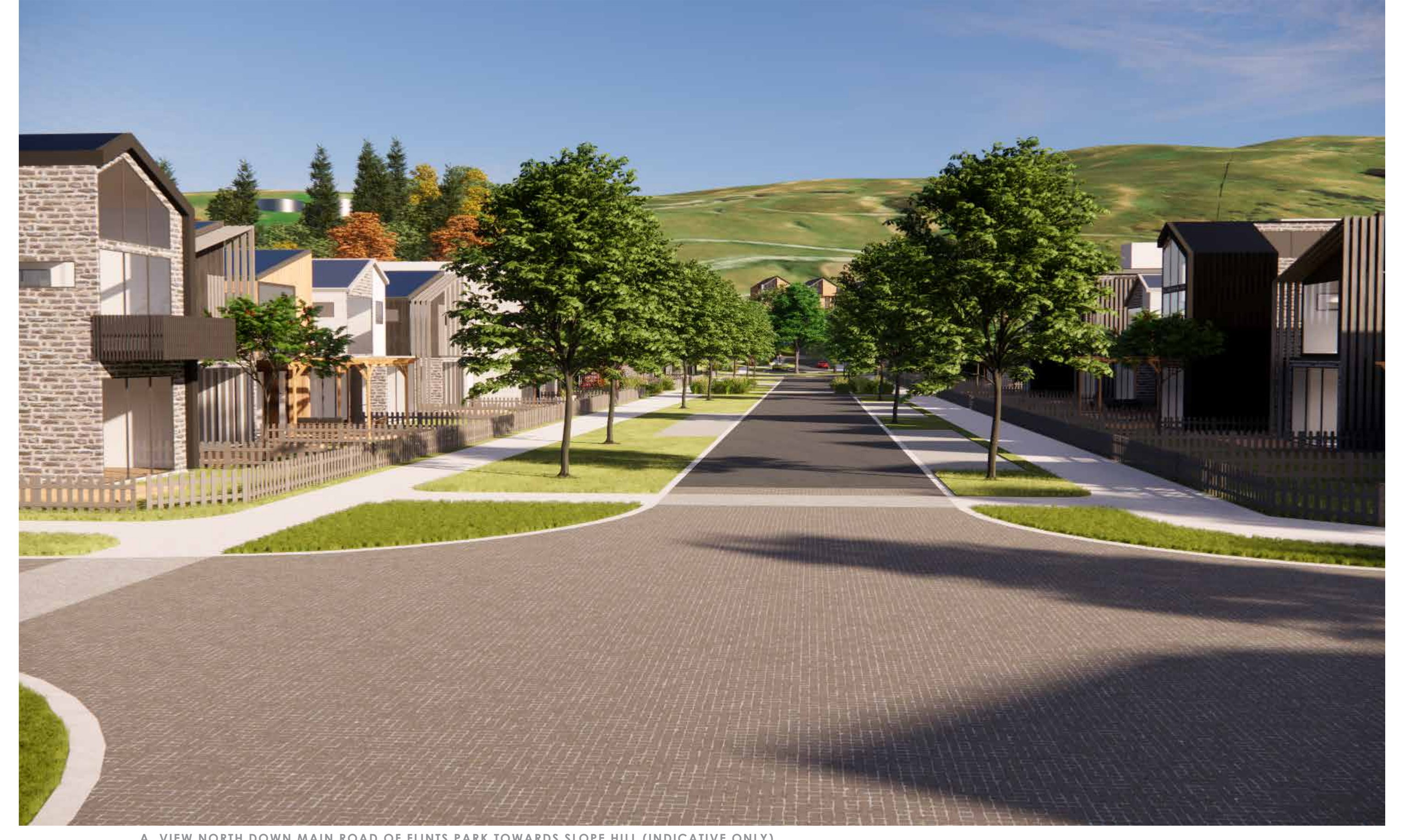
A. VIEW NORTH DOWN MAIN ROAD OF FLINTS PARK TOWARDS SLOPE HILL (INDICATIVE ONLY) This image was taken from a 3d model created for Te Putahi - Ladies Mile to show indicative built forms and housing typologies. The terrain is sourced from Google Earth and has been imported into the model.

client / project name: GLENPANEL / INDICATIVE DEVELOPMENT ILLUSTRATIONS