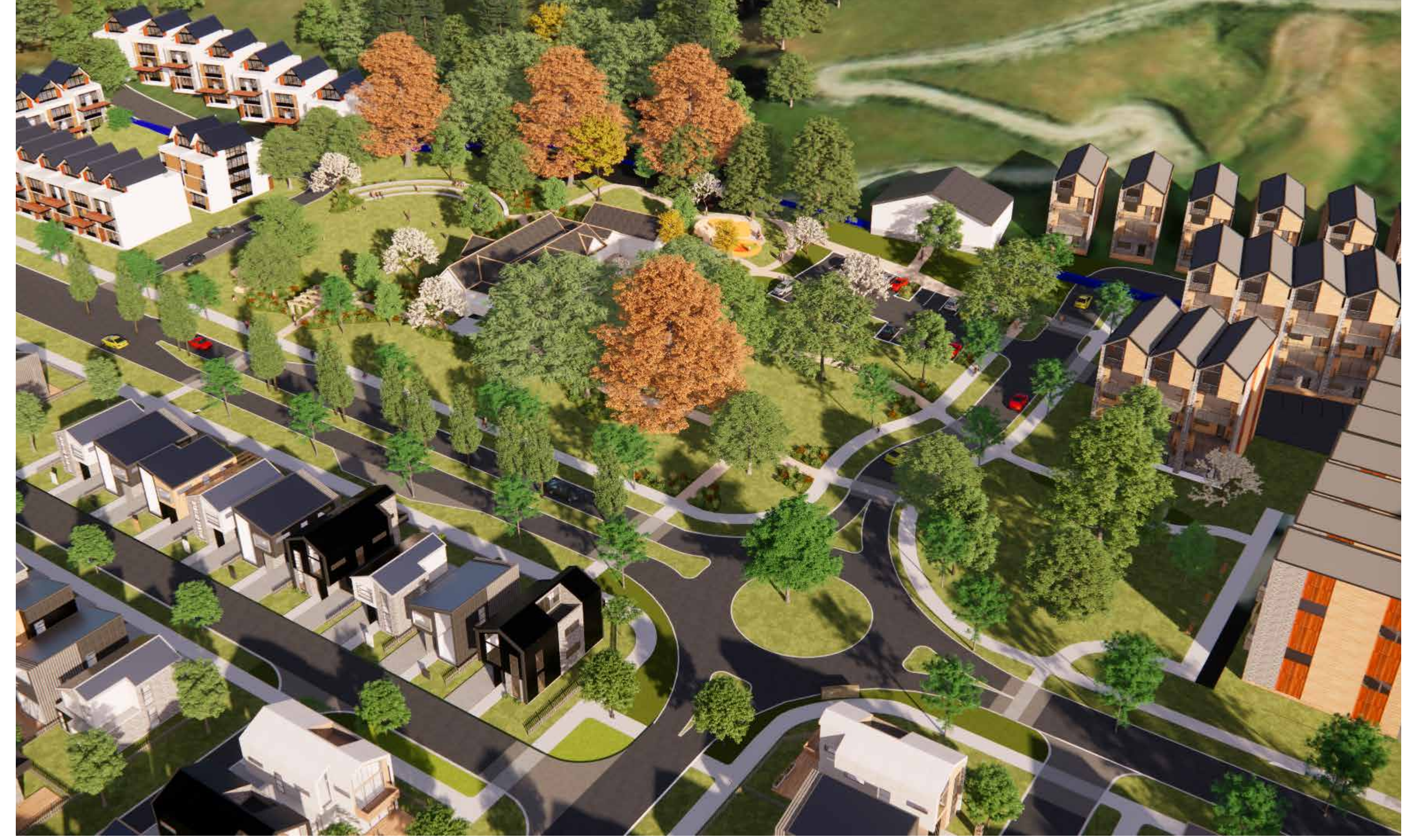
A. ELEVATED VIEW OF HOMESTEAD AREA This image was taken from a 3d model created for Te Putahi - Ladies Mile to show indicative built forms and housing typologies. The terrain is sourced from Google Earth and has been imported into the model.

client / project name: GLENPANEL / INDICATIVE DEVELOPMENT ILLUSTRATIONS drawing name: ELEVATED VIEW OF HOMESTEAD AREA designed by: DAVID COMPTON-MOEN | ANCA BELU drawn by: ANCA BELU / ZOE HUGHES / JEREMY ROSS original issue date: 7 DECEMBER 2023