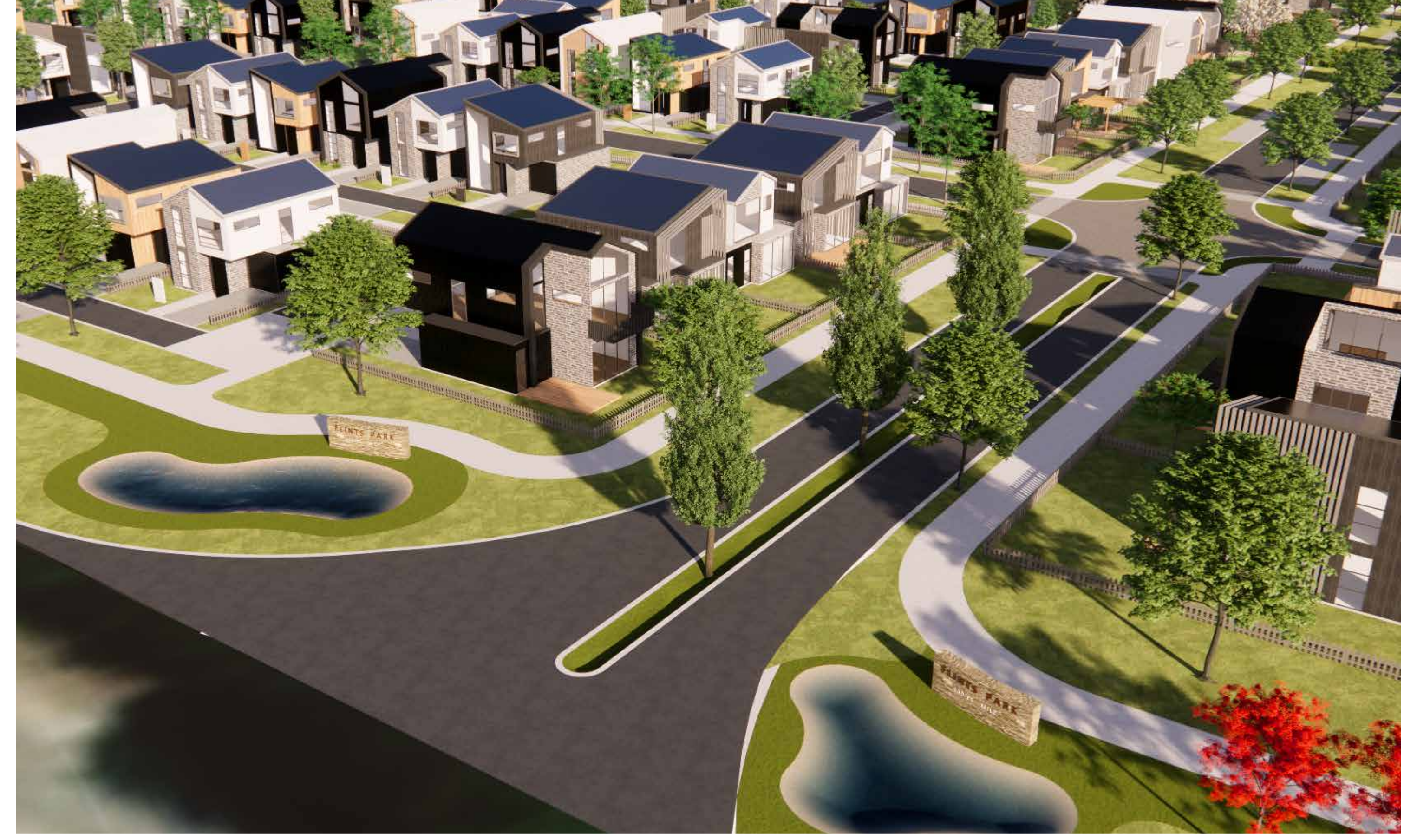
A. ENTRANCE INTO FLINTS PARK WITH A 25M SETBACK This image was taken from a 3d model created for Te Putahi - Ladies Mile to show indicative built forms and housing typologies. The terrain is sourced from Google Earth and has been imported into the model.

client / project name: GLENPANEL / INDICATIVE DEVELOPMENT ILLUSTRATIONS drawing name: ENTRANCE INTO FLINTS PARK WITH A 25M SETBACK designed by: DAVID COMPTON-MOEN drawn by: ANCA BELU / ZOE HUGHES / JEREMY ROSS