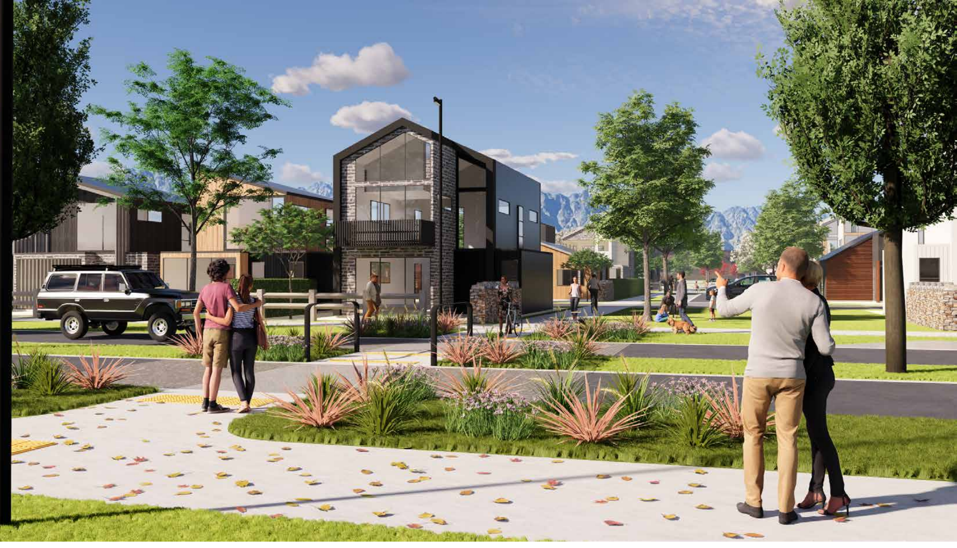
A. VIEW FROM NORTHERN COLLECTOR ROAD LOOKING SOUTH DOWN LOCAL ROAD

client / project name: GLENPANEL / INDICATIVE DEVELOPMENT ILLUSTRATIONS drawing name: VIEW FROM NORTHERN COLLECTOR ROAD designed by: DAVID COMPTON-MOEN drawn by: ANCA BELU / ZOE HUGHES / JEREMY ROSS original issue date: 7 DECEMBER 2023