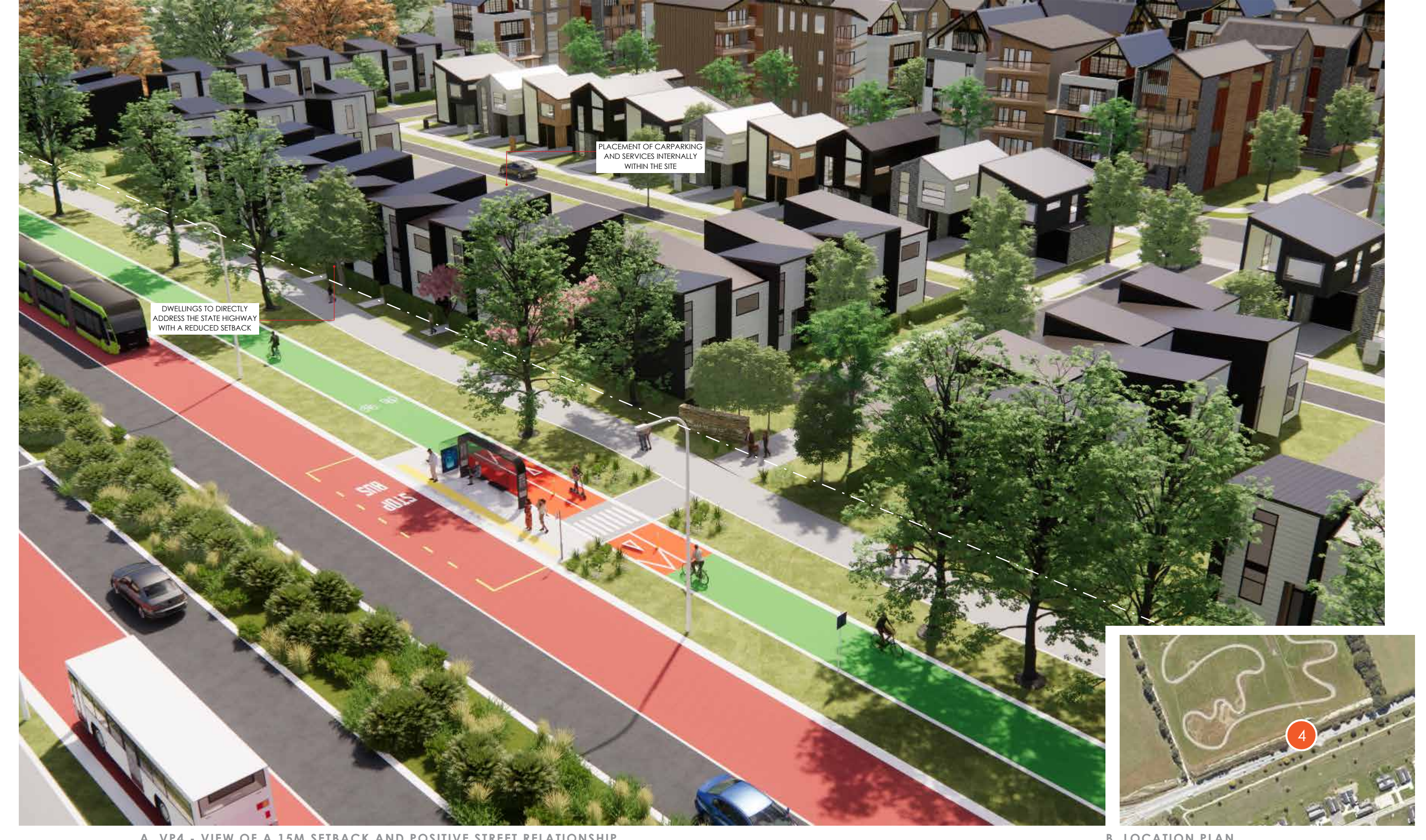
A. VP4 - VIEW OF A 15M SETBACK AND POSITIVE STREET RELATIONSHIP This image was taken from a 3d model created for Te Putahi - Ladies Mile to show indicative built forms and housing typologies. The terrain is sourced from Google Earth and has been imported into the model.