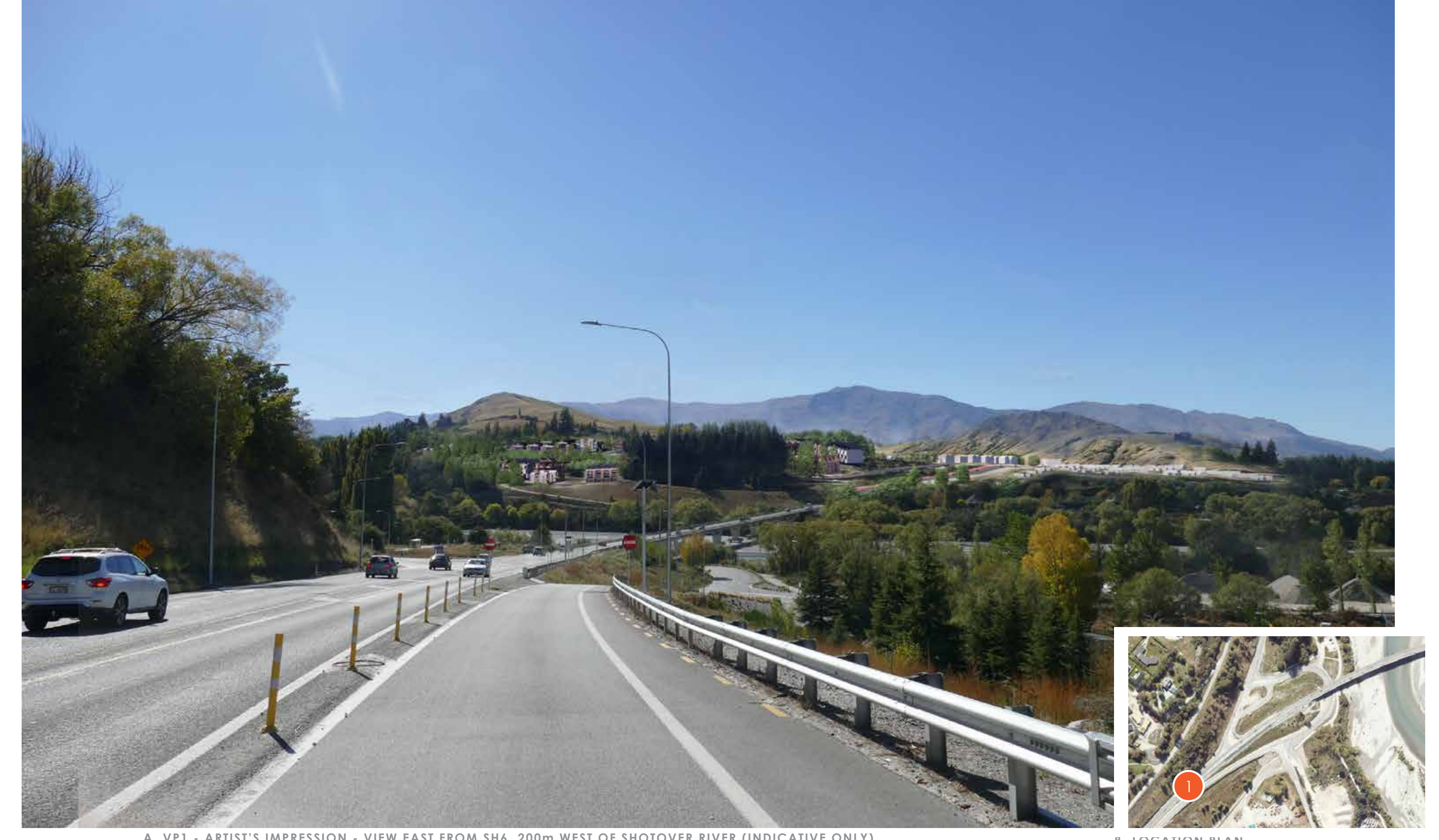
A. VP1 - ARTIST'S IMPRESSION - VIEW EAST FROM SH6, 200m WEST OF SHOTOVER RIVER (INDICATIVE ONLY) Base photo sourced from the evidence of Mr Skelton and modified using Sketchup and Photoshop CS. The Anna Hutchinson Site has been modelled in Sketchup with indicative house typologies inserted to provide a indicative built form and visual appearance