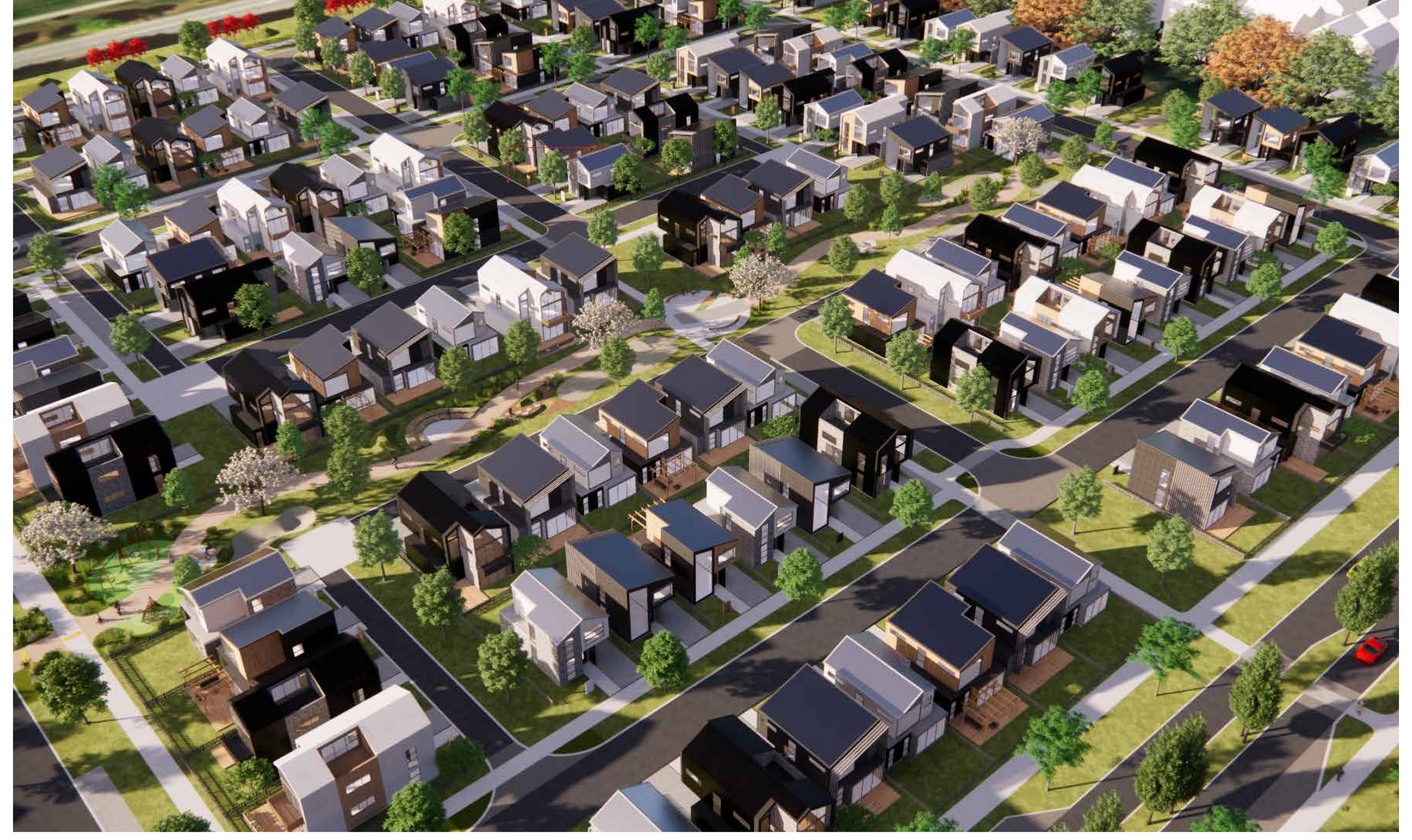
A. ELEVATED VIEW SOUTH TOWARDS SH6 FROM ABOVE THE HOMESTEAD (INDICATIVE ONLY) This image was taken from a 3d model created for Te Putahi - Ladies Mile to show indicative built forms and housing typologies. The terrain is sourced from Google Earth and has been imported into the model.

client / project name: GLENPANEL / INDICATIVE DEVELOPMENT ILLUSTRATIONS drawing name: ELEVATED VIEW SOUTH TOWARDS SH6 designed by: DAVID COMPTON-MOEN | ANCA BELU drawn by: ANCA BELU / ZOE HUGHES / JEREMY ROSS original issue date: 7 DECEMBER 2023