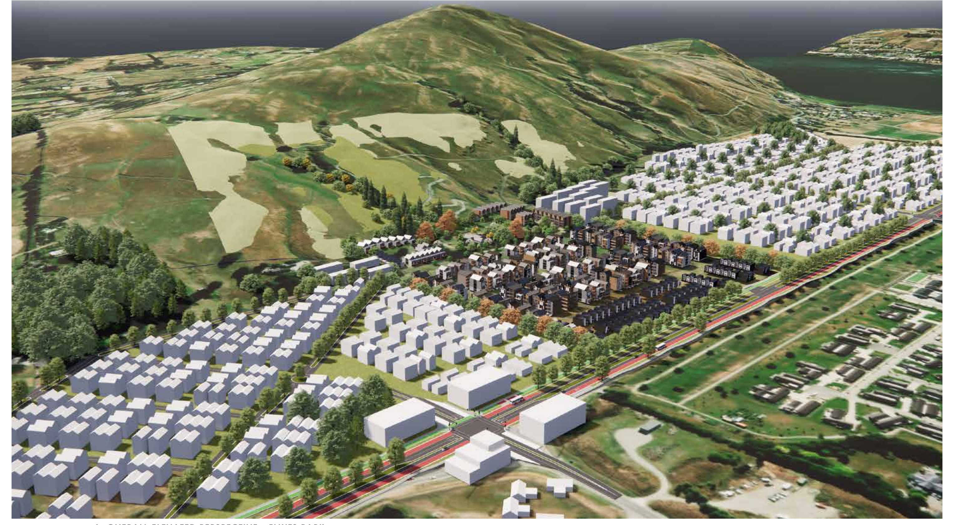
A. OVERALL ELEVATED PERSPECTIVE - FLINTS PARK This image was taken from a 3d model created for Te Putahi - Ladies Mile to show indicative built forms and housing typologies. The terrain is sourced from Google Earth and has been imported into the model.

client / project name: GLENPANEL / INDICATIVE DEVELOPMENT ILLUSTRATIONS drawing name: