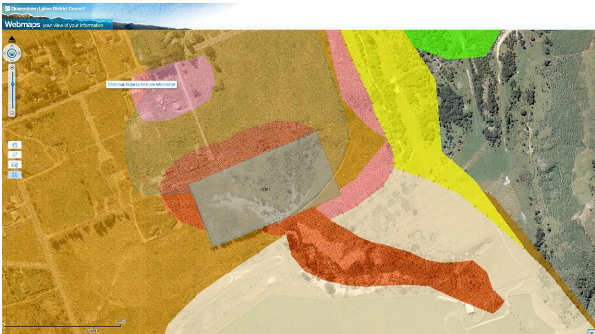
Figure 1 – Lot DP 394250 Currently Mapped Landfill Shown Brown in Council Hazard Maps. Source – QLDC Website 06.03.15