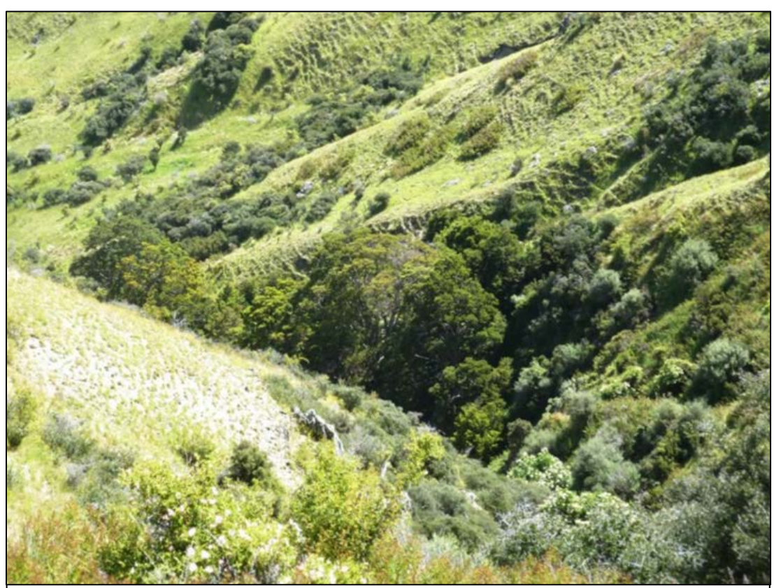
Figure 3: Photograph of beech forest – Olearia and briar – zoom view from waypoint 27; 20/12/2011.