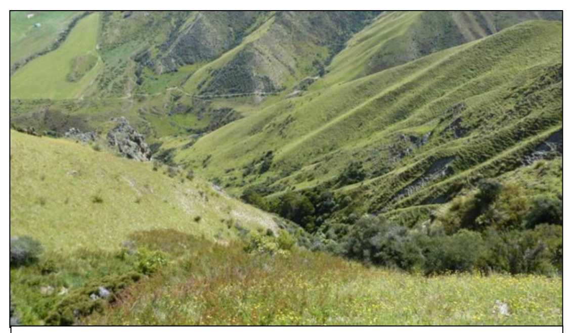
Figure 2: Above: kanuka – Matagouri – Coprosma – Olearia shrubland with beech forest - view west from waypoint 27 (GR 1288742E 5036330N). Photograph taken by Dawn Palmer 20 December, 2011.