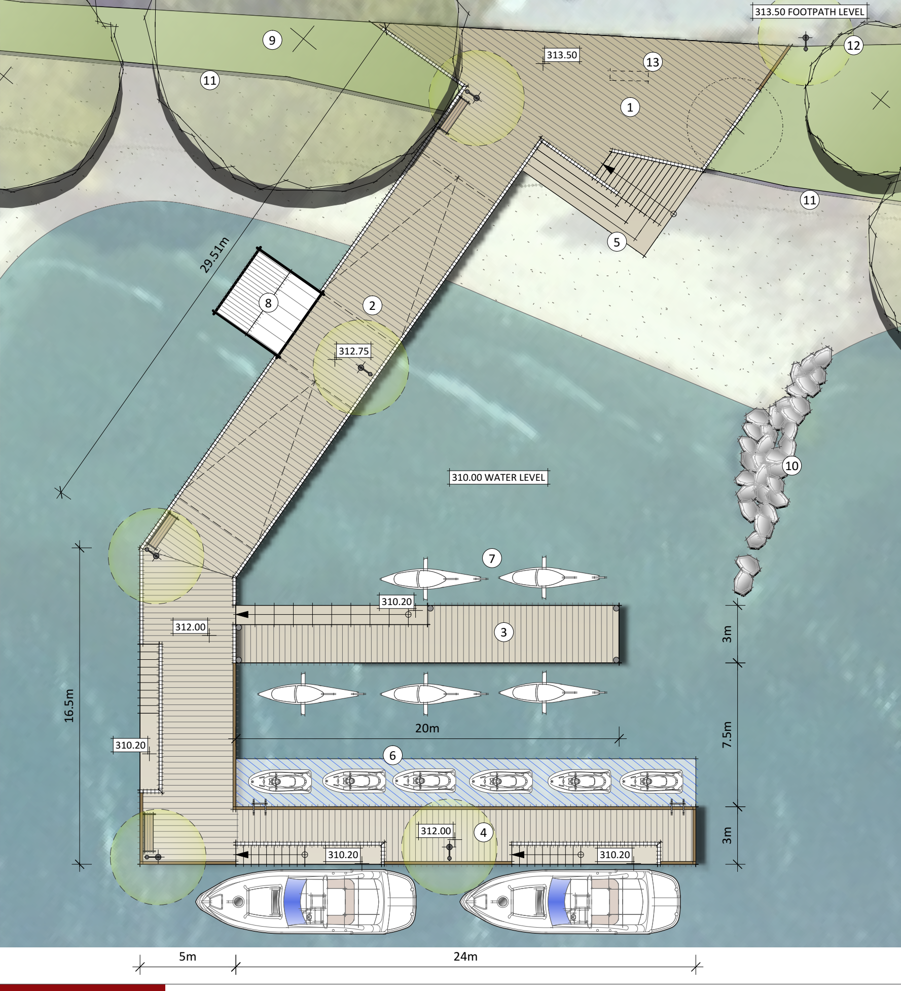
rough & milne landscape architects

2. Boat sizes and locations are indicitive.