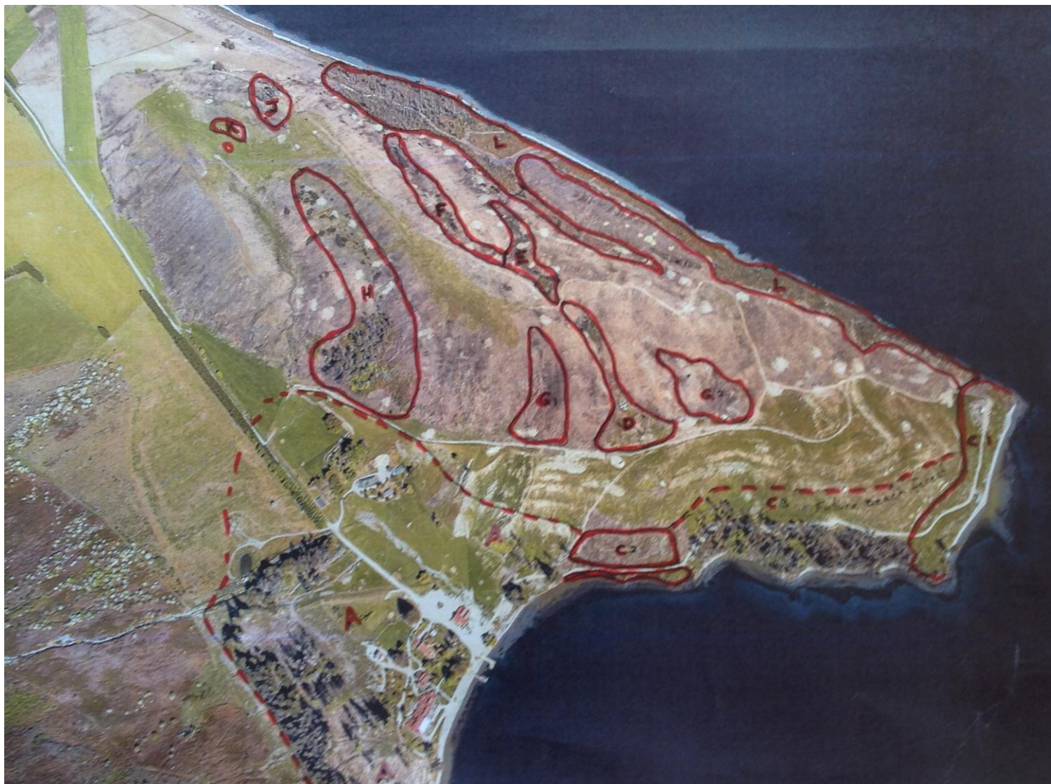
Plan of Areas referred to above (A to L).