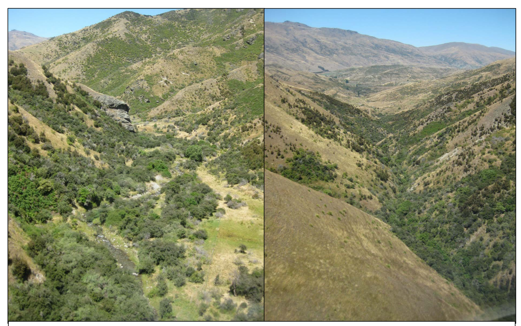
Figure 2: Photographs of sections of the area of potential significance.