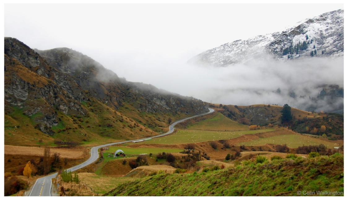
Photograph 5. Littles Road rural landscape

5.10 The vineyard landscapes convey a strong ordered horizontal pattern of parallel lines comprising posts, wires and vines. The vineyard pattern conveys a sense of scale and perspective, emphasising the subtleties of the underlying landform. Shelter belts and amenity trees typically comprise the immediate setting surrounding large scale buildings – storage sheds, barns, winery production and cellar doors. The productive promise, linked to cultural traditions and lifestyle, convey a particularly romantic picturesque notion of landscape.