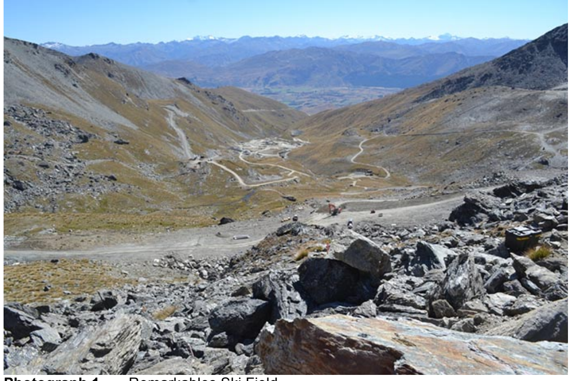
Photograph 1. Remarkables Ski Field

5.4 Ski field areas are for operational reasons located within a highly natural, expansive open landscape dominated by rock features, scree slopes and low growing alpine vegetation. Modifications to the landform are obvious. The buildings and ski lifts tend to be large scale, utilitarian and functional.