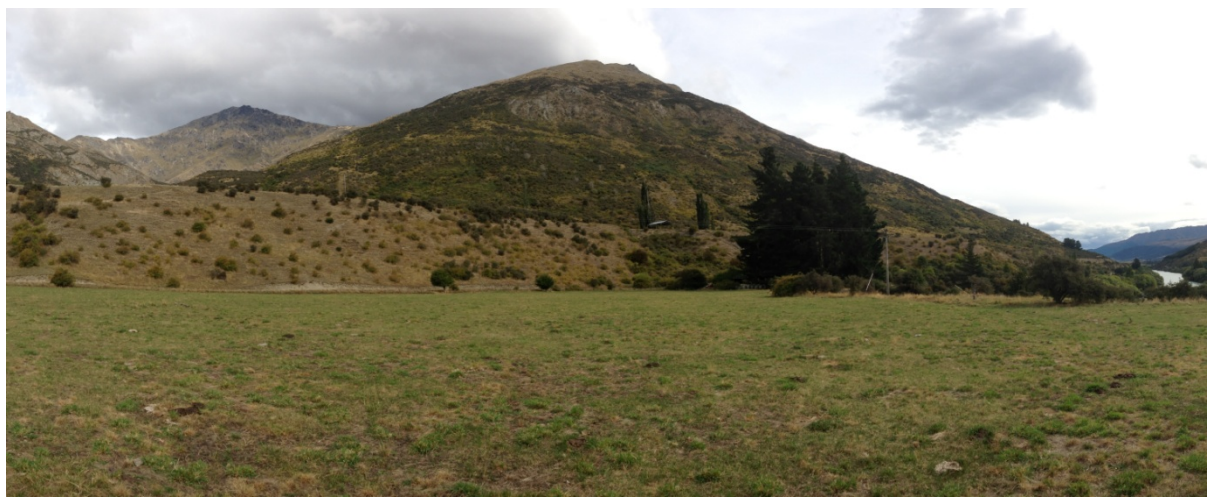
Photograph 4. Kawarau River Terrace and north facing slopes of the Remarkables Range

regime. Consequently they are obviously domesticated and of moderate – low naturalness.