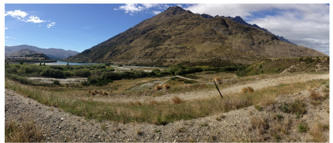
Photograph 11. North face of Remarkables Range

6.5 Other rural landscapes, such as the northern face of the Remarkables Range are recognised as an ONL with an open character and as contributing to a rural backdrop. Despite this, the introduction of a gondola (as mentioned in Mr Greenaway's evidence) to the Remarkables Ski Area is likely to be seen as an appropriate development in this locality, with the ability to benefit recreational and tourism experiences, without adverse effects on values afforded by the open character and rural outlook.