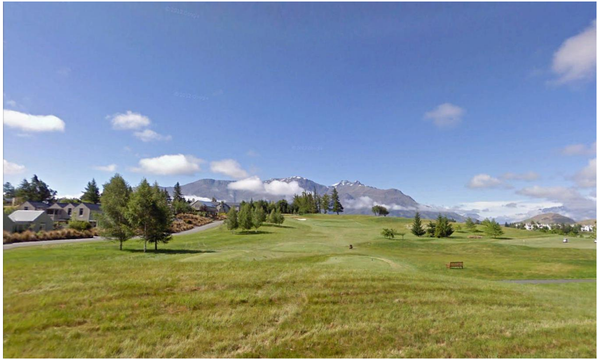
Photograph 7. Millbrook