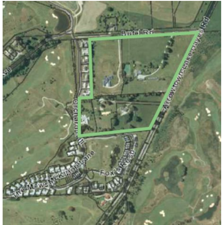
Figure 1: The area of land referred to as the Arrowtown – Lake Hayes land

The second land area is hereon referred to as the Malaghans Road land which is 1124 Malaghans Road as identified in Figure 2 below: