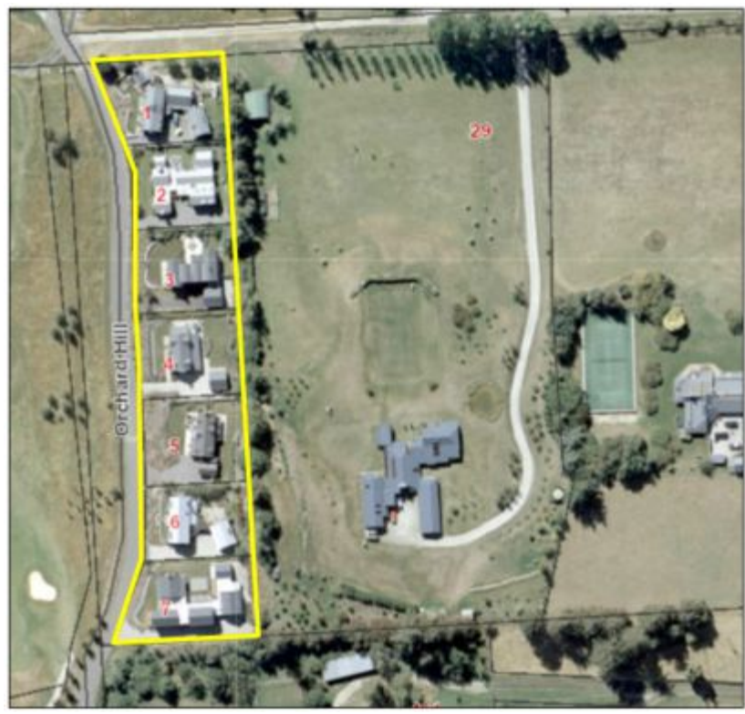
Figure 5: Lots located within the R1 activity area (approx.) highlighted in yellow

59. Within the R1 activity area the allotments are just over 1,000m<sup>2</sup> in size and they all adjoin the western boundary of 29 Butel Road. All of these lots contain a residential unit with vehicular access being from Orchard Hill. The lots within the R1 activity area are identified in Figure 5 below.