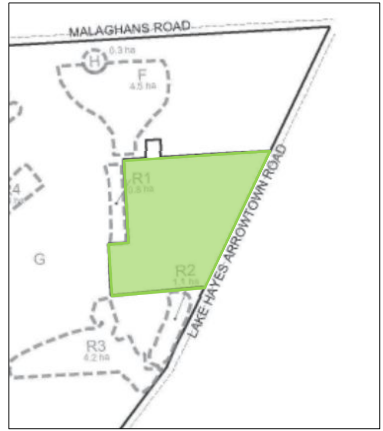
Figure 4: MRZ structure plan except showing the Residential and Recreational activity areas adjacent to the Arrowtown – Lake Hayes site (shown as green)

Residential development within the R1 – R3 activity areas has been established and the density varies.