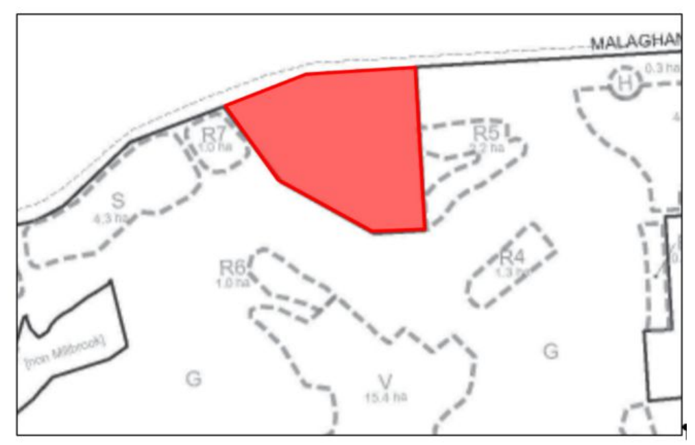
Figure 7: MRZ structure plan except showing the Residential activity areas adjacent to the Malaghans Road site (shown as red)

69. Residential development within the R4, R5 and R6 activity areas has been established as shown in Figure 8 below.