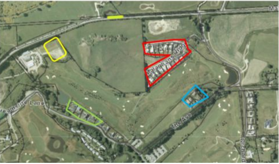
Figure 8: Approximate location of the R4 (outlined in blue), R5 (outlined in red), R6 (outlined in green) and R7 (outlined in yellow) activity areas and the existing development