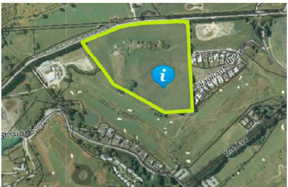
Figure 2: The area of the land referred to as the Malaghans Road land

The second land area is hereon referred to as the Malaghans Road land which is 1124 Malaghans Road as identified in Figure 2 below: