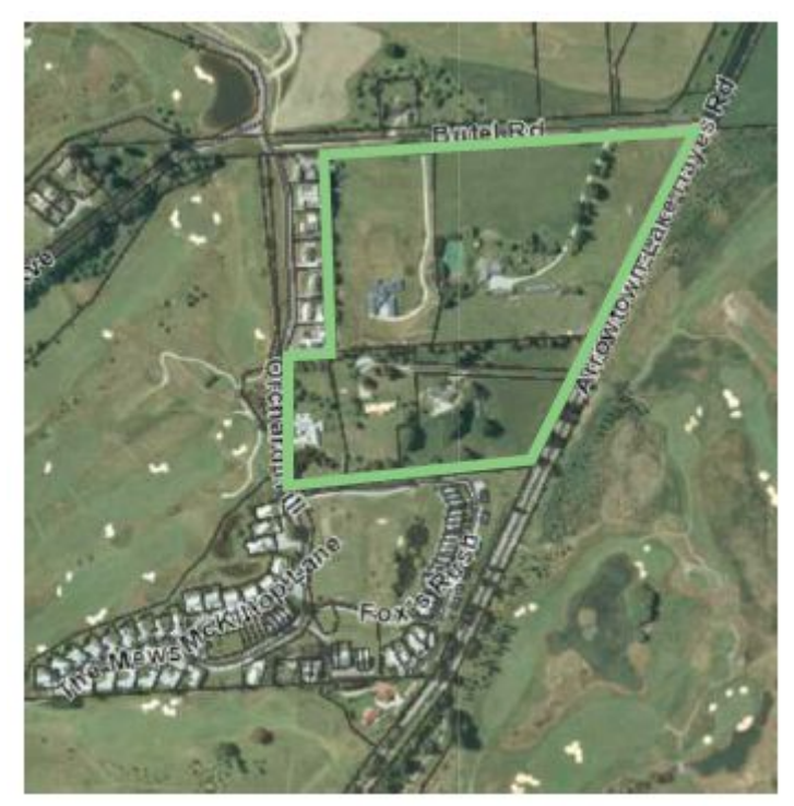
Figure 1: Land to which the Boundary Trust (Submitter 2444) and Spruce Grove Trust (Submitter 2512) submissions relate