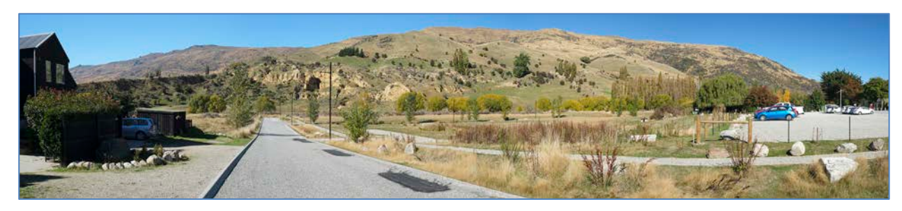
Looking down Soho Street towards the Cardrona River and Mt Pisa Range