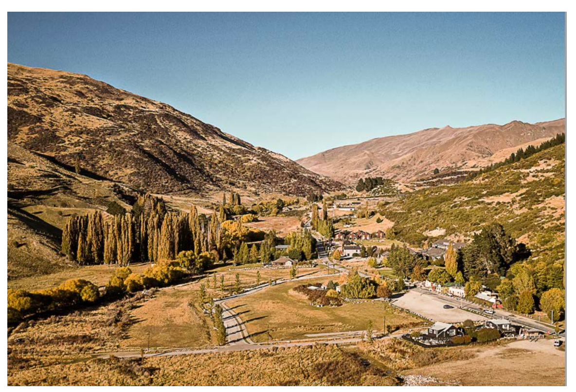
Elevated overview of Cardrona looking from the north across Soho Street, Rivergold Way, Cardrona Valley Road and the river fairway to the left (east)

25. Much newer is the straight line of Soho Street, which crosses the 'T' to run at right-angles to Cardona Valley Road and extend eastwards, towards the river fairway, while Rivergold Way runs in an arc from its intersection with Cardona Valley Road near Benbrae Estate to intersect with Soho Street near the river (see photo overleaf). In addition, consent has been granted to CVL for development of a lodge, spa and 48 visitor accommodation / residential units across the river, running down the narrow strip of its eastern flank.