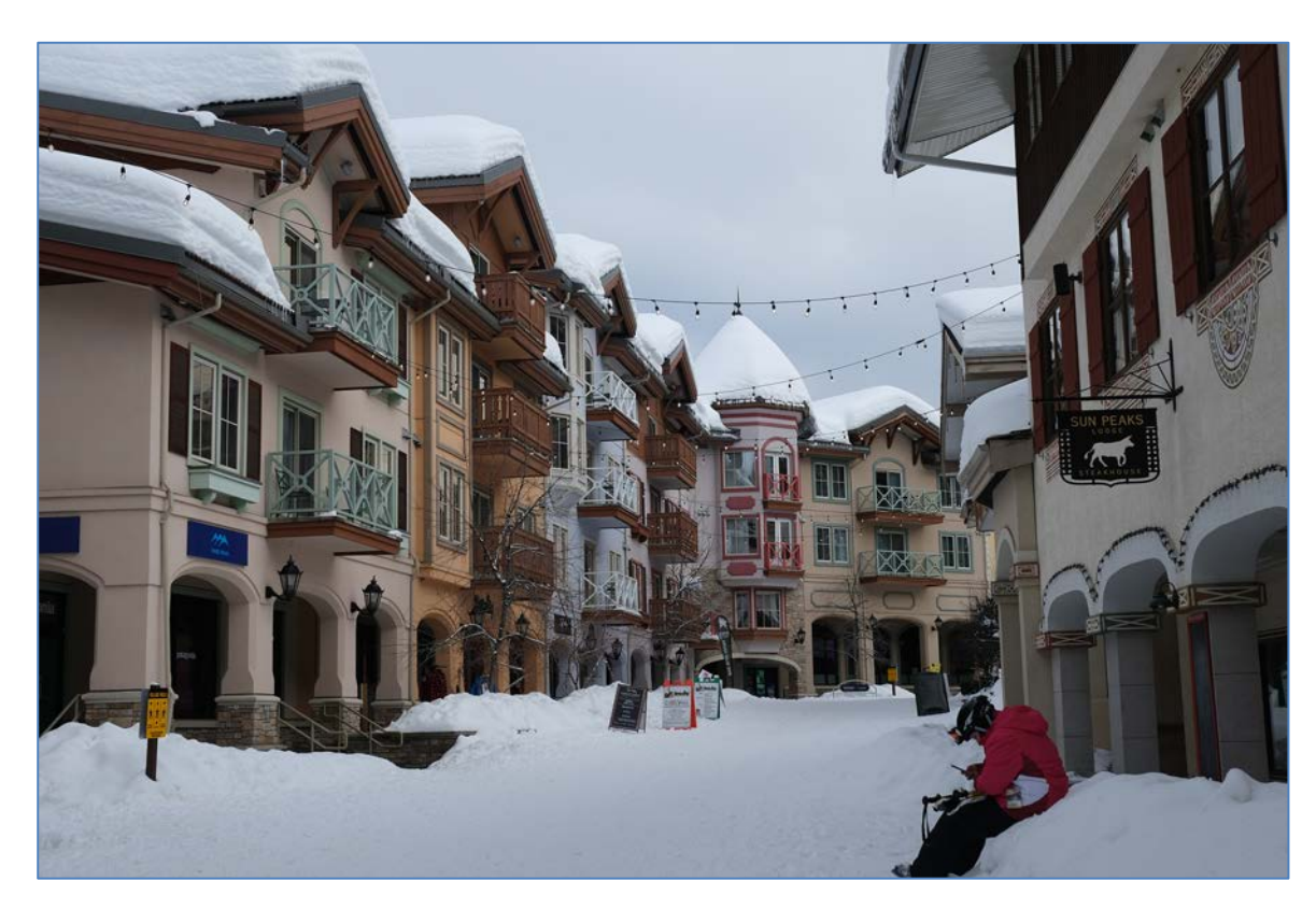
Sun Peaks, British Columbia: a purpose built village with retail activity, hotels & visitor accommodation aligned both at ground level and above

In a related vein, most modern mainstreets now rarely comprise discrete blocks of just commercial development and just visitor accommodation development. That historic pattern – aligned with the sort of single-storey development that is, for example, prevalent in Arrowtown – has long been superseded by multi-storey buildings and the related integration of both commercial and residential activities. Indeed, most hotels, within resort villages and elsewhere, typically align their at-grade foyers – often flanked by commercial premises – with the frontages and balconies of their accommodation above. Their integration with other commercial development and visitor accommodation either side is also usually quite seamless, without any 'stepping in and out' on the basis of internal activities. This often makes it difficult to easily ascertain where hotels, or indeed other forms of commercial / retail development, begin and end, which is beneficial in the context of most village environments.