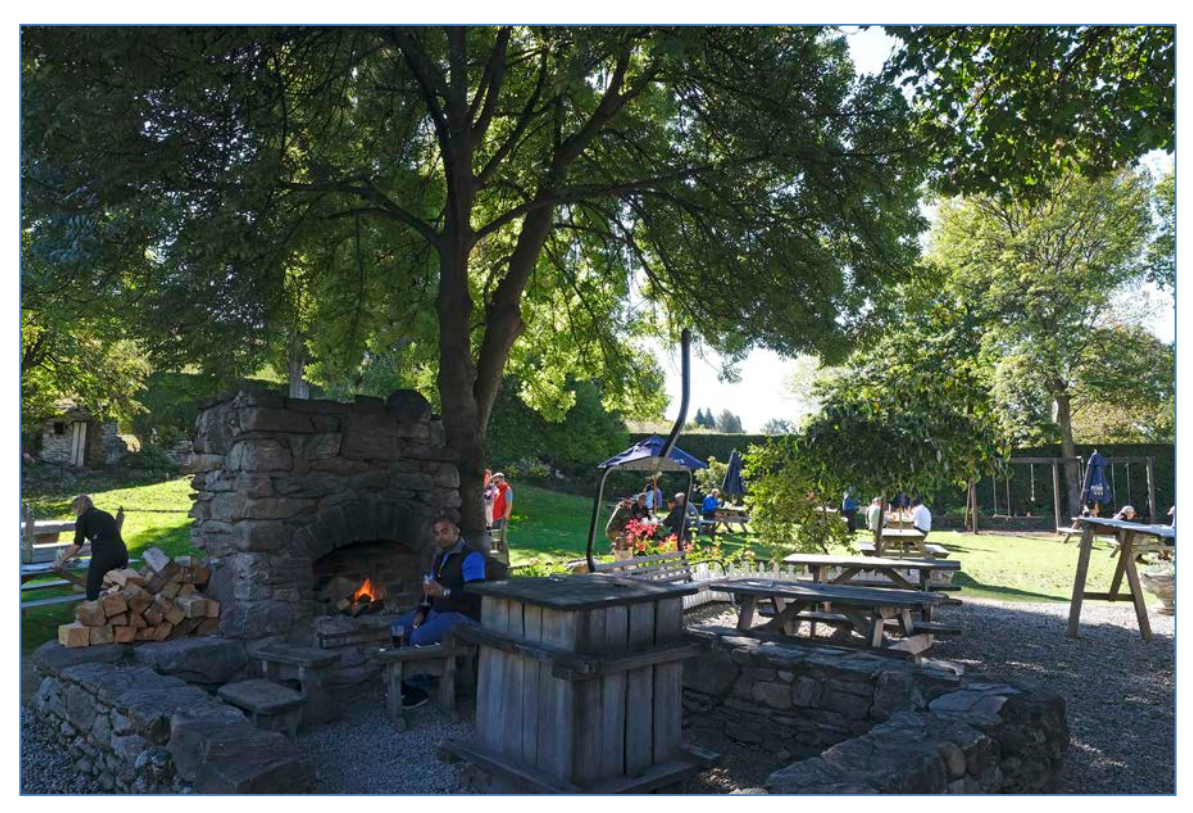
The Cardrona Pub courtyard