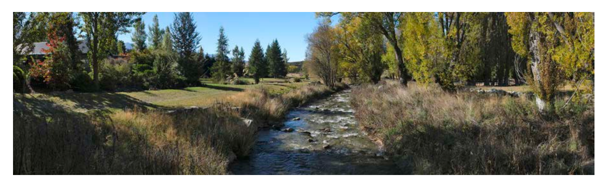
The Cardona River roughly parallel with the southern end of Benbrae Estate & The Rabbit Hole

28. The area in which the river course is to be realigned lies within this lower area, in which the river's definition is much more reliant on the vegetation around it than on the actual course and water channel – at least visually. The following photos depict this transition: