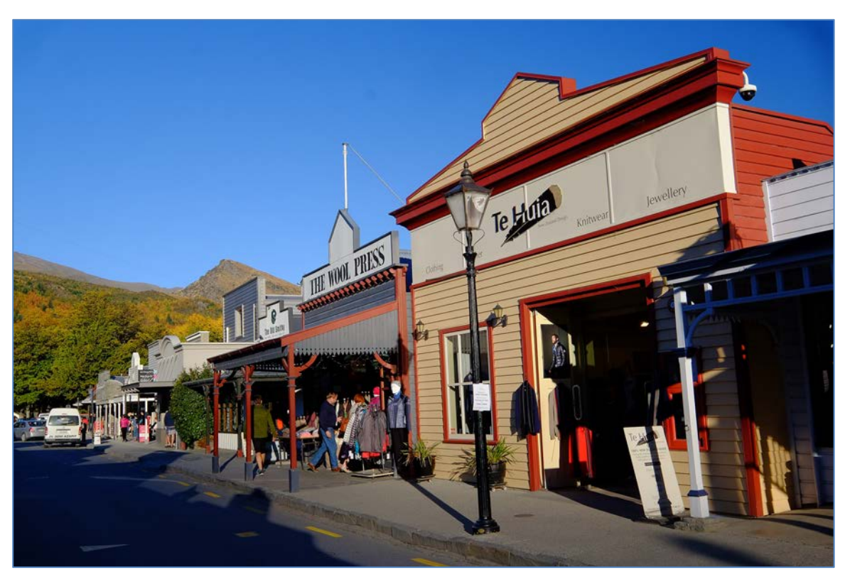
Buckingham Street, Arrowtown