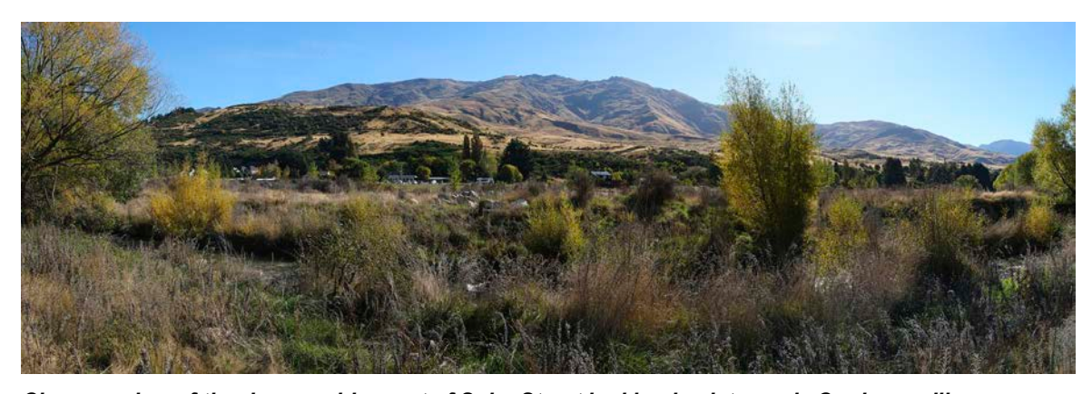
Close-up view of the river corridor east of Soho Street looking back towards Cardrona village