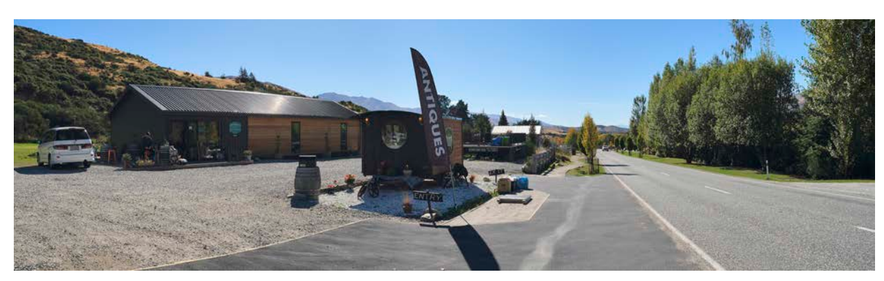
Commercial activities at the southern entrance to Cardrona