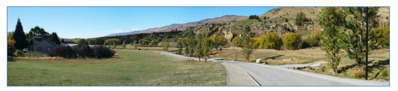
Looking down Rivergold Way towards the Cardrona River and Mt Pisa Range