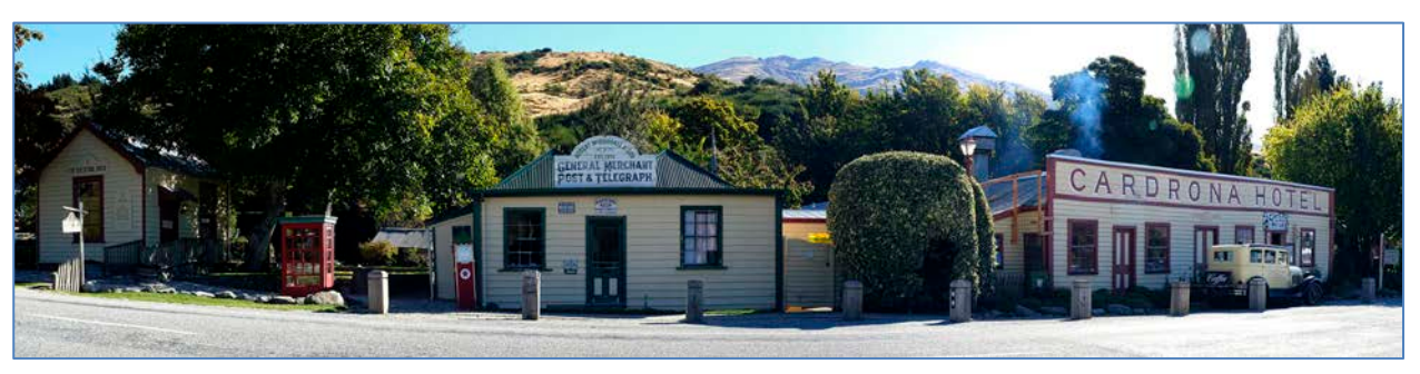
The historic core of Cardrona