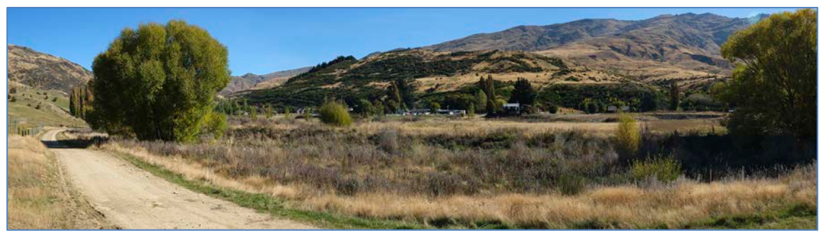
Panoramic view over the river corridor towards Soho Street, Rivergold Way & Cardrona village