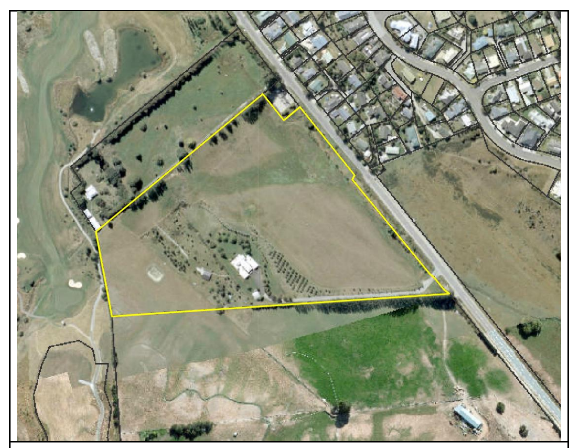
Figure 3: Area showing Banco Trustee & Ors submission