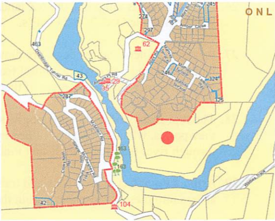
Figure 4 - Excerpt from 2015 QLDC Notified Map 39a. Red dot added to show the location of land subject to C150/2019 decision