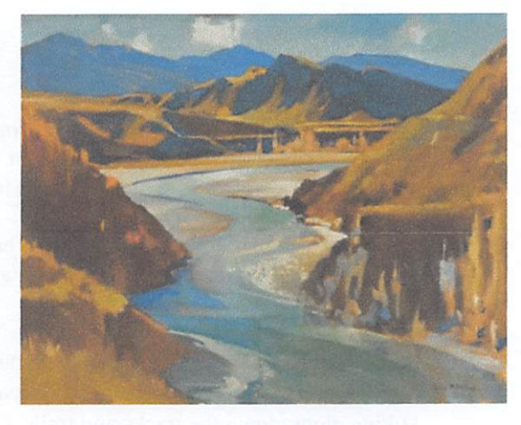
Figure 5 - Shotover River by Peter McIntyre