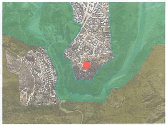
Figure 2 - Screenshot from QLDC Landscape Schedules GIS Map. Taken 3/4/22. Red dot added to show the location of land subject to C150/2019 decision