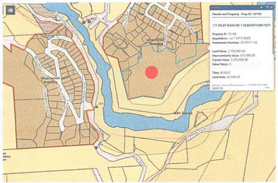
Figure 3 – Screenshot from QLDC PDP GIS Map. Taken 3/4/22. Red dot added to show the location of land subject to C150/2019 decision