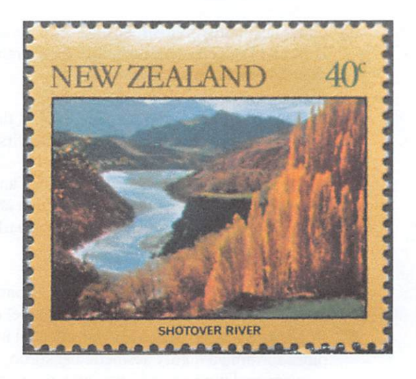
Figure 6 - NZ Post 1981 Scenery Series Shotover River 40c Stamp

45. In 1981 New Zealand Post produced a NZ Scenery Series of Stamps showing the same view of the Shotover River from the same vantage point. See Figure 6.