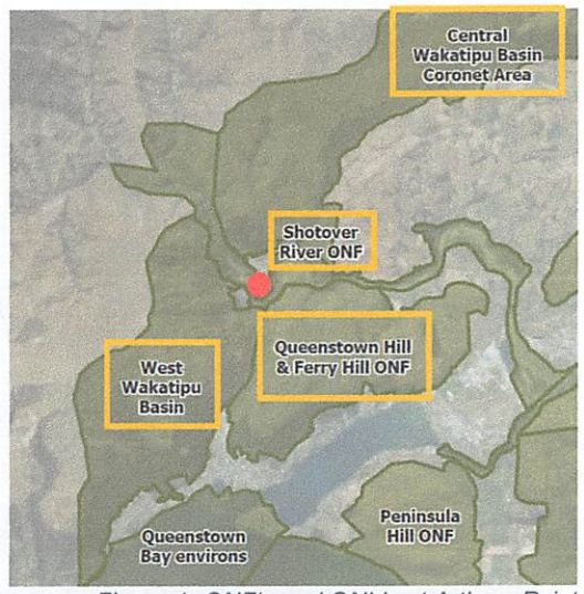
Figure 1- ONF's and ONL's at Arthurs Point