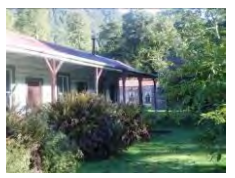
Annex with Paradise House wing in background

ENTERED BY: Rebecca Reid DATE ENTERED: June 2005