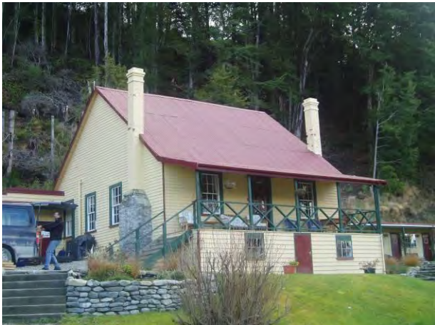
Kinloch Accommodation Lodge June 2005