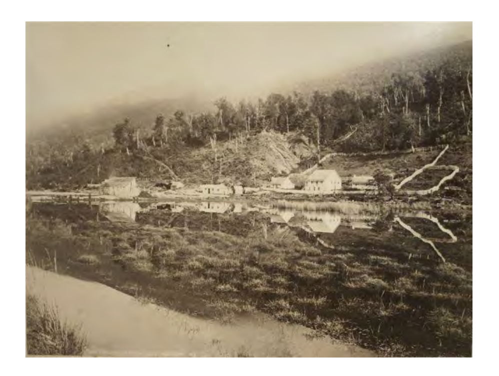
Kinloch, circa 1870's. Shows Kinloch lodge central building with two accommodation lodges either side. (EL 4203 in EA37 LDM)

Consideration should be given to ensuring the protection of the spaces around the building which provide a vital part of the buildings heritage value in context with its landscape setting. This could easily be eroded if any building was to be constructed behind the lodge or if for example the front garden area to the road was altered in a major way. Any consideration of rebuilding to either side of the existing structure should take into account that at present you can clearly read the shape of the historic building and that the side elevations form a large part of its aesthetic and architectural appeal.