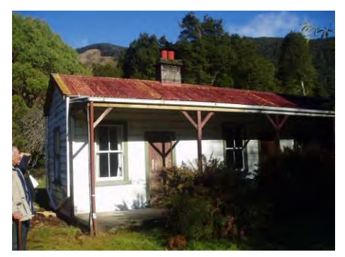
Part of the Annex,

At present the main house is in fair - poor condition. While some general maintenance has helped keep the interior dry there is a need to establish an overall plan for the buildings" future as soon as possible if it is to be preserved and used in the future as part of the accommodation or as an education venue. Given its importance in local, regional and national history the building is in a good position to qualify for heritage funding from various sources.