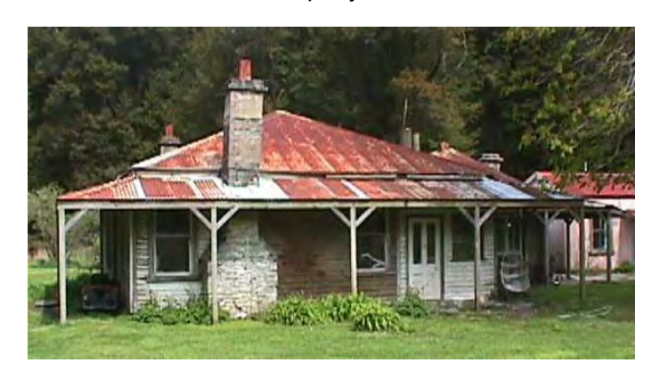
Paradise House side elevation