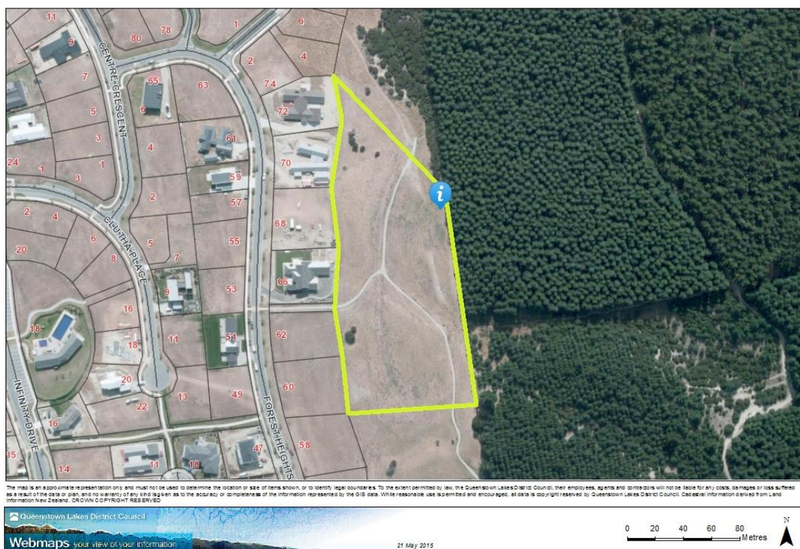
Figure 3 – Lot 722 DP 412667 Shown in Yellow. Source – QLDC Website 21.05.15

The overall cover letter for the Designations Chapter work includes a web link which will enable interested parties to view this change on the proposed planning maps.