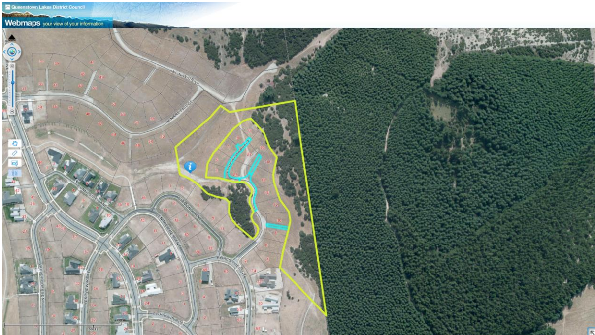
Figure 2 – Lot 723 DP 473192 Shown in Yellow.