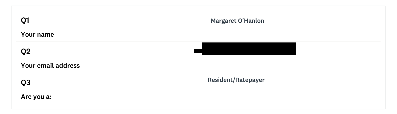
Page 3: Town Centre Arterials - Making it easier to get to and through town.