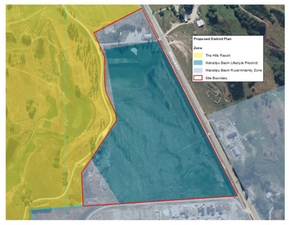
Figure A: Site Plan showing WBLP and WBRAZ zoning within BHT's Site

[14] When asked in cross-examination, Marcus Langman, who was the author of the s32/32AA report for the first instance hearing of submissions on the Basin variation, agreed that no evaluation of a split-zoning treatment of the Site was undertaken for QLDC at the time of the first instance hearing of submissions.<sup>5</sup> That reinforces to us that QLDC did not consciously elect a split-zoning outcome.