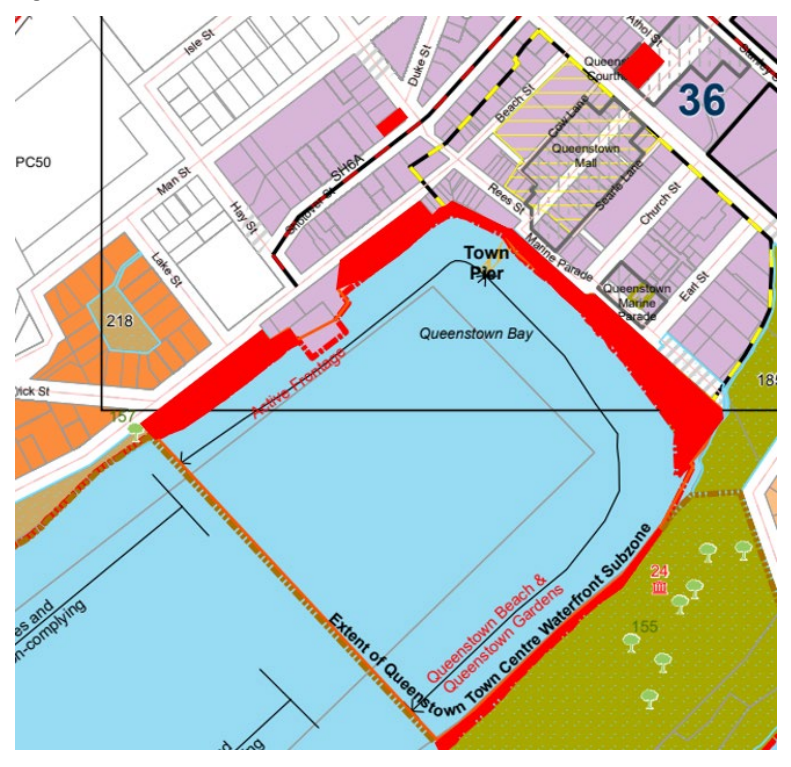
Figure 2 – Queenstown Town Centre