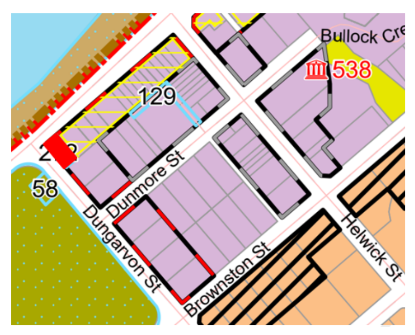
Figure 1 – Wanaka Town Centre

of Civic Space Zone that immediately adjoin the Queenstown, Wanaka, and Arrowtown Town Centre zones.